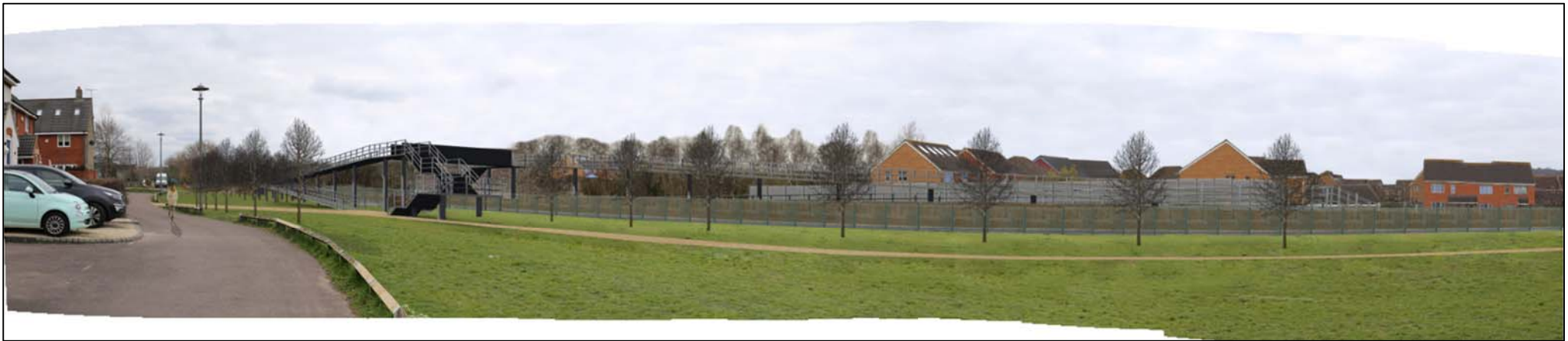
Both Levels - The below shows both levels of the bridge ramps with privacy screens in place.