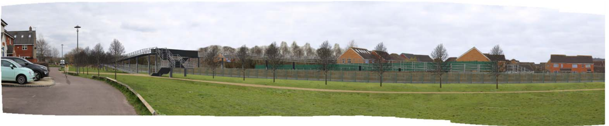
Both levels of ramps shown with the privacy screens in Forest Green with Grey bridge