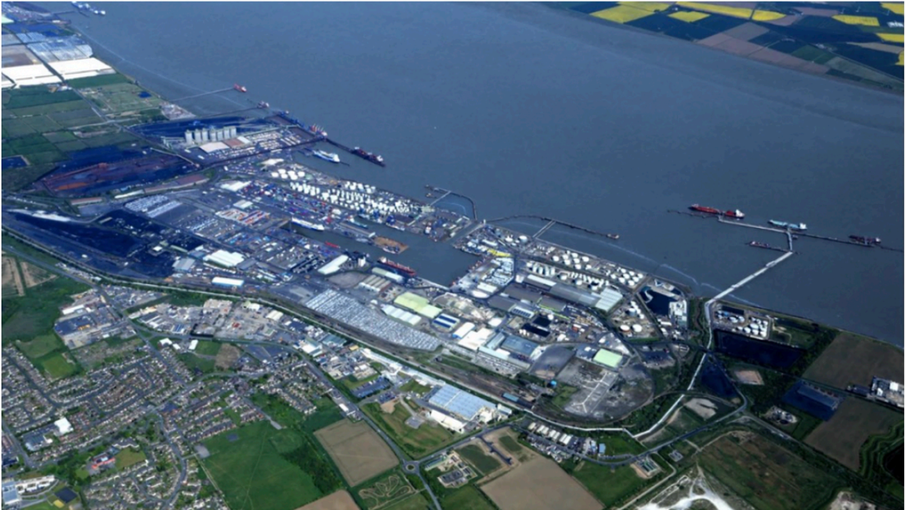
Associated British Ports - Immingham Green Energy Terminal