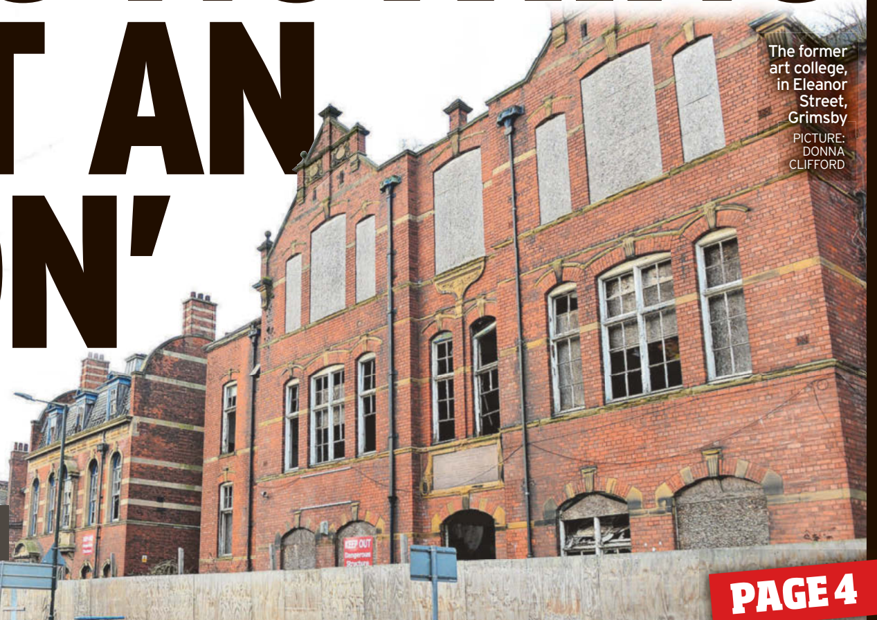
The former art college, in Eleanor Street, Grimsby

FUTURE OF FORMER ART COLLEGE TO BE DECIDED AS COUNCIL CONSIDERS NEXT STEP FOLLOWING REPORT