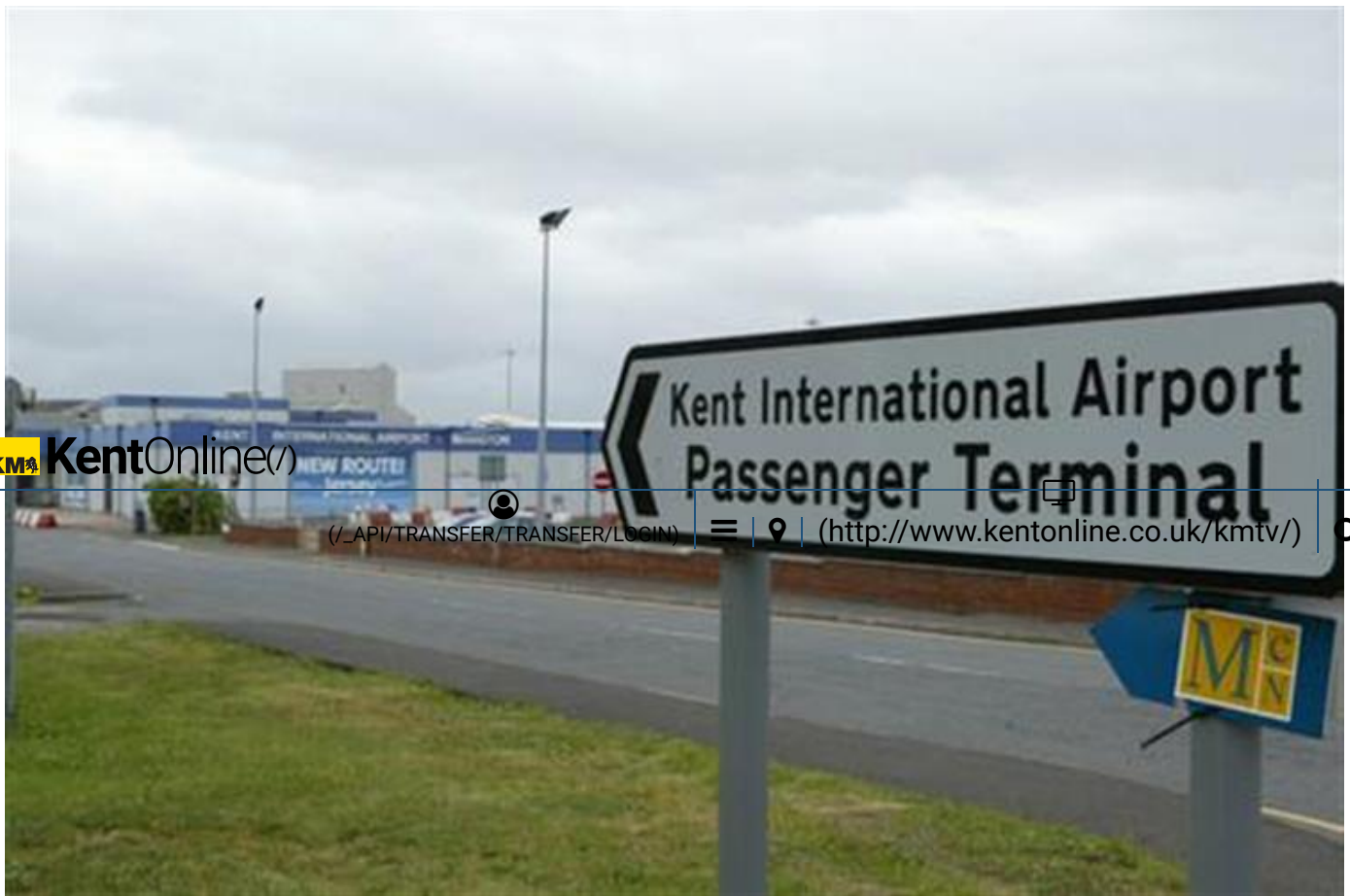
Kent International Airport, Manston