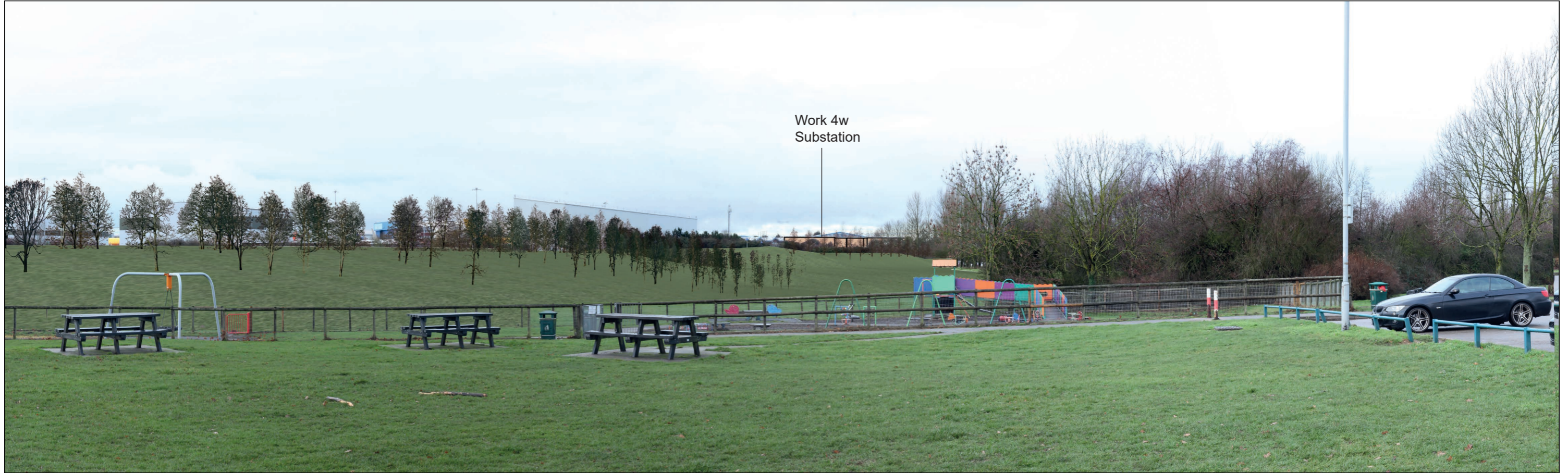
View with proposed planting (Phase 1)

Accurate Visual Representation based on winter viewpoint photography. Refer to Appendix 14.6 of this ES [TR020001/APP/5.02] for corresponding viewpoint information.