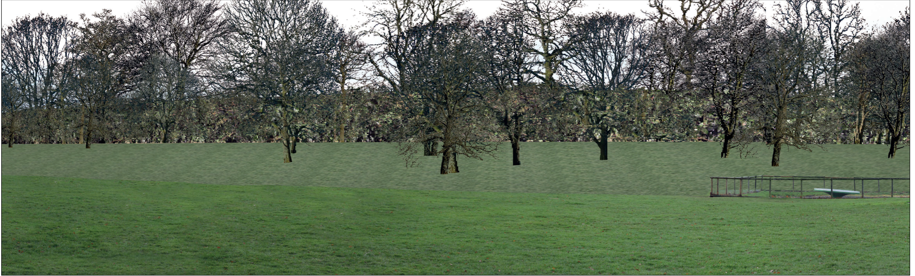
View with proposed planting (Phase 2b)

Accurate Visual Representation based on winter viewpoint photography. Refer to Appendix 14.6 of this ES [TR020001/APP/5.02] for corresponding viewpoint information.