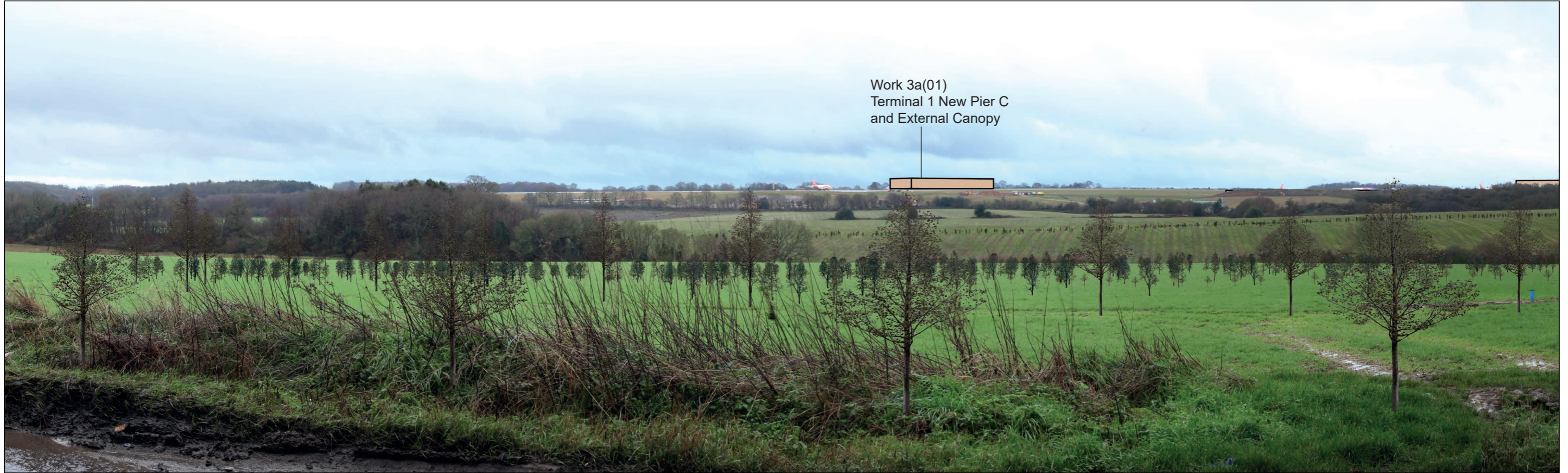
View with proposed planting (Phase 1)

Accurate Visual Representation based on winter viewpoint photography. Refer to Appendix 14.6 of this ES [TR020001/APP/5.02] for corresponding viewpoint information.