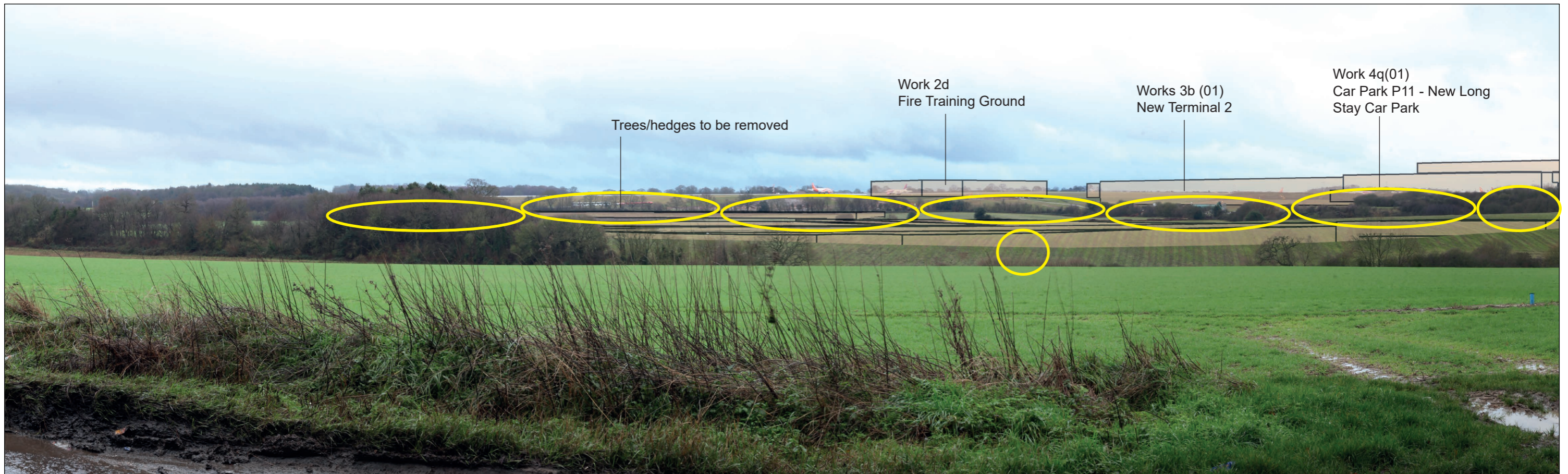
Block Form of Max. Parameters (Viewing Distance 300mm)