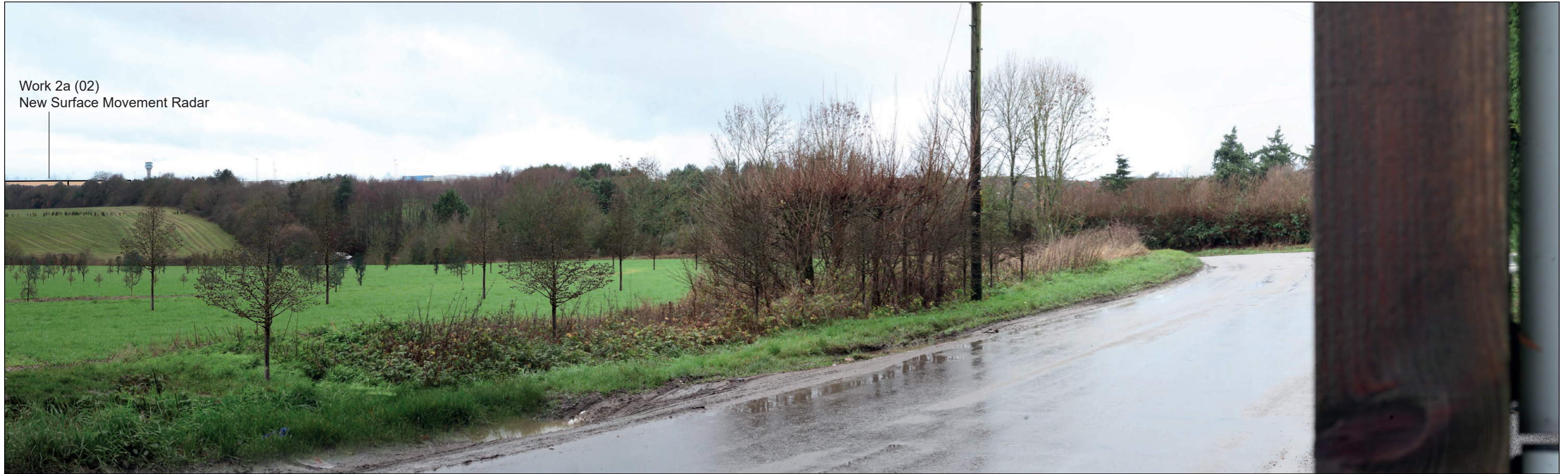
View with proposed planting (Phase 1)

Accurate Visual Representation based on winter viewpoint photography. Refer to Appendix 14.6 of this ES [TR020001/APP/5.02] for corresponding viewpoint information.