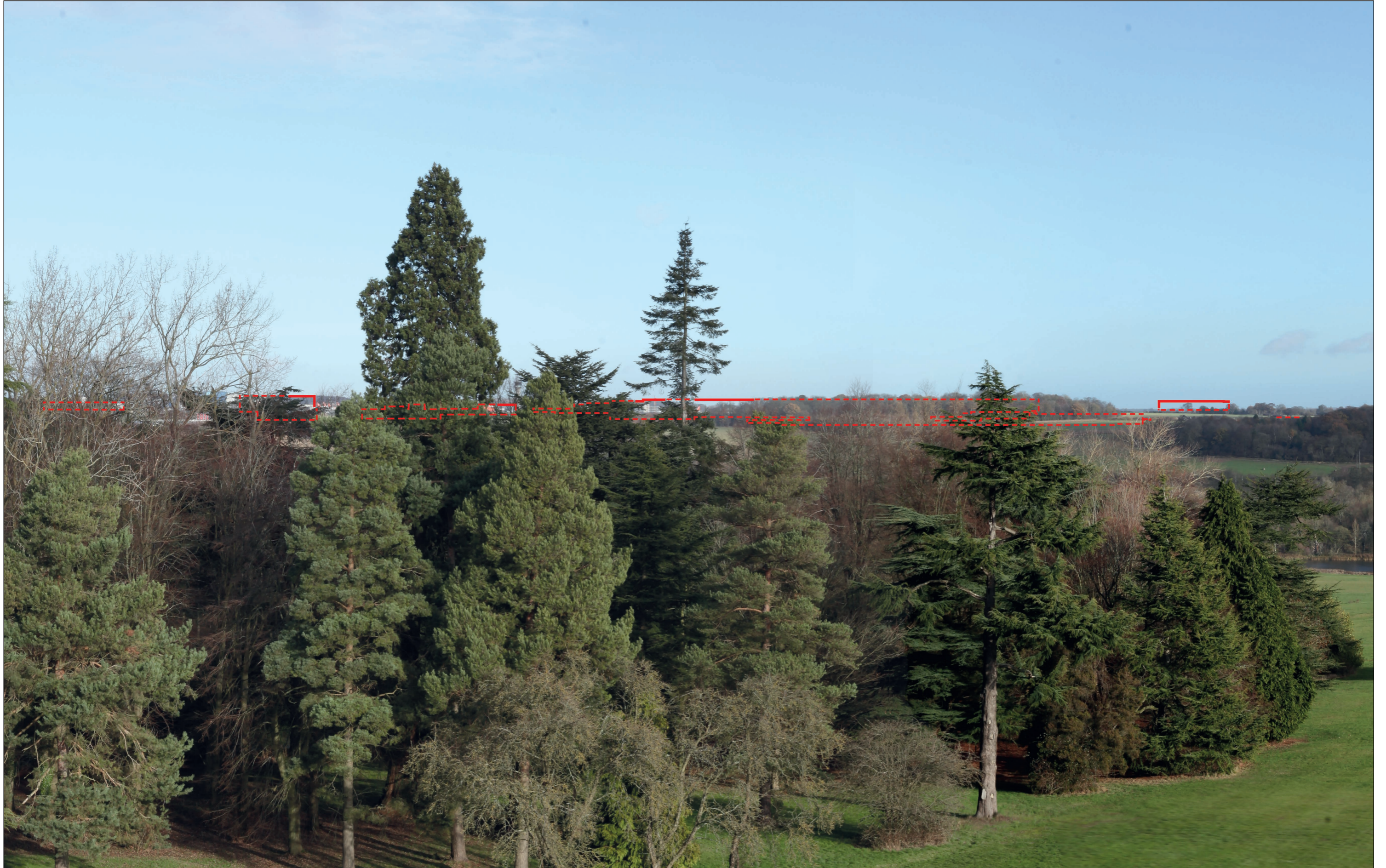
Wireline of Max. Parameters (Viewing Distance 500mm)

Accurate Visual Representation based on winter viewpoint photography. Refer to Appendix 14.6 of this ES [TR020001/APP/5.02] for corresponding viewpoint information.