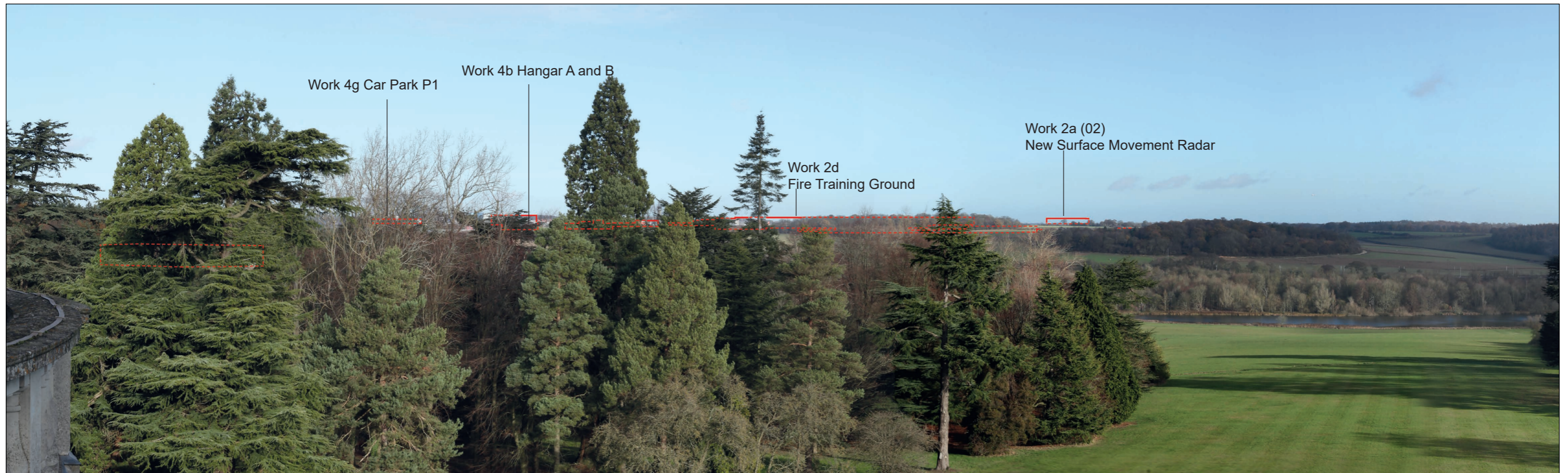
Wireline of Max. Parameters (Viewing Distance 300mm)