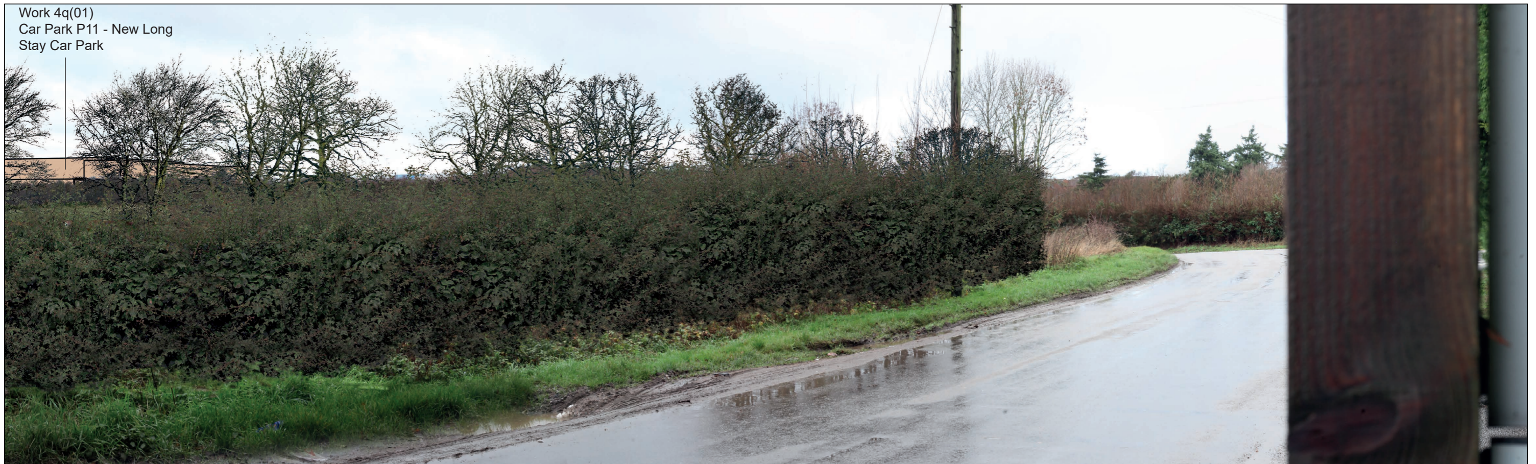
View with proposed planting (Phase 2a)