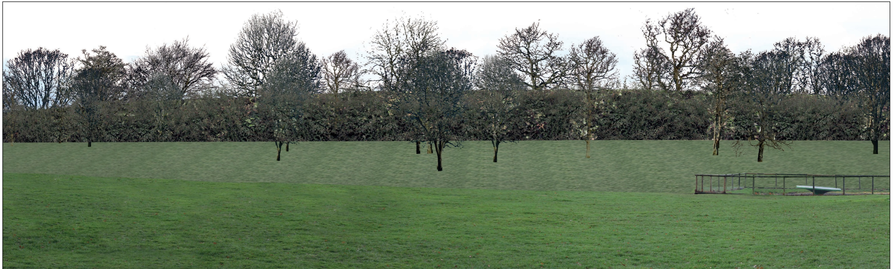
View with proposed planting (Phase 2a)