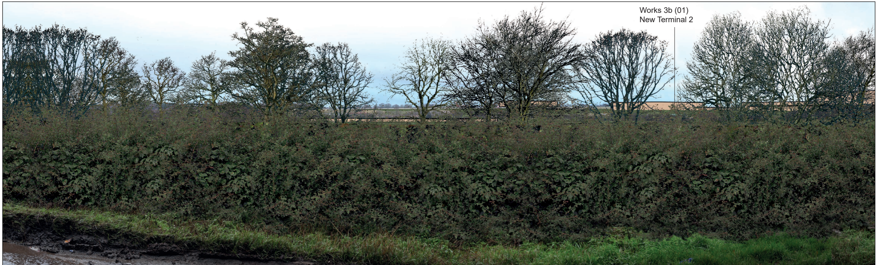
View with proposed planting (Phase 2a)