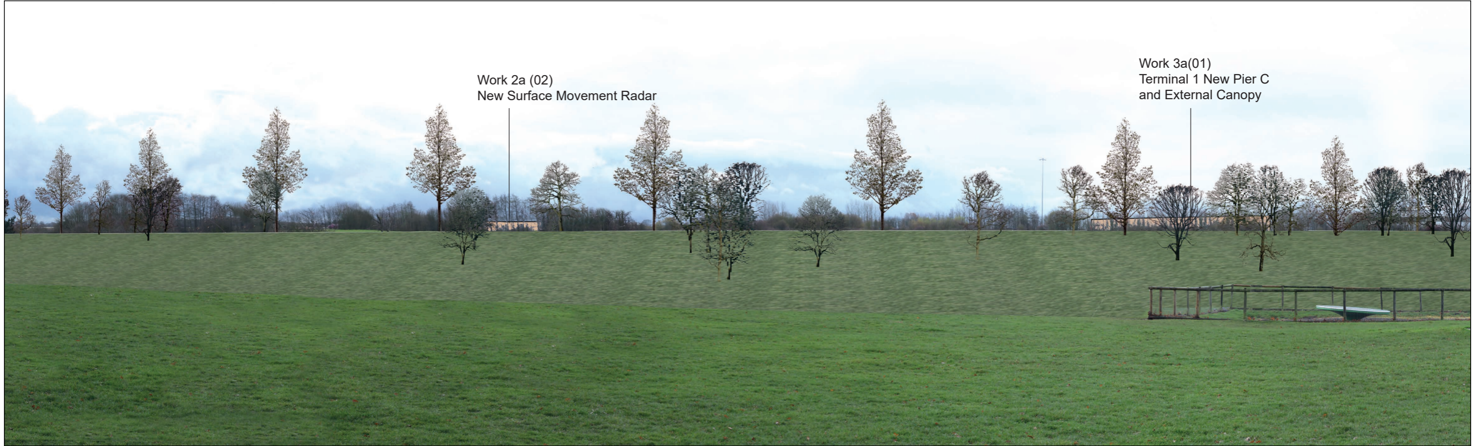
View with proposed planting (Phase 1)

Accurate Visual Representation based on winter viewpoint photography. Refer to Appendix 14.6 of this ES [TR020001/APP/5.02] for corresponding viewpoint information.