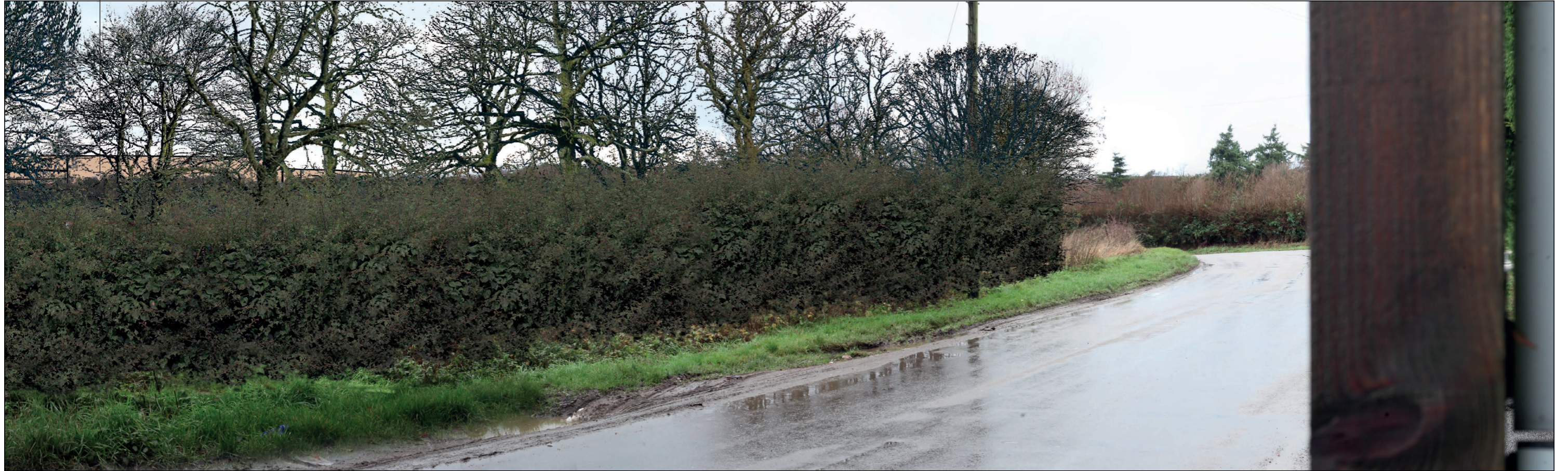
View with proposed planting (Phase 2b)

Accurate Visual Representation based on winter viewpoint photography. Refer to Appendix 14.6 of this ES [TR020001/APP/5.02] for corresponding viewpoint information.