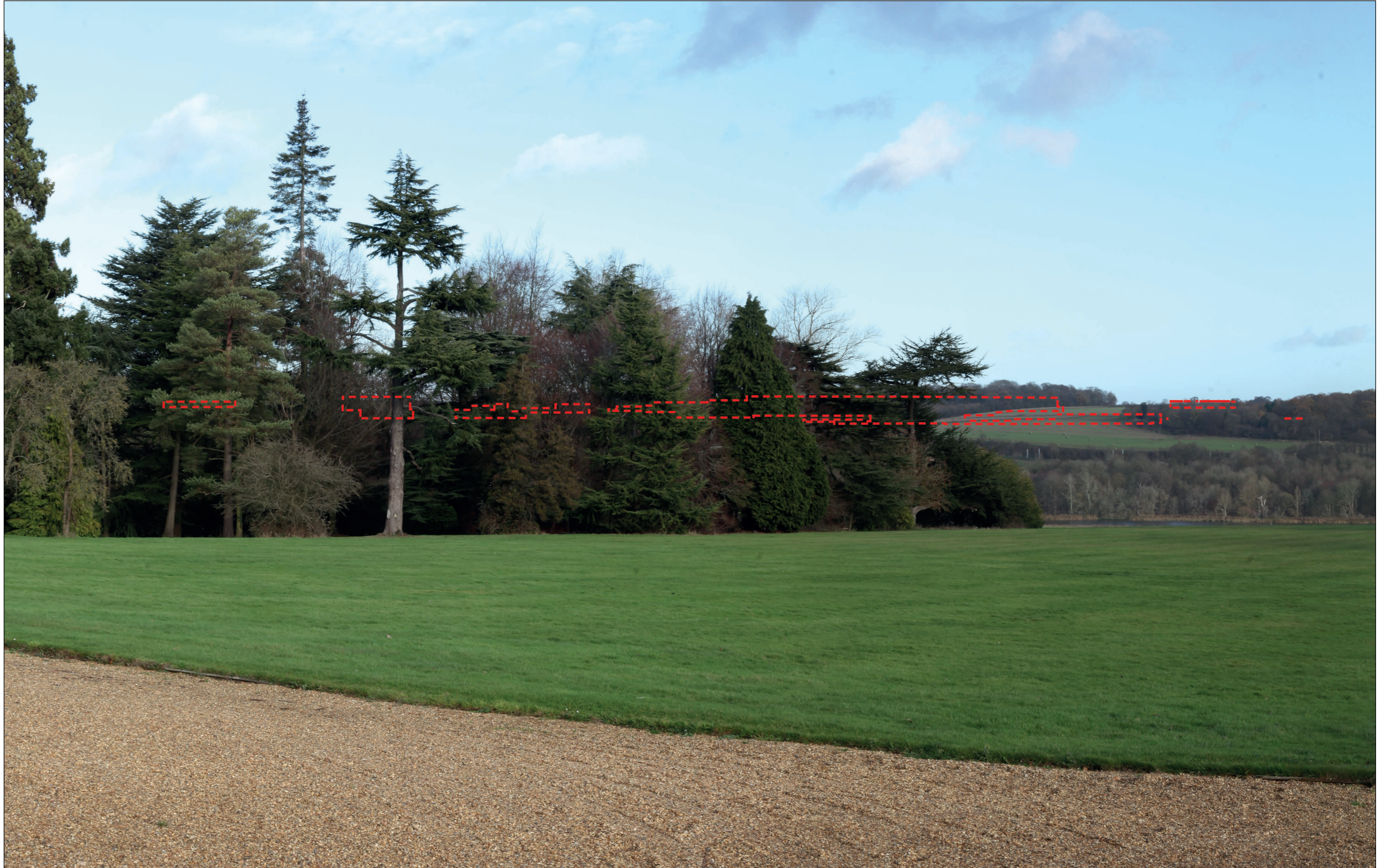
Wireline of Max. Parameters (Viewing Distance 500mm)

Accurate Visual Representation based on winter viewpoint photography. Refer to Appendix 14.6 of this ES [TR020001/APP/5.02] for corresponding viewpoint information.