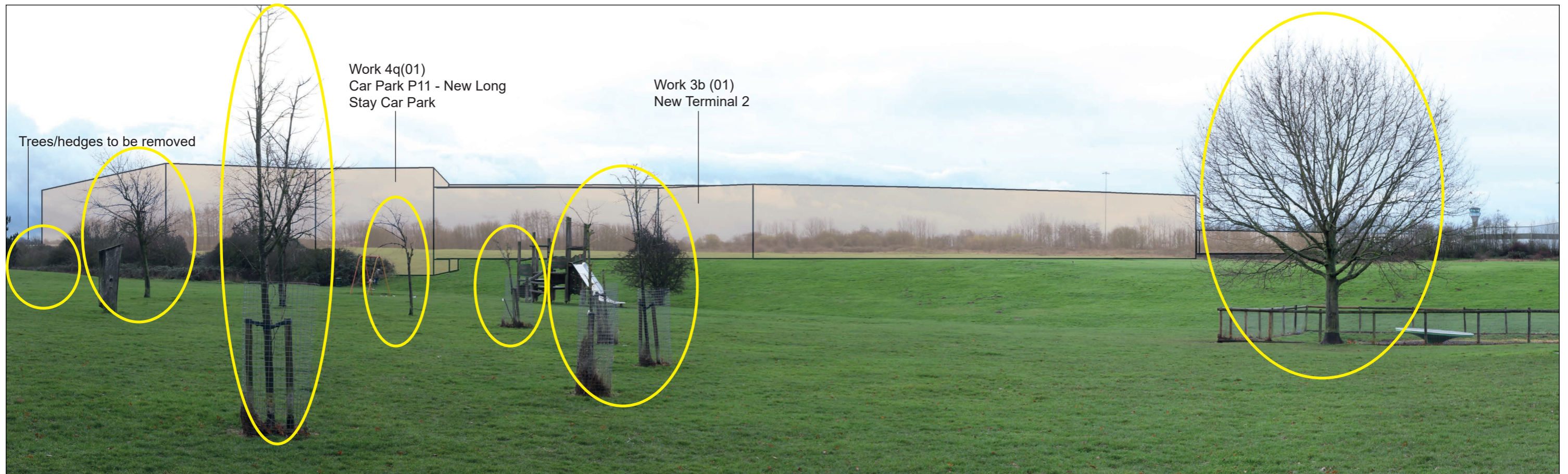
Block Form of Max. Parameters (Viewing Distance 300mm)