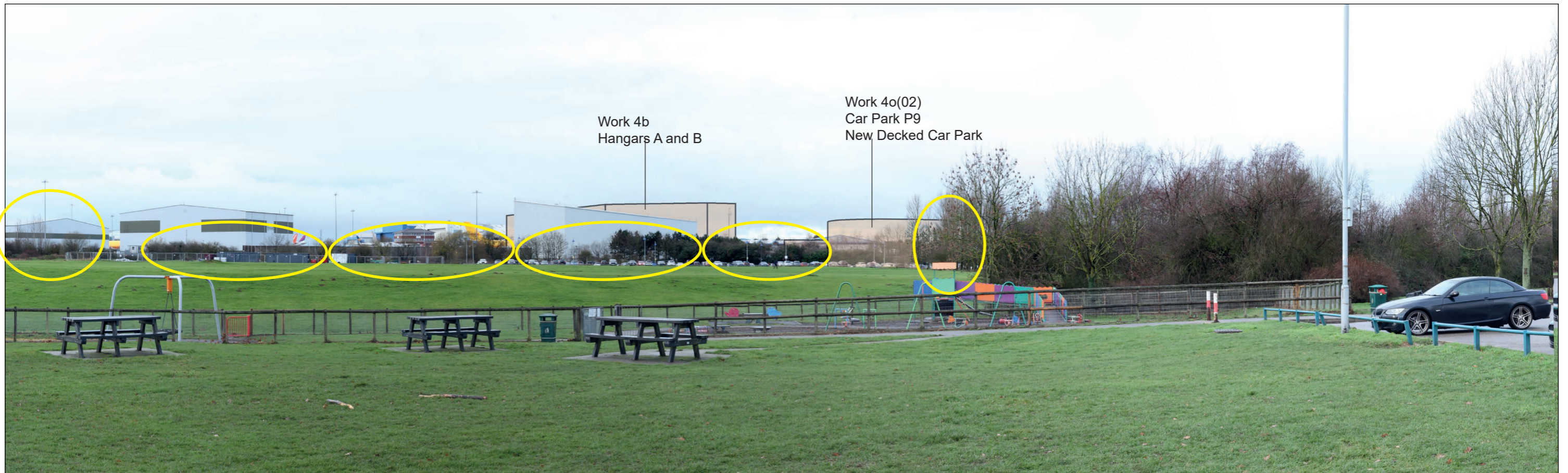
Block Form of Max. Parameters (Viewing Distance 300mm)