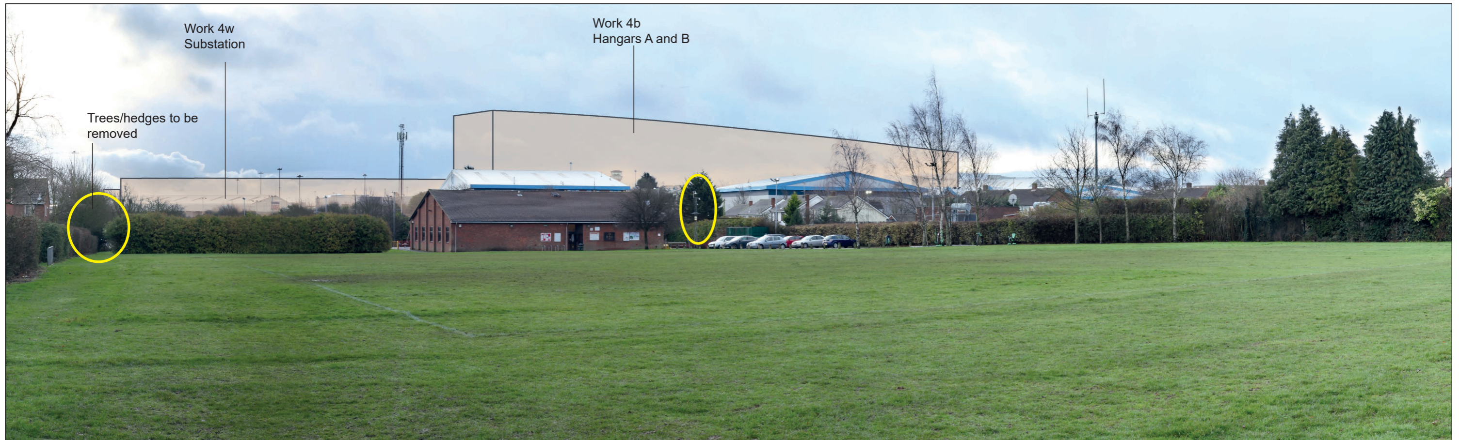
Block Form of Max. Parameters (Viewing Distance 300mm)