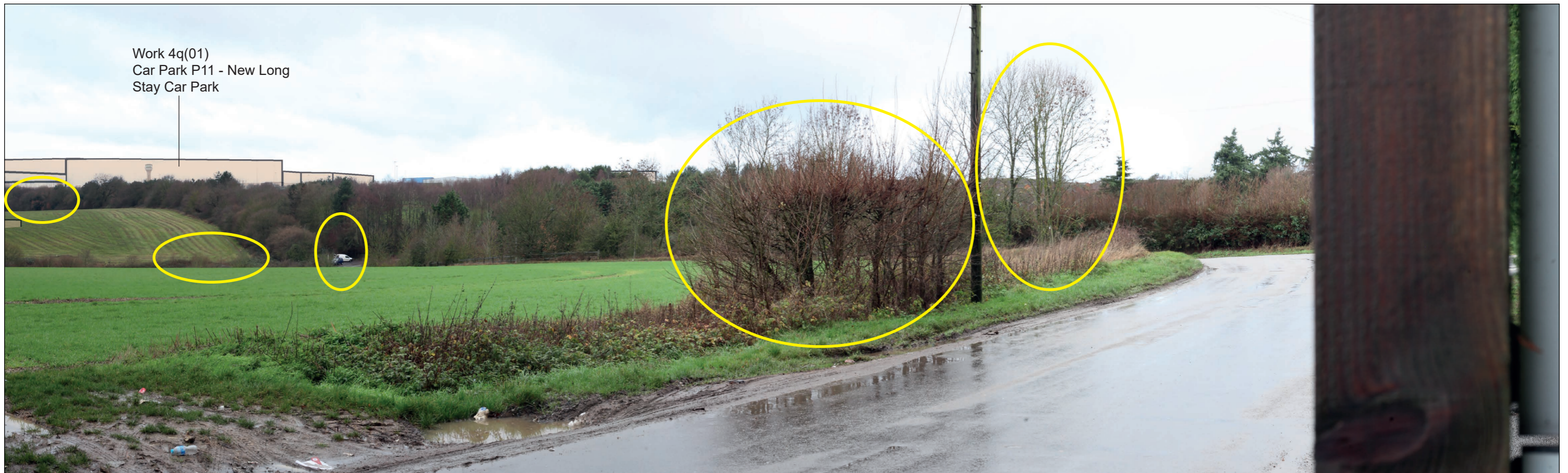
Block Form of Max. Parameters (Viewing Distance 300mm)