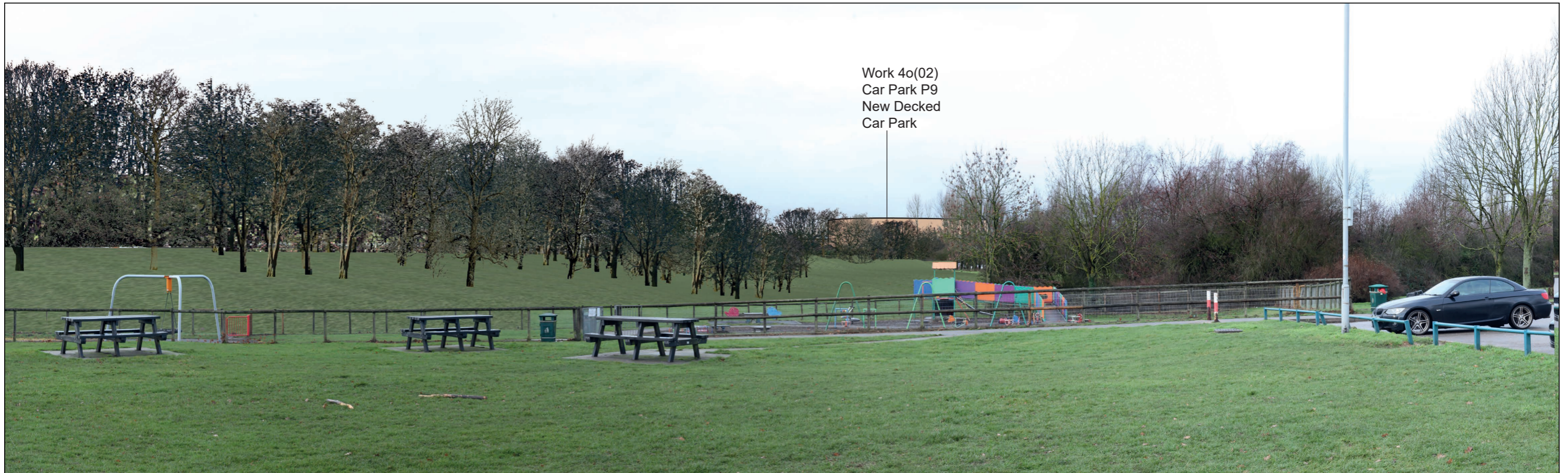
View with proposed planting (Phase 2a)