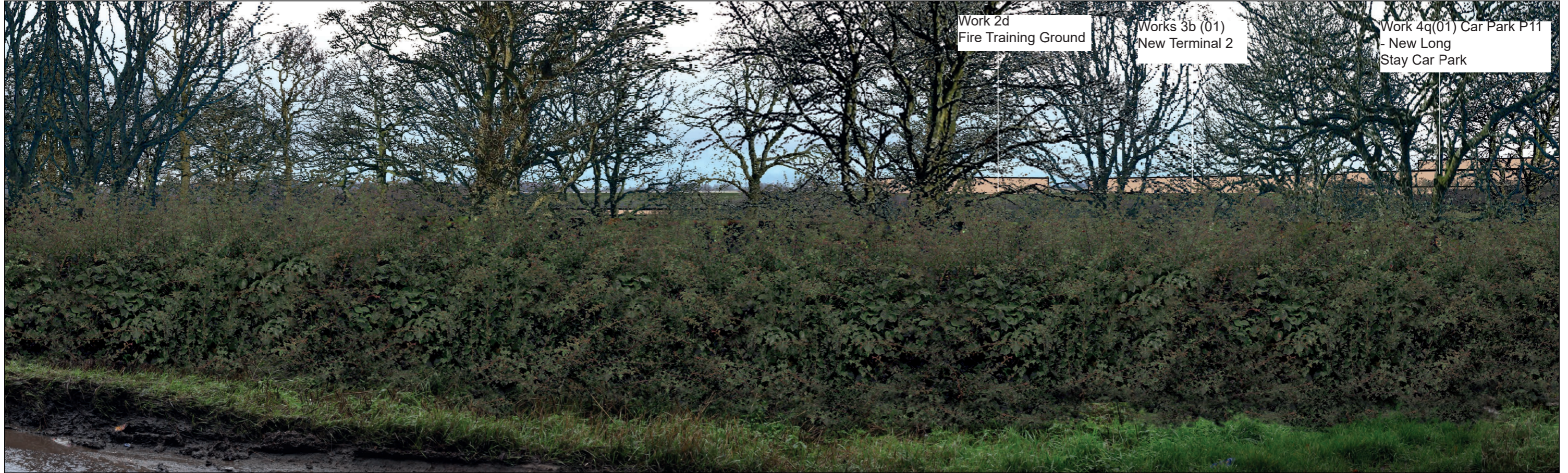
View with proposed planting (Phase 2b)

Accurate Visual Representation based on winter viewpoint photography. Refer to Appendix 14.6 of this ES [TR020001/APP/5.02] for corresponding viewpoint information.