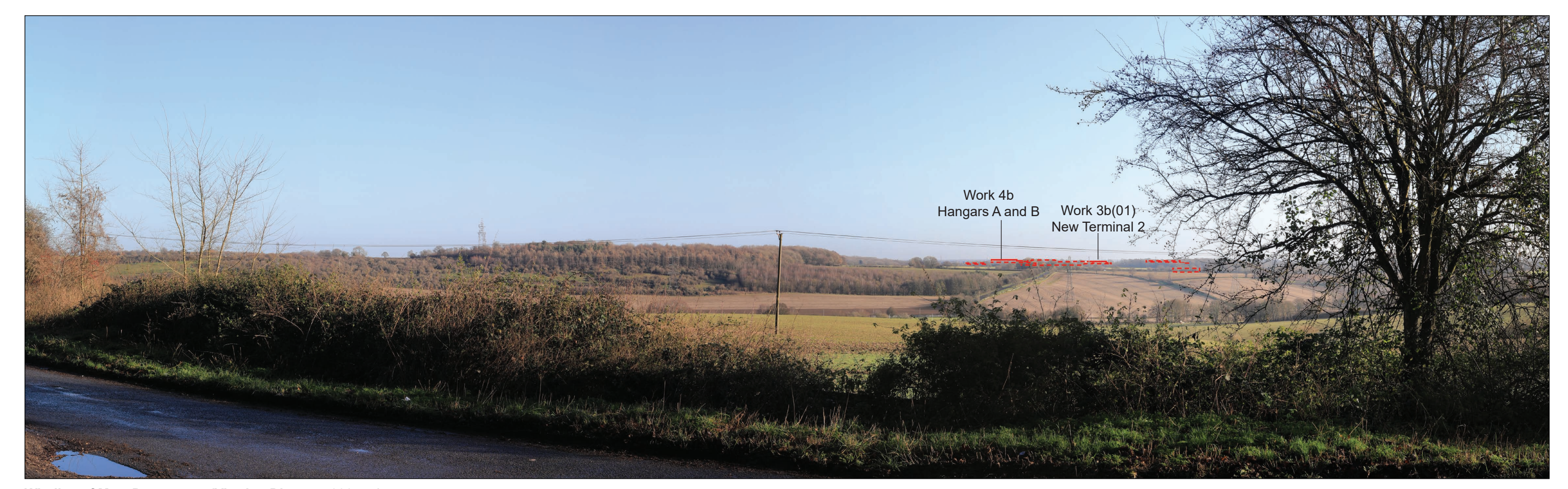
Wireline of Max. Parameters (Viewing Distance 300mm)