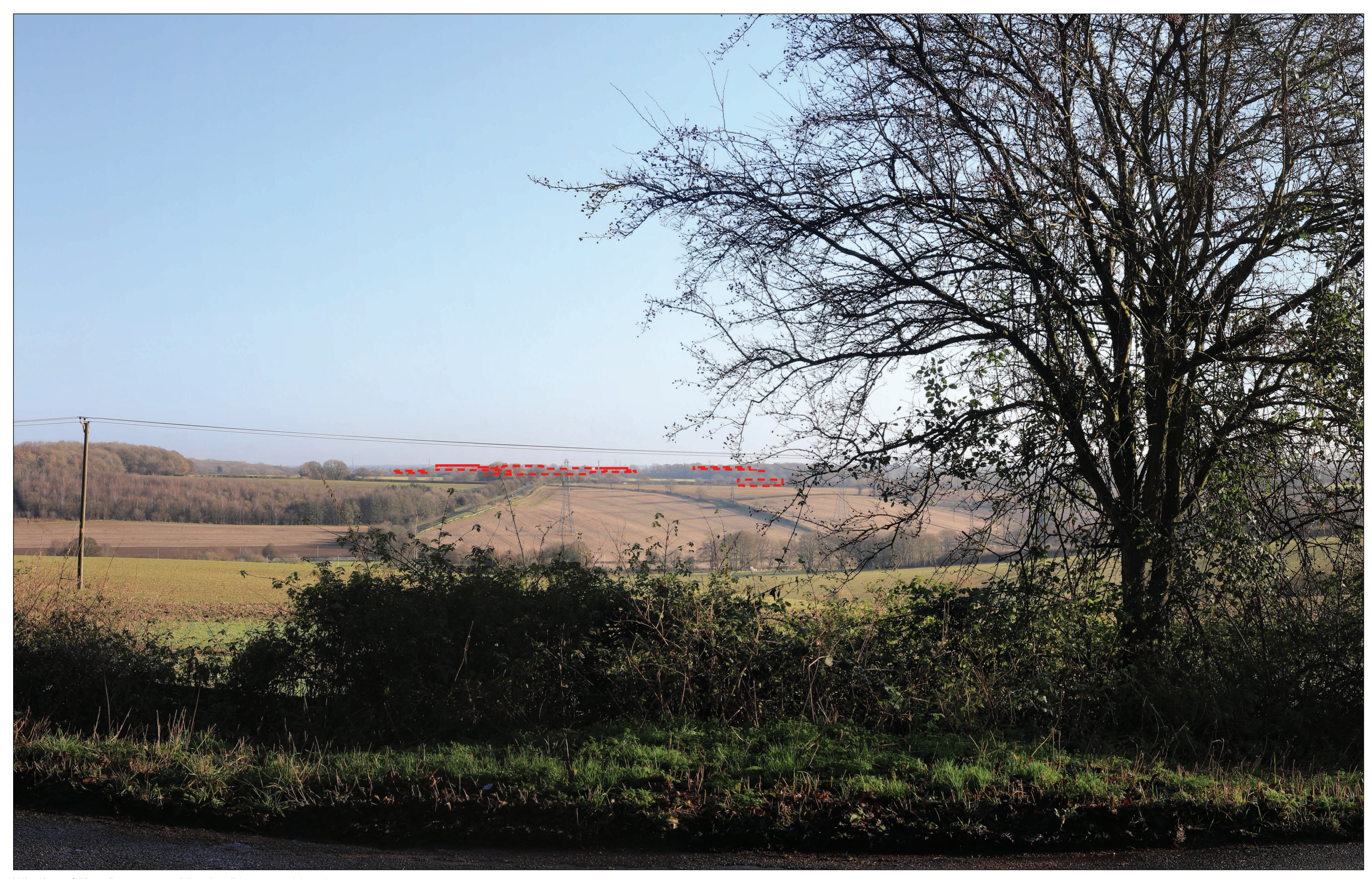
Wireline of Max. Parameters (Viewing Distance 500mm)