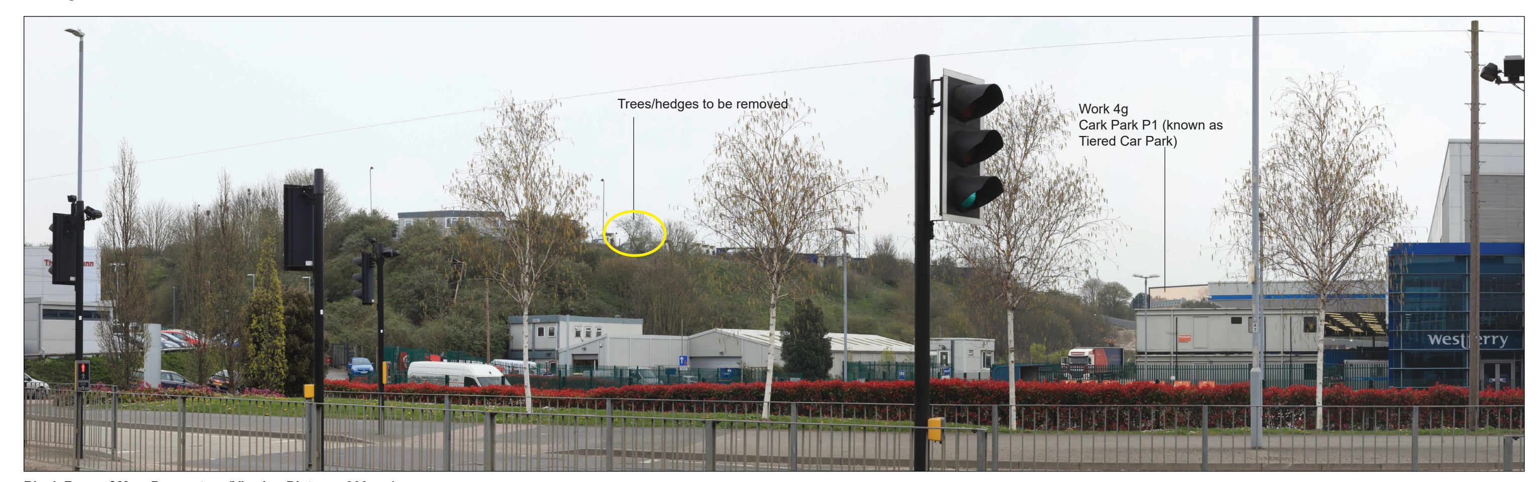
Block Form of Max. Parameters (Viewing Distance 300mm)