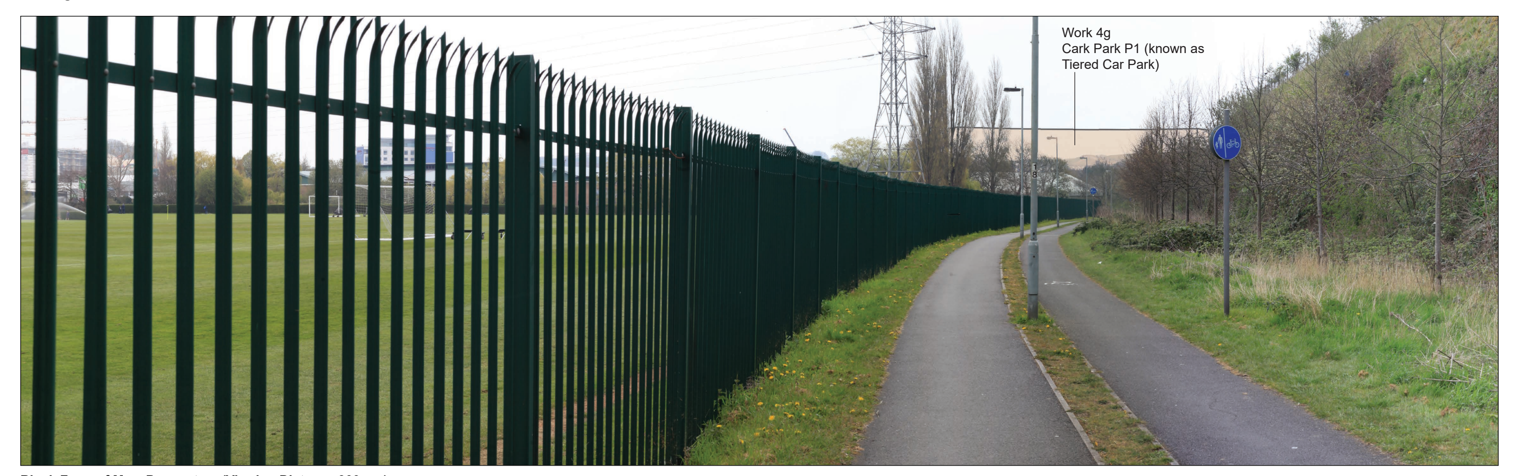
Block Form of Max. Parameters (Viewing Distance 300mm)