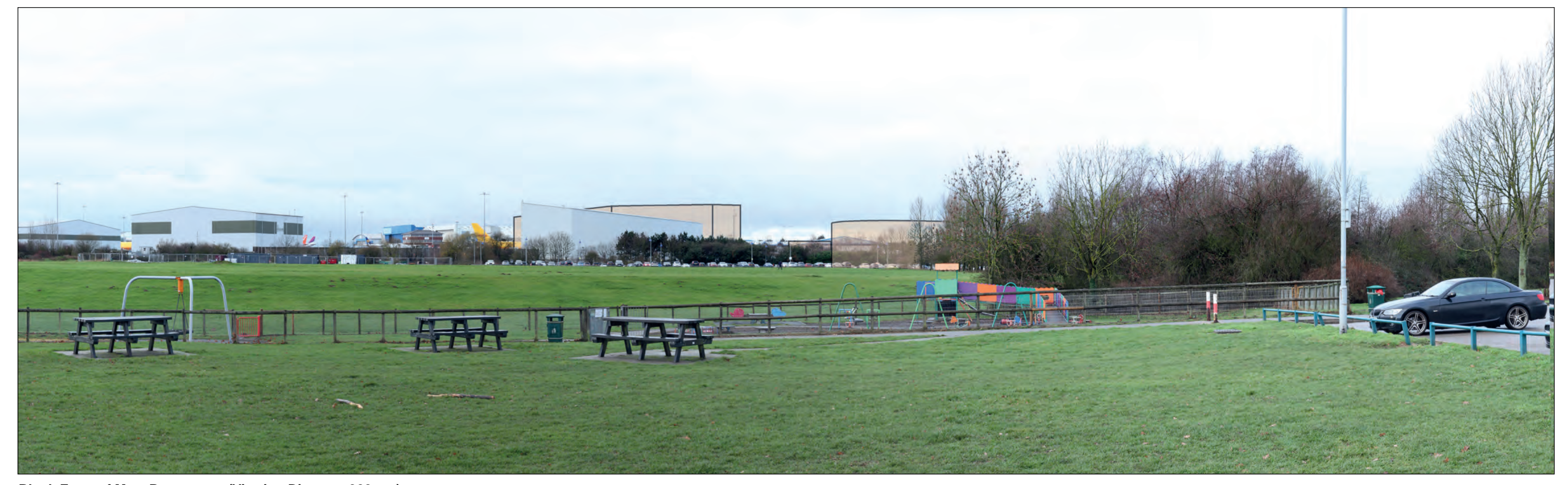
Block Form of Max. Parameters (Viewing Distance 300mm)