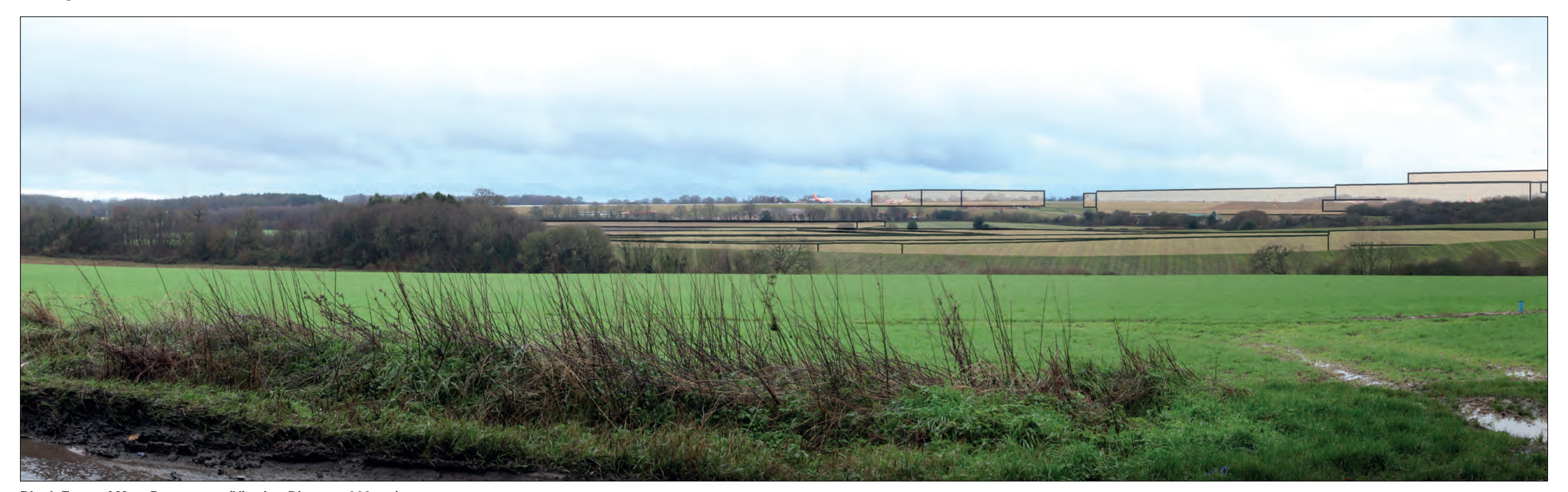
Block Form of Max. Parameters (Viewing Distance 300mm)