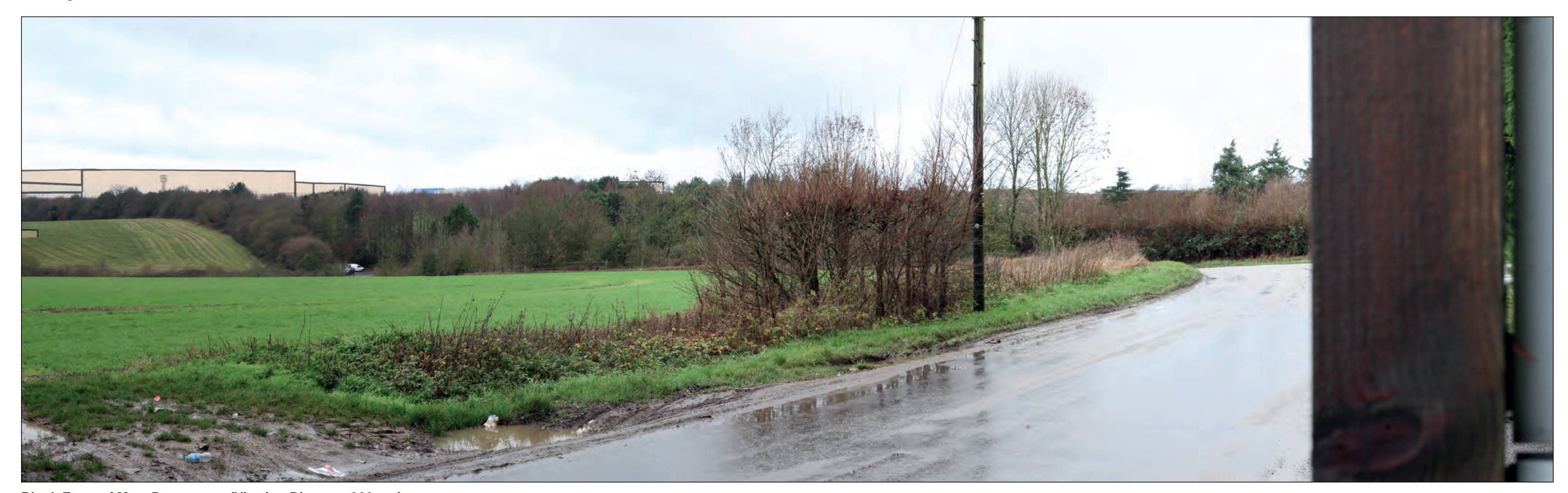
Block Form of Max. Parameters (Viewing Distance 300mm)