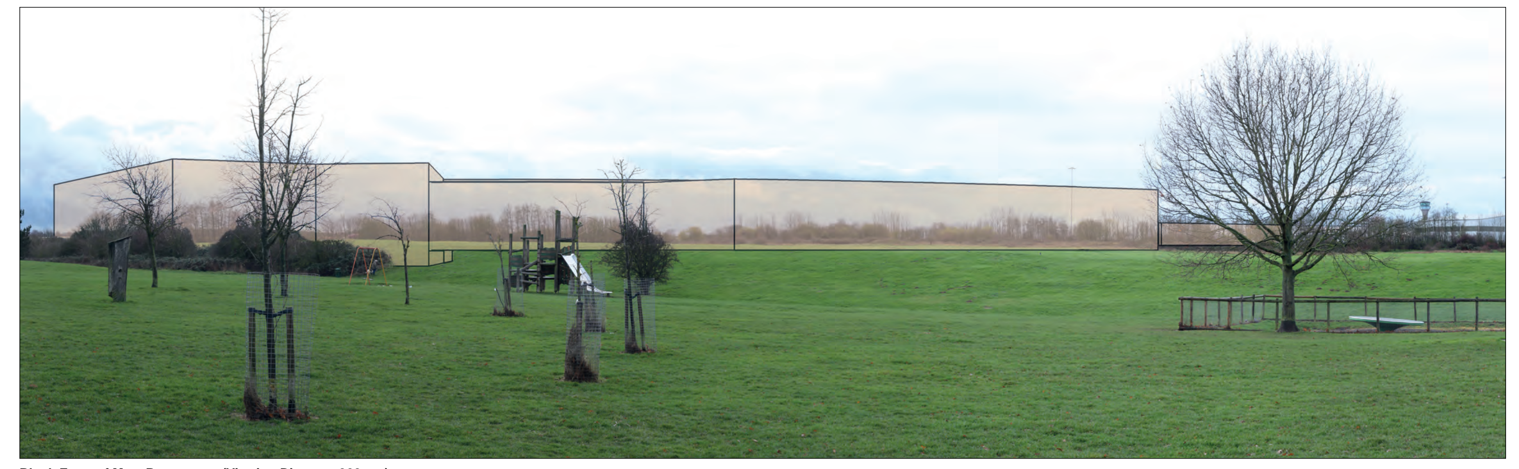
Block Form of Max. Parameters (Viewing Distance 300mm)