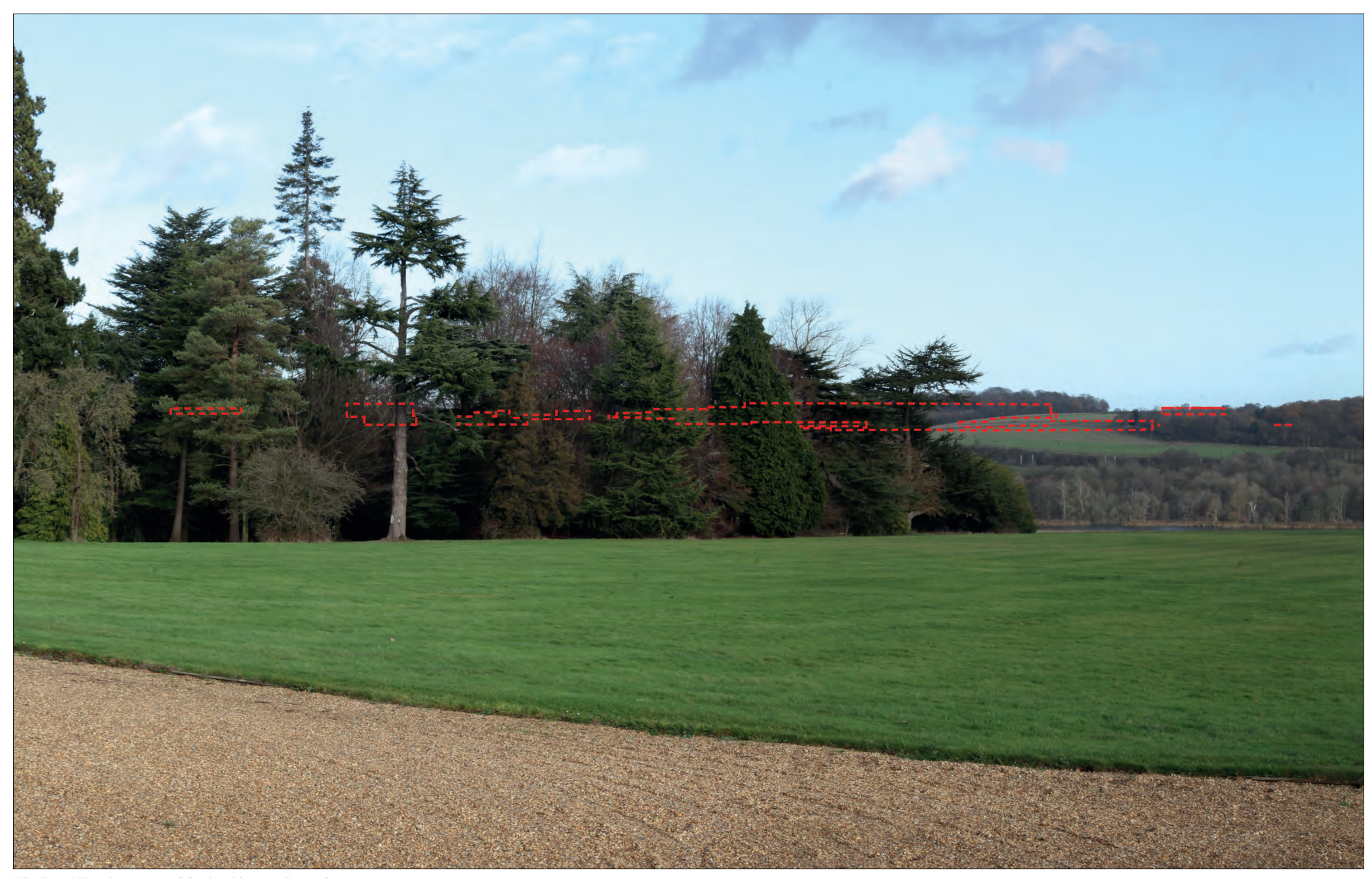
Wireline of Max. Parameters (Viewing Distance 500mm)