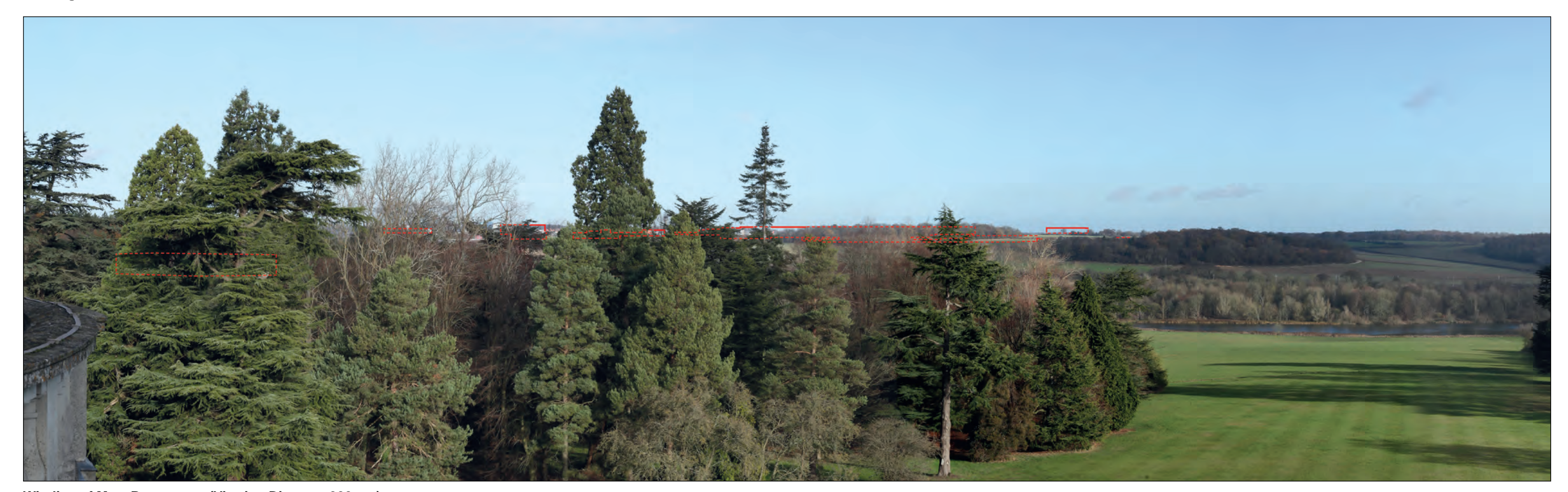
Wireline of Max. Parameters (Viewing Distance 300mm)