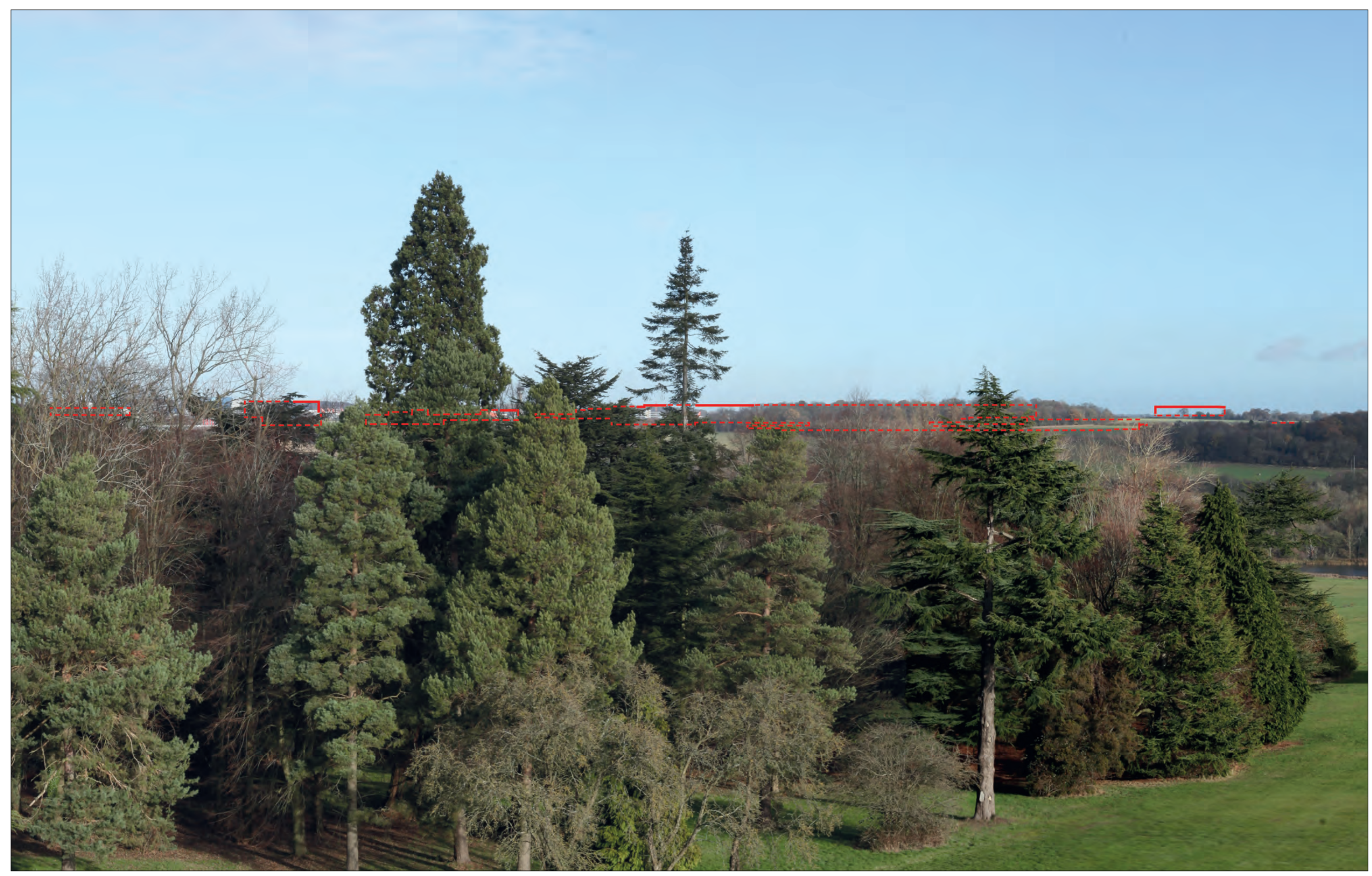
Wireline of Max. Parameters (Viewing Distance 500mm)