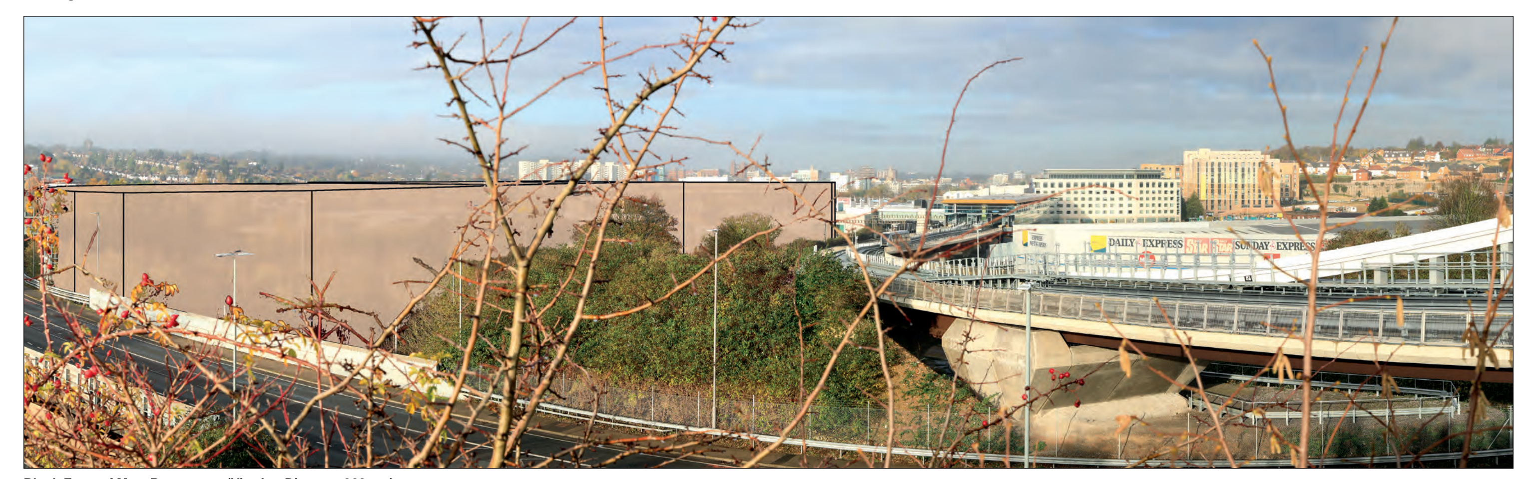
Block Form of Max. Parameters (Viewing Distance 300mm)