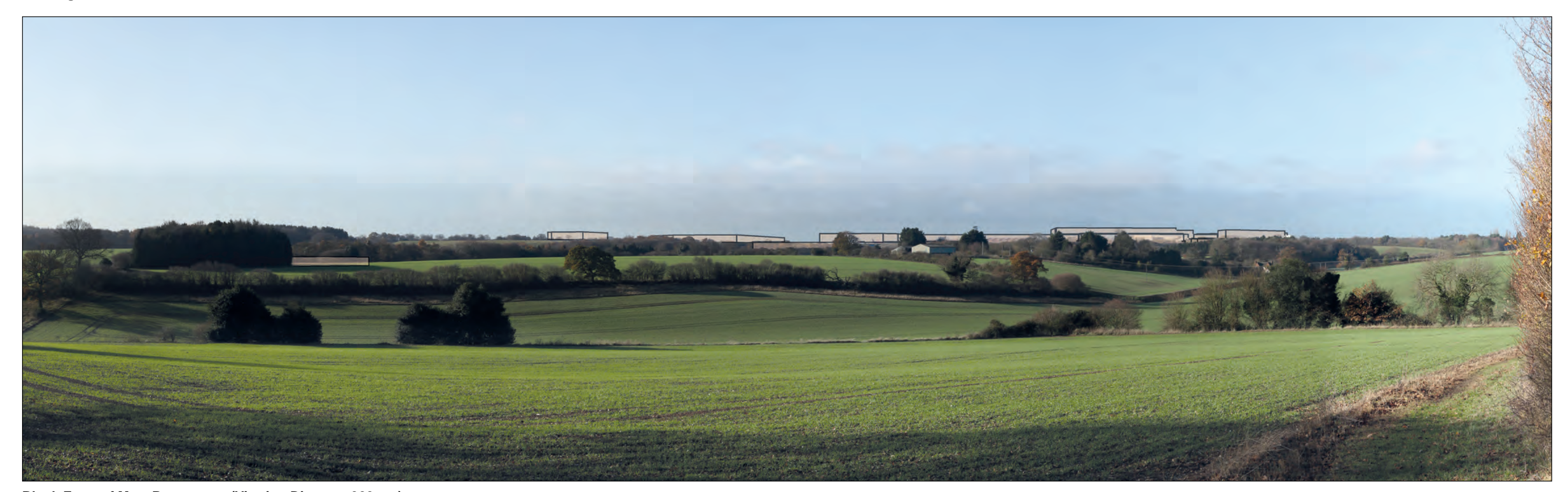
Block Form of Max. Parameters (Viewing Distance 300mm)