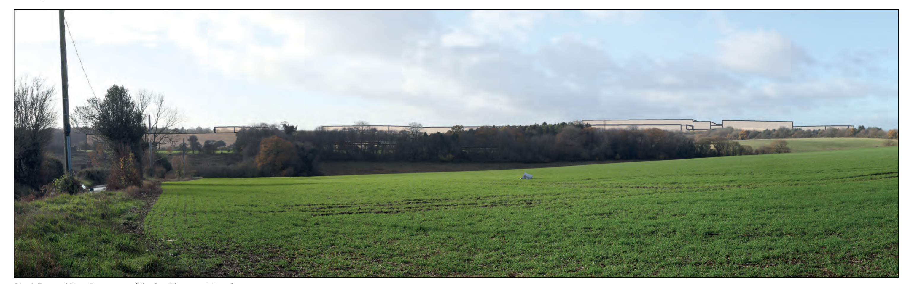
Block Form of Max. Parameters (Viewing Distance 300mm)