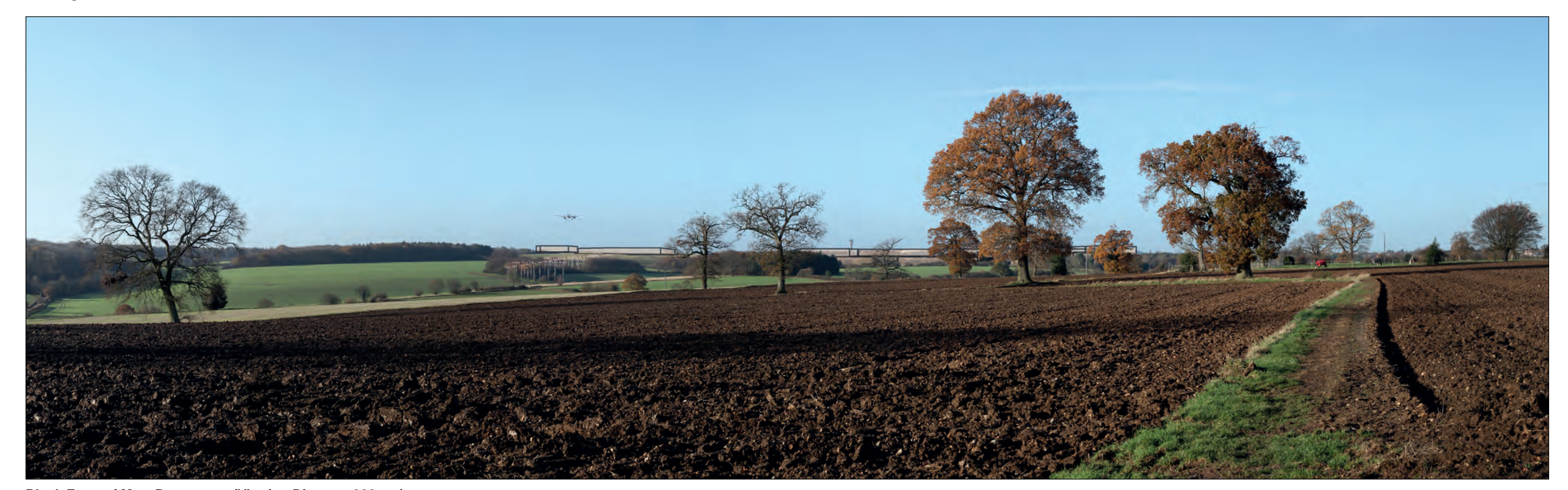
Block Form of Max. Parameters (Viewing Distance 300mm)