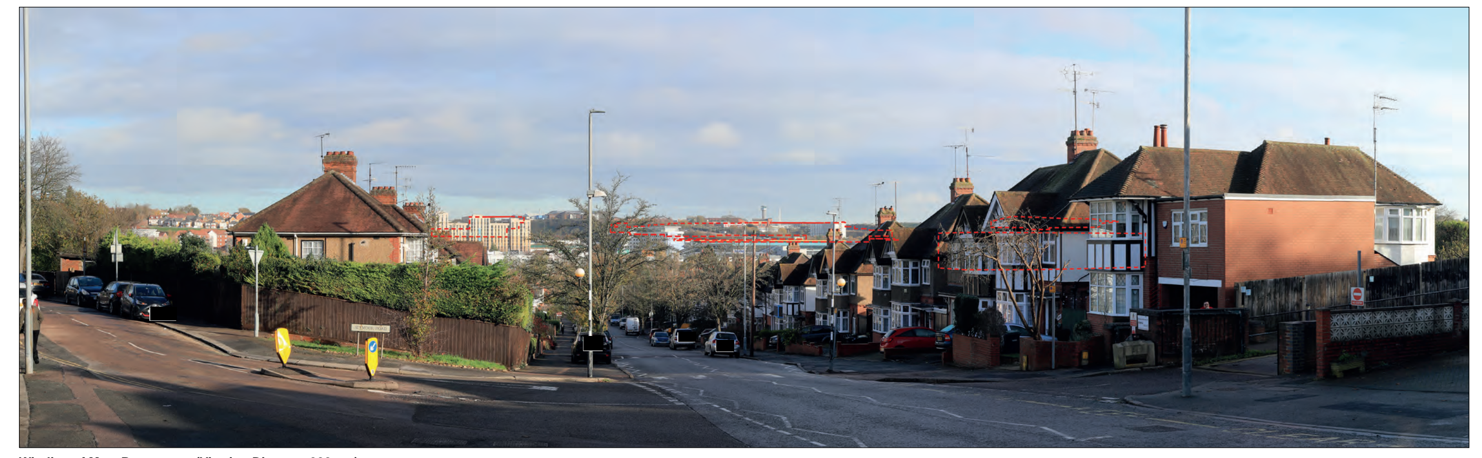
Wireline of Max. Parameters (Viewing Distance 300mm)