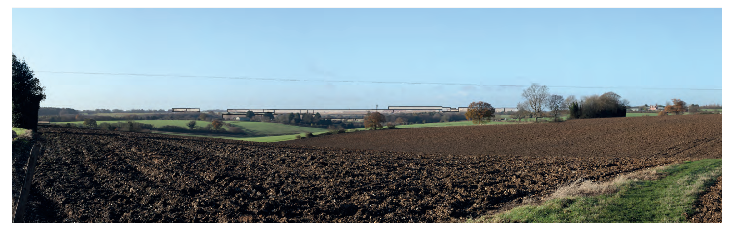
Block Form of Max. Parameters (Viewing Distance 300mm)