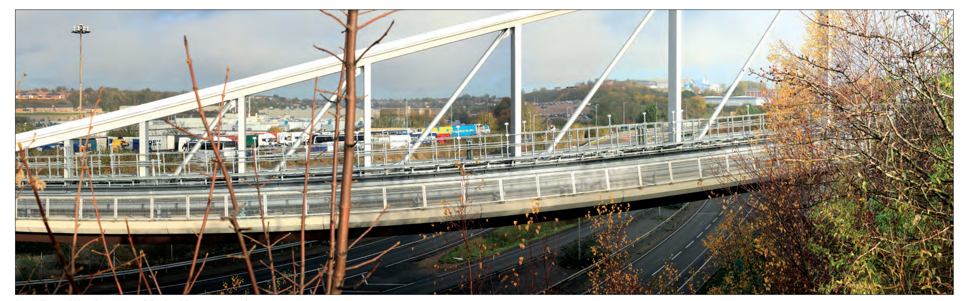
Block Form of Max. Parameters (Viewing Distance 300mm)