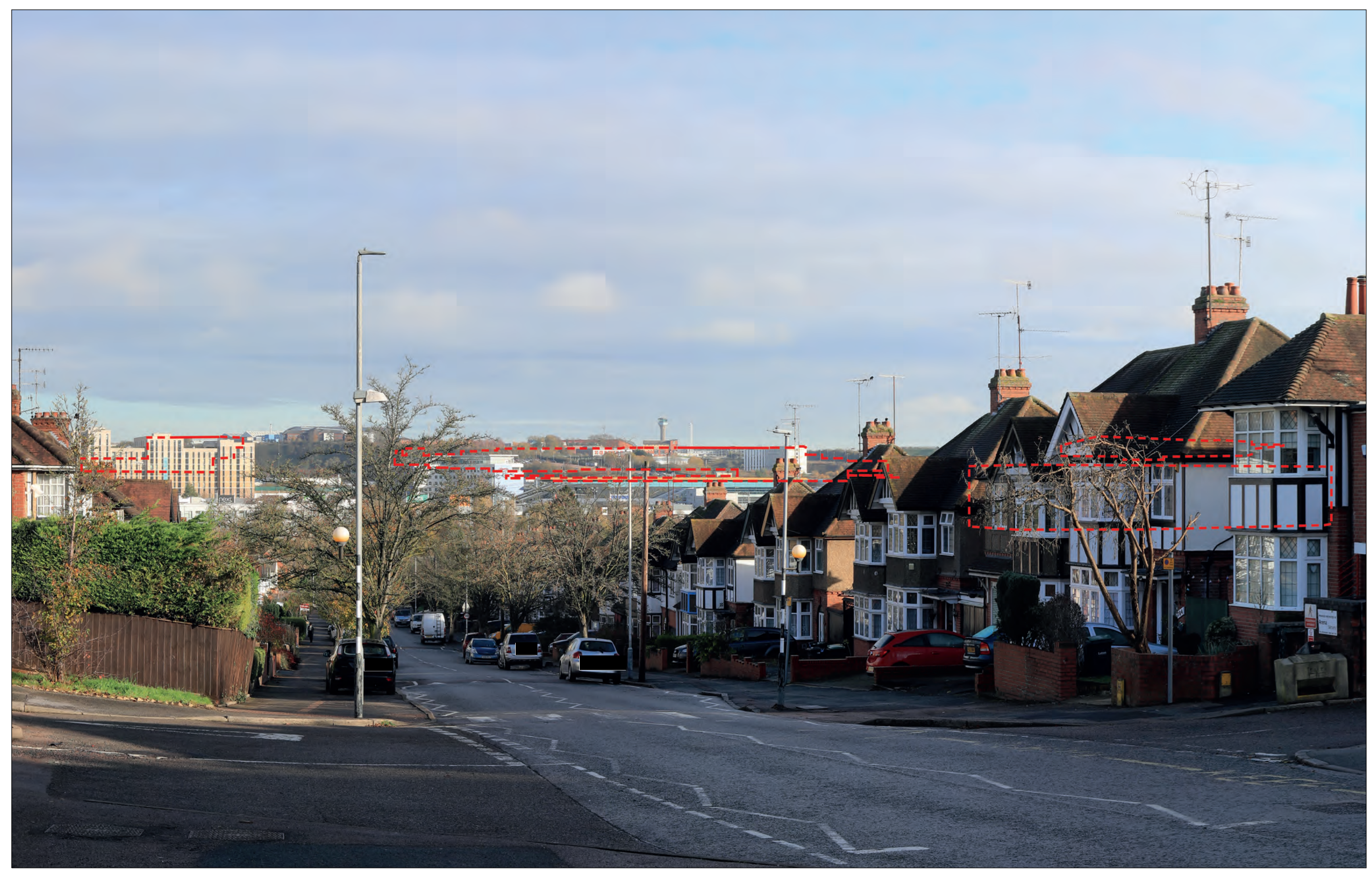
Wireline of Max. Parameters (Viewing Distance 500mm)