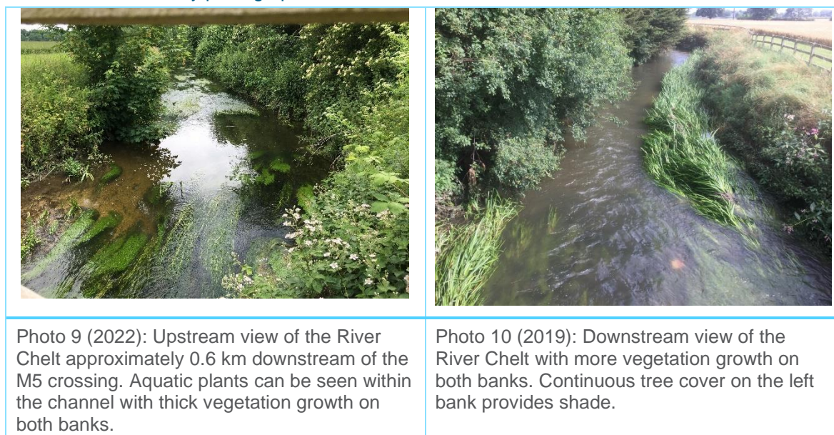
Table 4-4 - Water body photographs Chelt – M5 to conf. R. Severn