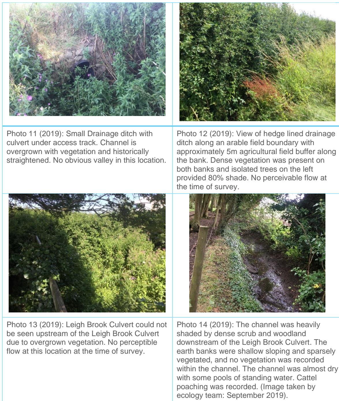
Table 4-5 - Water body photographs Leigh Bk – source to conf. R. Chelt