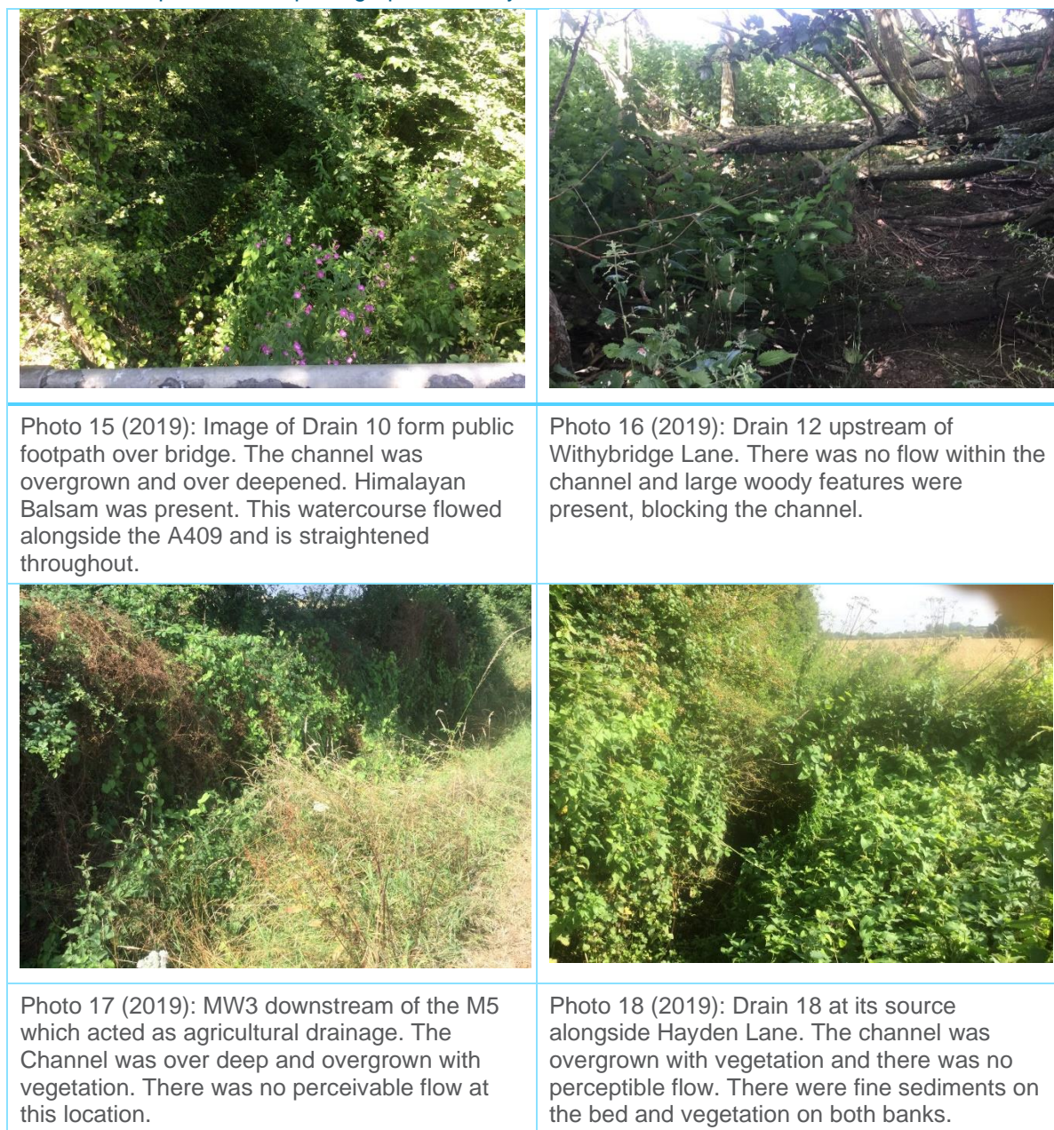
Figure 4-1 - Watercourses within close proximity to the Scheme

Figure provided in Appendix 8.2C at the end of this document.