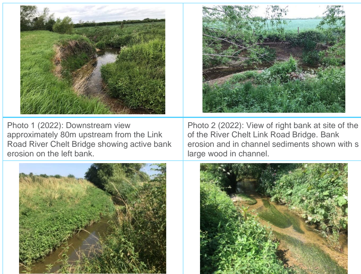
Table 4-3 - Water body photographs Chelt – source to M5