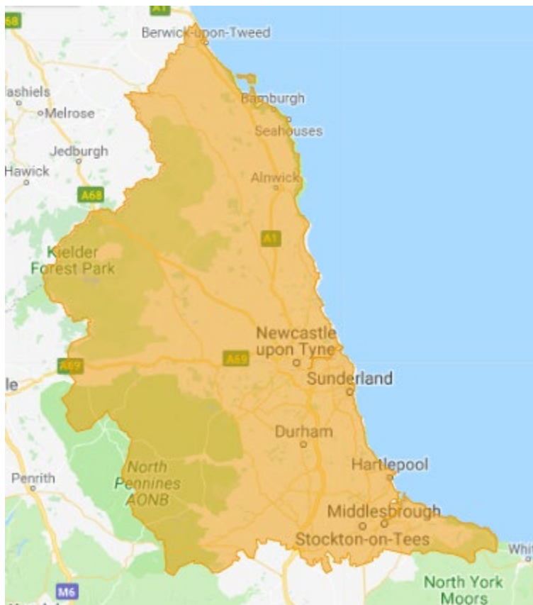
Figure 14.1 - Location of North East of England Region

14.6.4. The projections that are used to define the future baseline (against which resilience of Part B is assessed) are UKCP18 projections for the 2080s for the North East England region for a high emissions scenario (Representative Concentration Pathway (RCP) 8.5), refer to Figure 14.1 below.