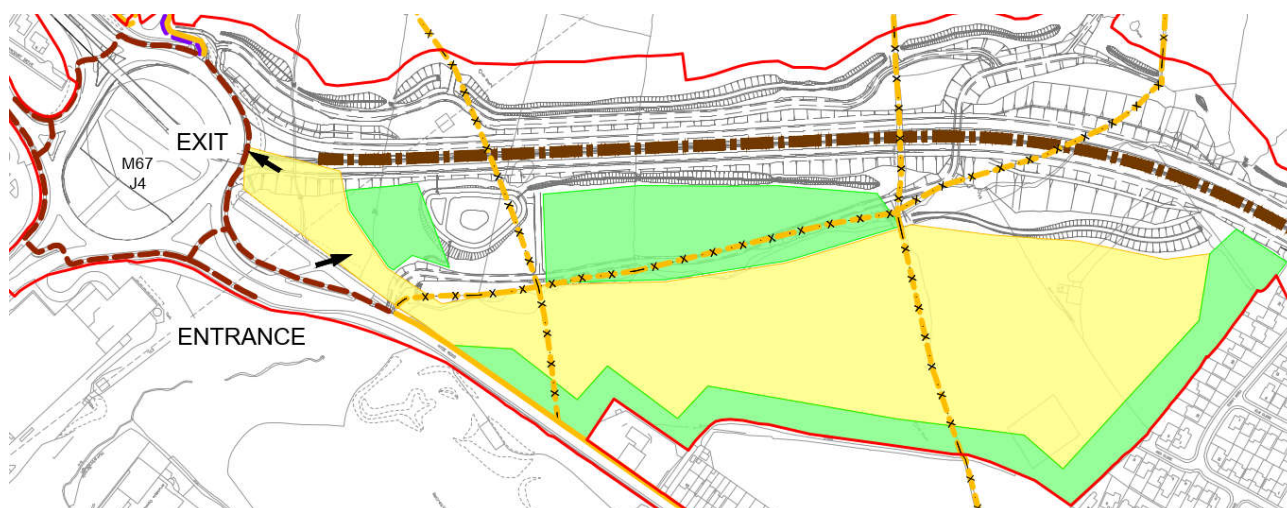
Figure 2.2: Site Compound (extract from 2.8 Temporary Works Plan)