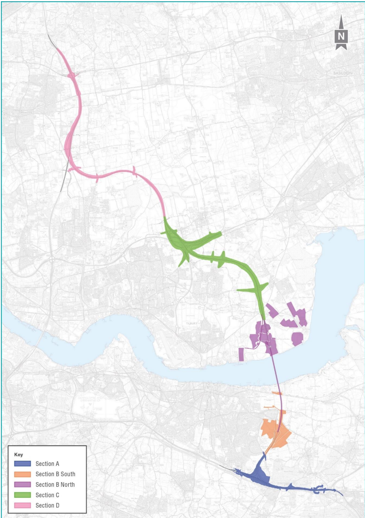
Plate 2.2 Construction Sections