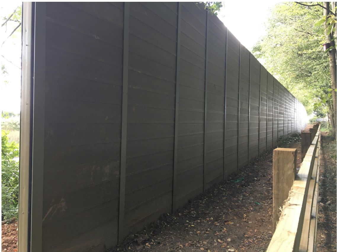
Figure 1 – Photograph of Noise Barrier