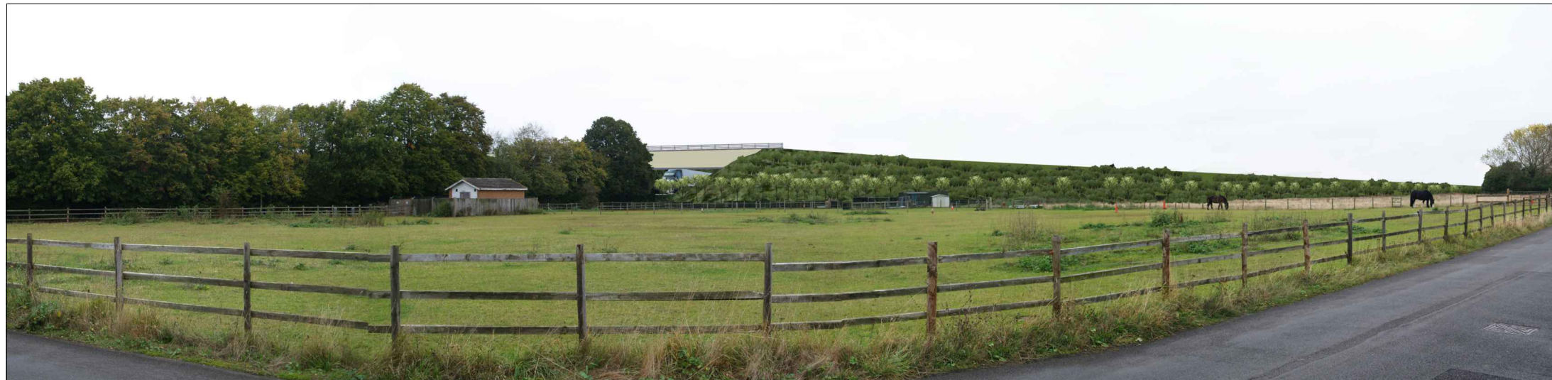
View on Completion

This map is reproduced from Ordnance Survey material with permission of Ordnance Survey on behalf of the Controller of Her Majesty's Stationery Office © Crown Copyright. Unauthorized reproduction infringes Crown Copyright and may lead to prosecution or civil proceedings. Highways Agency 100030649 2015.