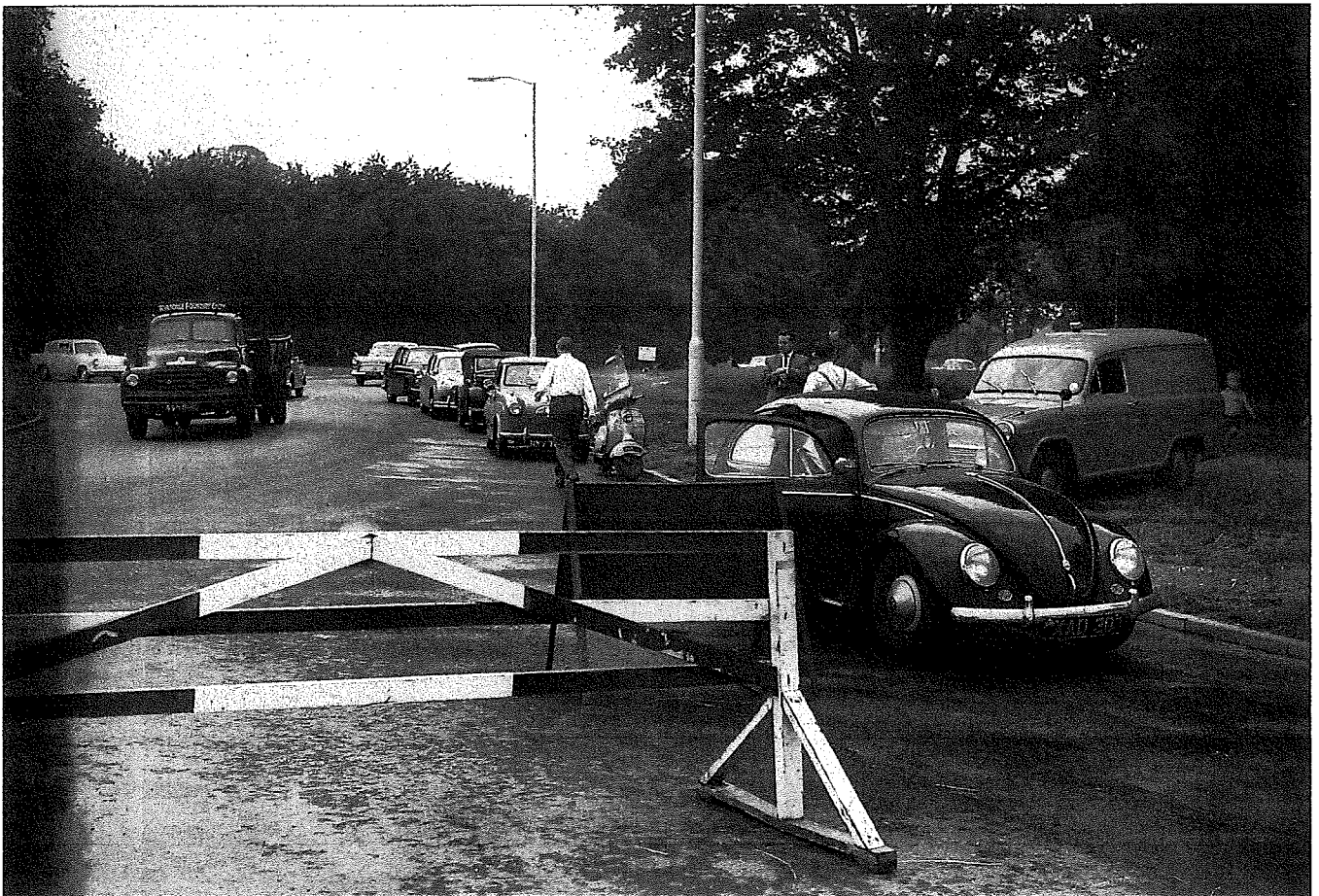
The opening of the Maidenhead Bypass in June 1961.