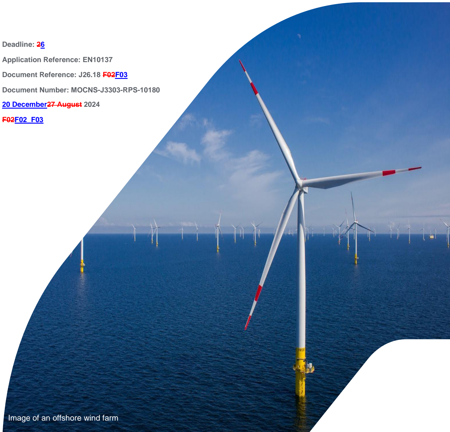
Image of an offshore wind farm