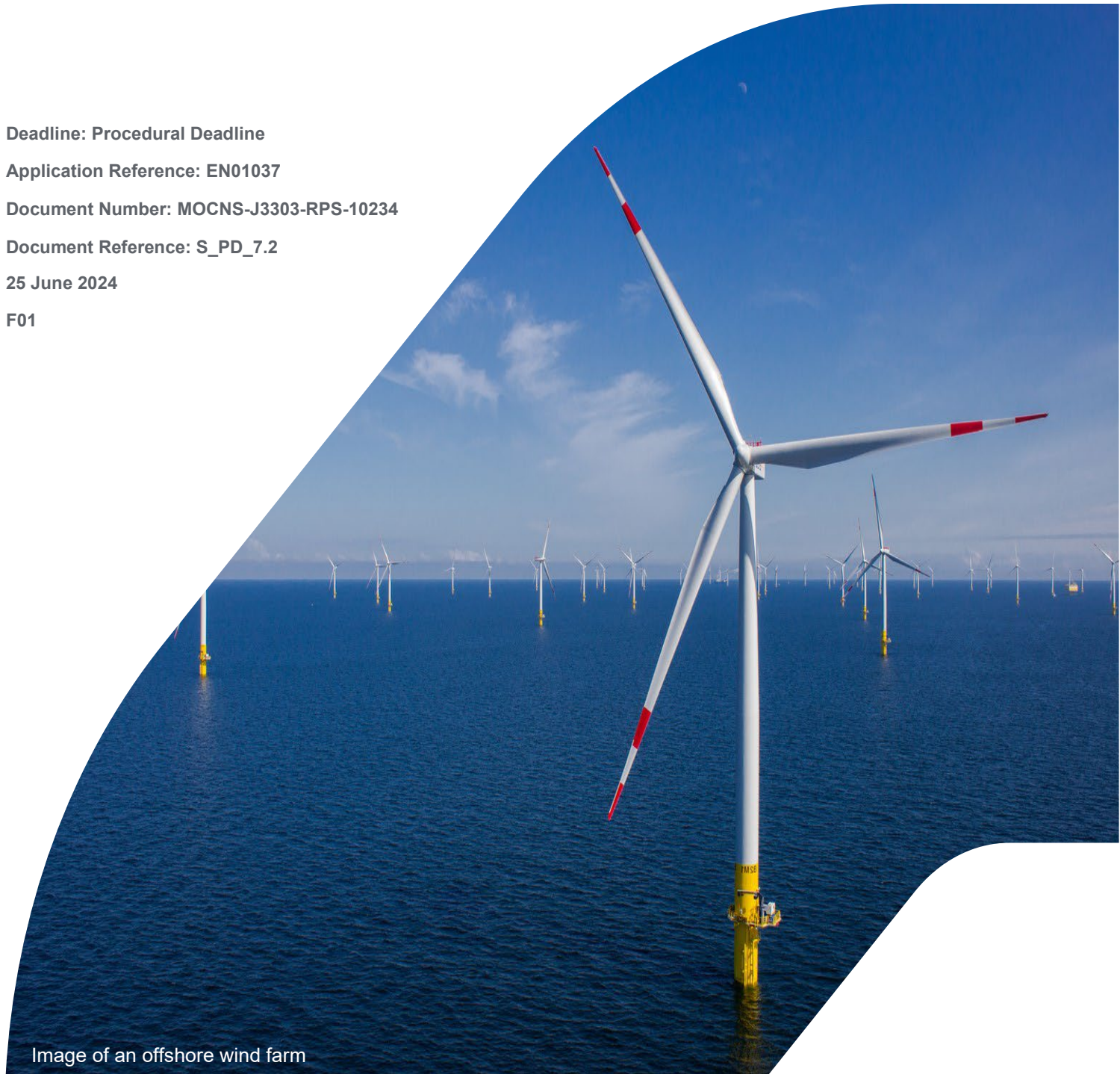
Image of an offshore wind farm