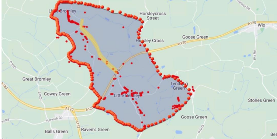
Figure 2 Stage 4 (targeted) consultation zone