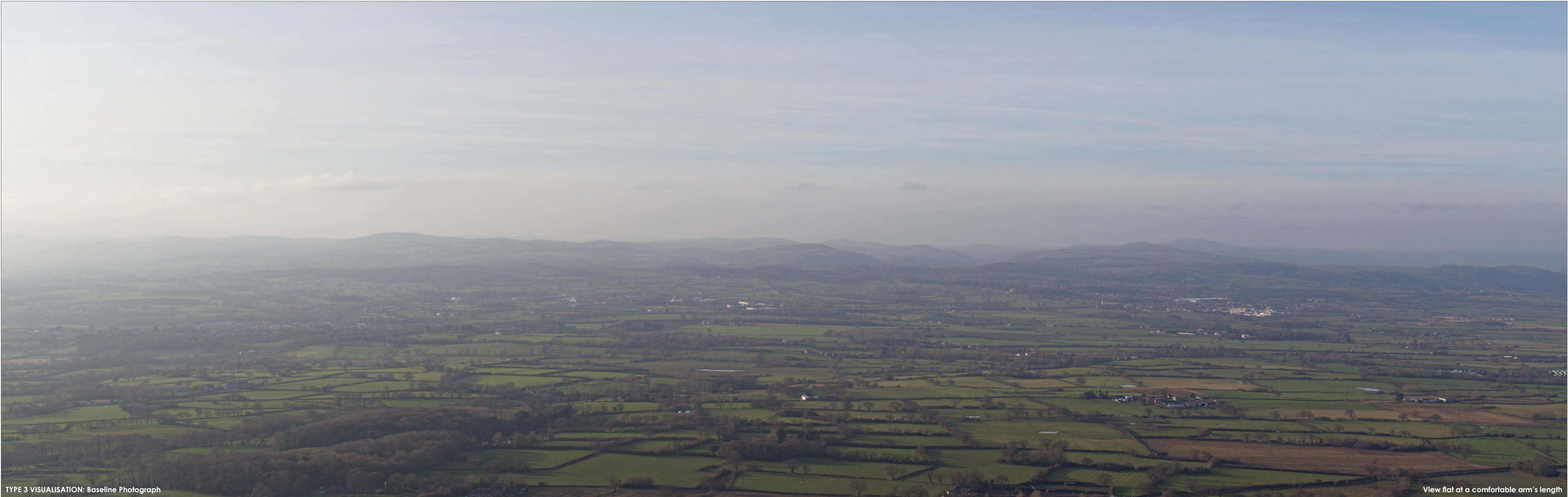
TYPE 3 VISUALISATION: Baseline Photograph