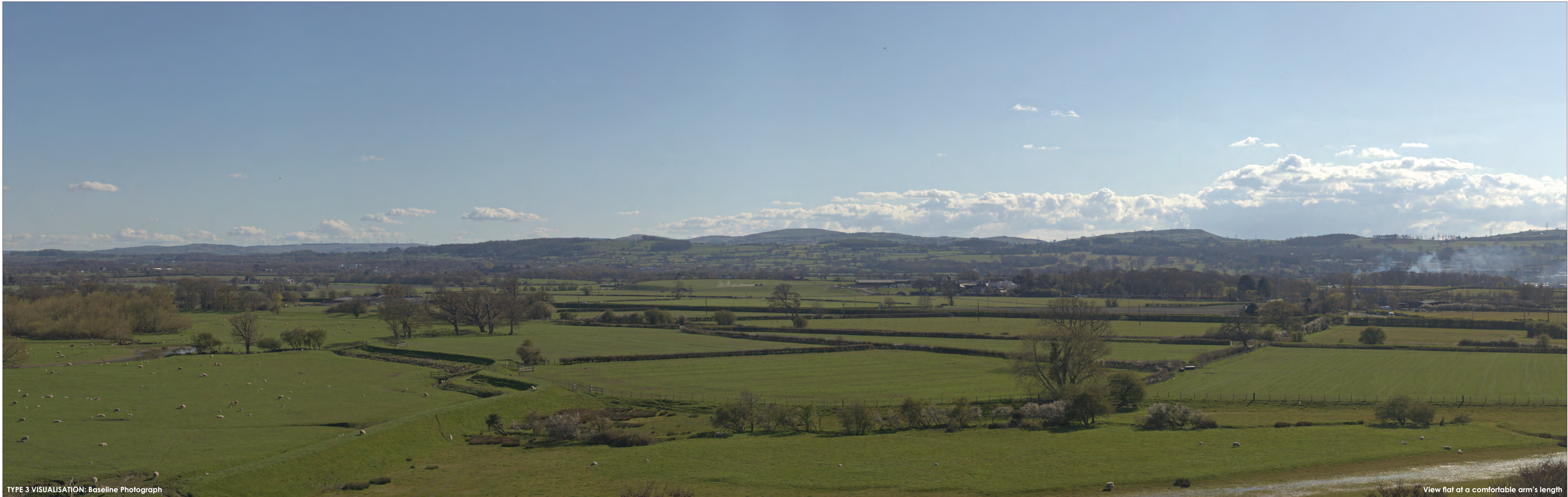
TYPE 3 VISUALISATION: Baseline Photograph