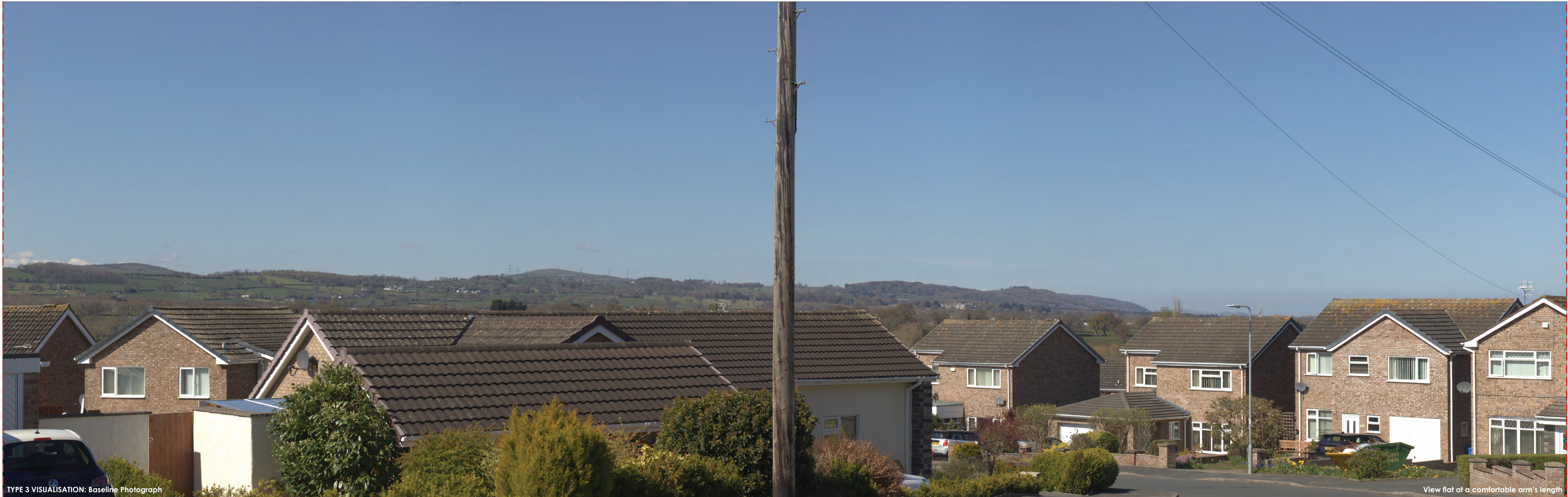
TYPE 3 VISUALISATION: Baseline Photograph