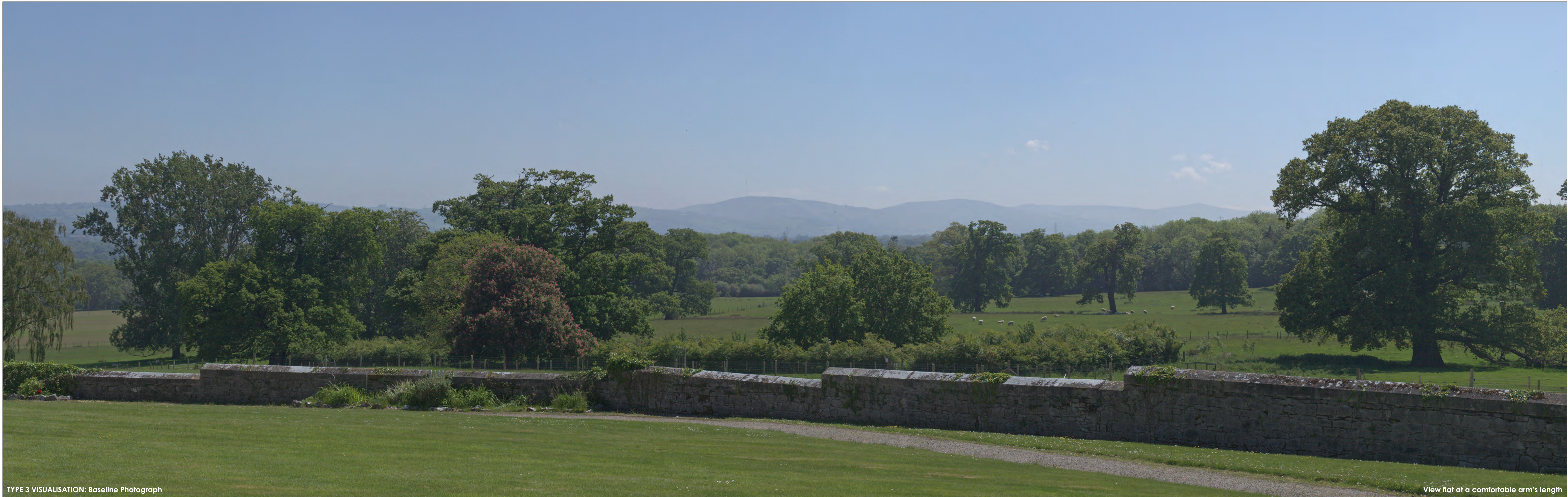
TYPE 3 VISUALISATION: Baseline Photograph