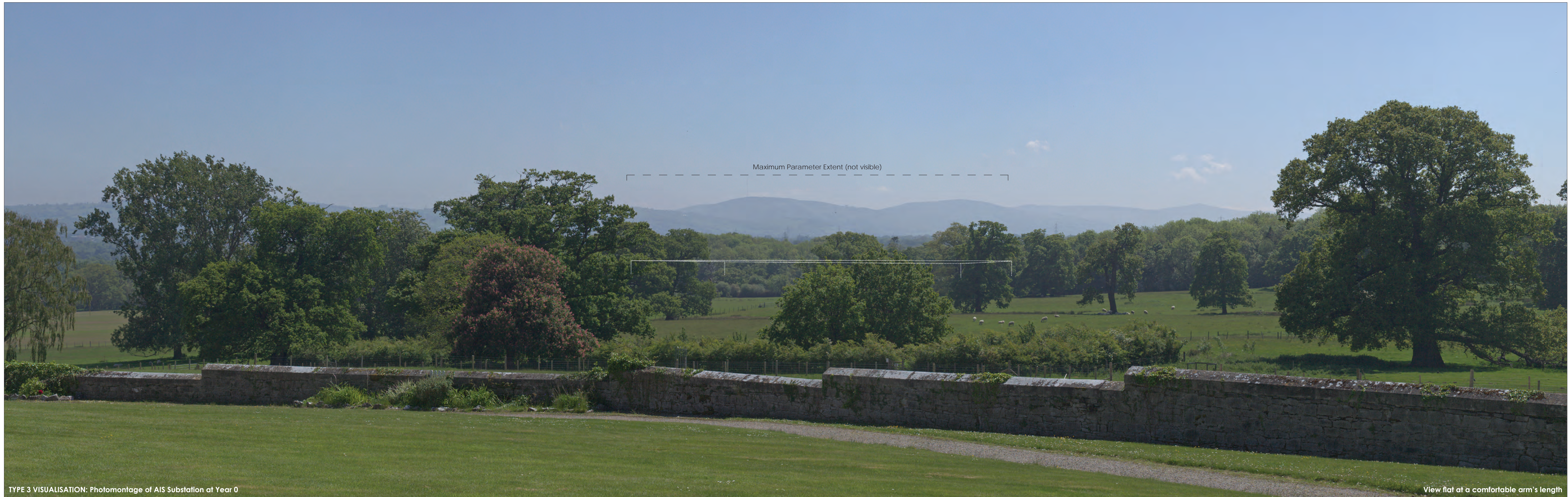
TYPE 3 VISUALISATION: Photomontage of AIS Substation at Year 0