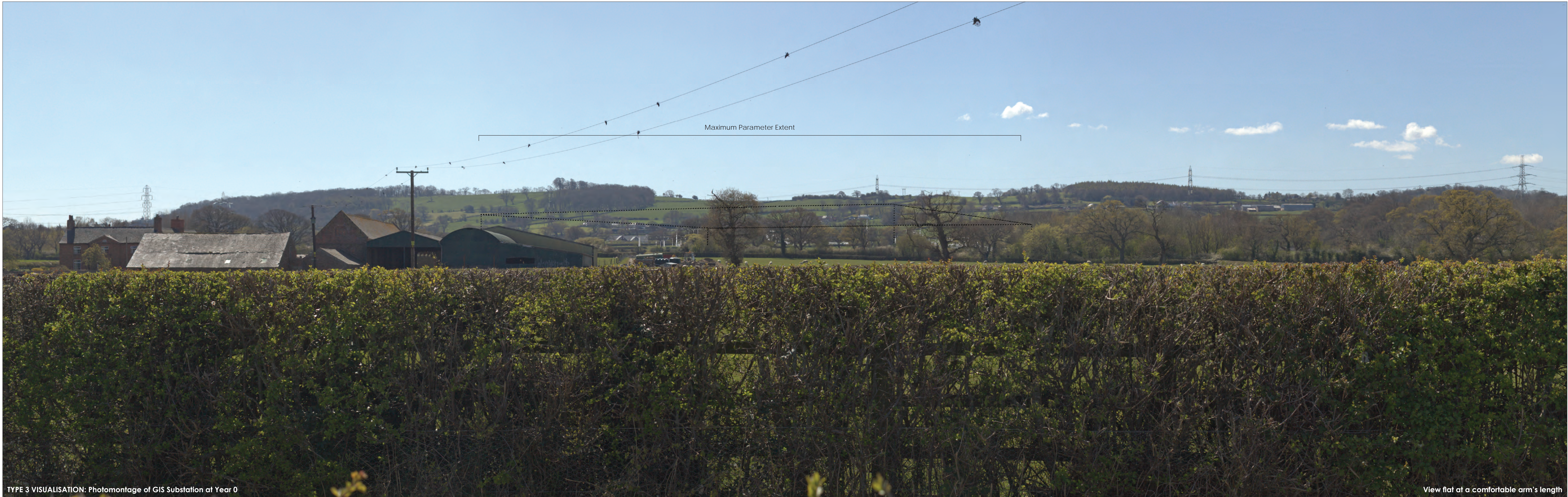
TYPE 3 VISUALISATION: Photomontage of GIS Substation at Year 0