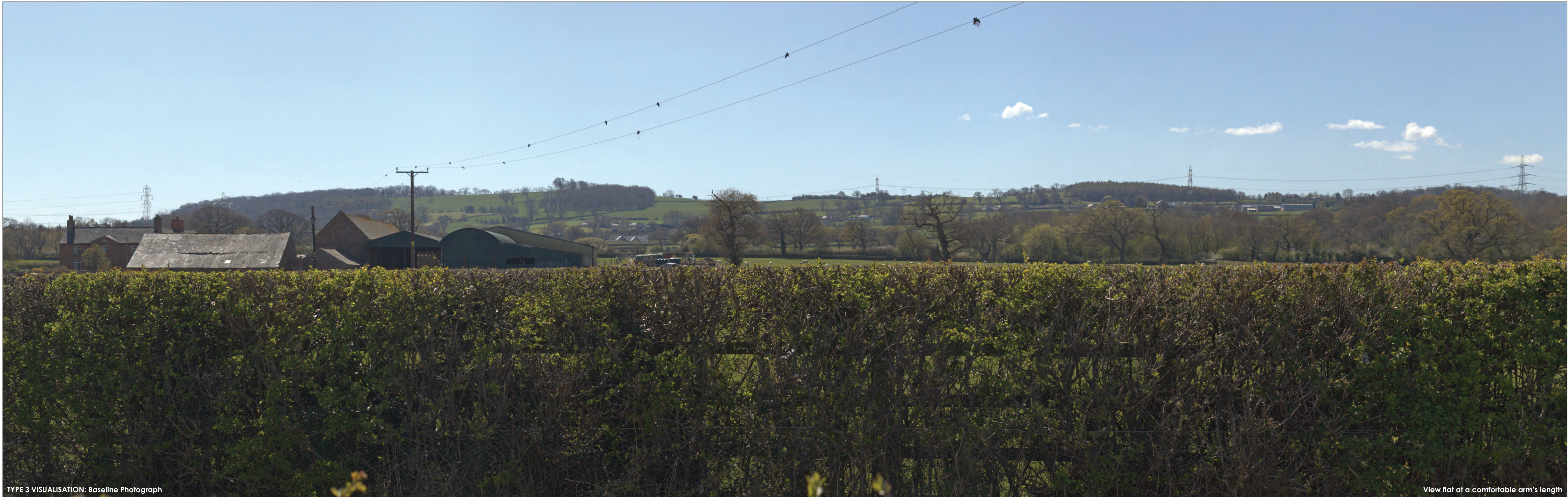
TYPE 3 VISUALISATION: Baseline Photograph