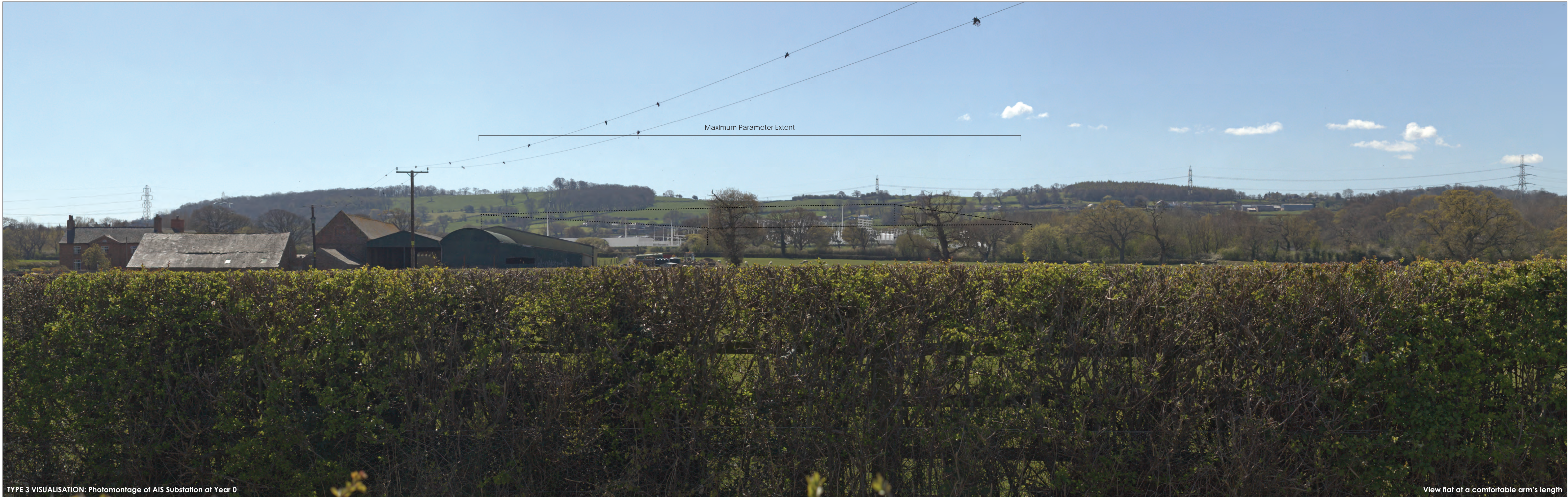
TYPE 3 VISUALISATION: Photomontage of AIS Substation at Year 0