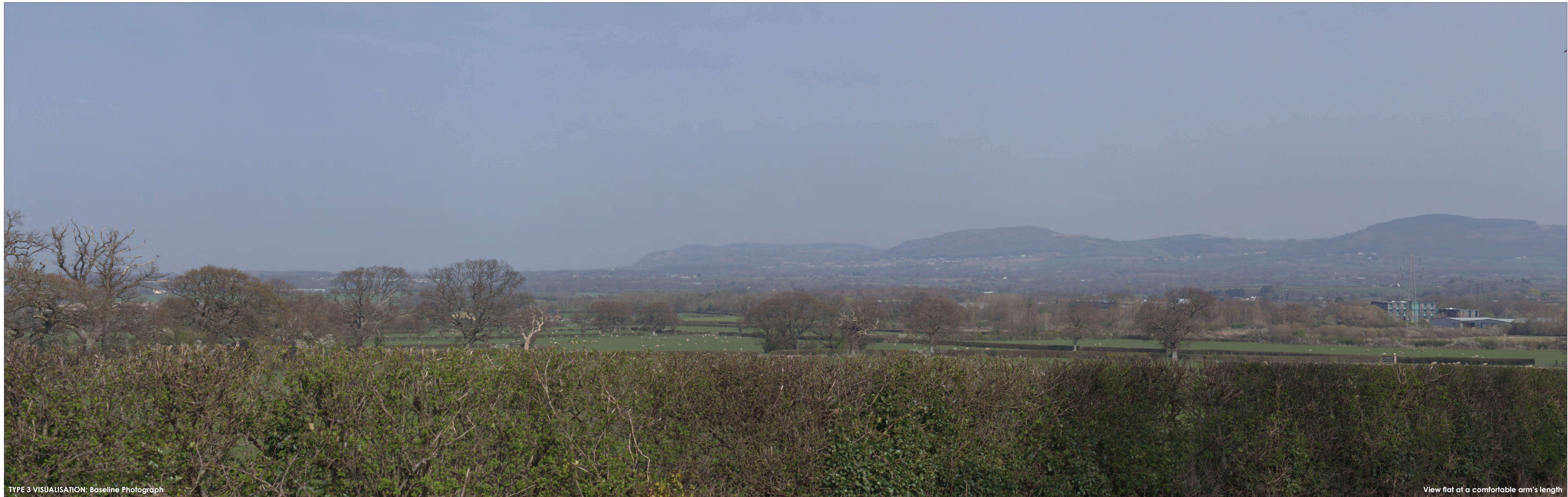
TYPE 3 VISUALISATION: Baseline Photograph