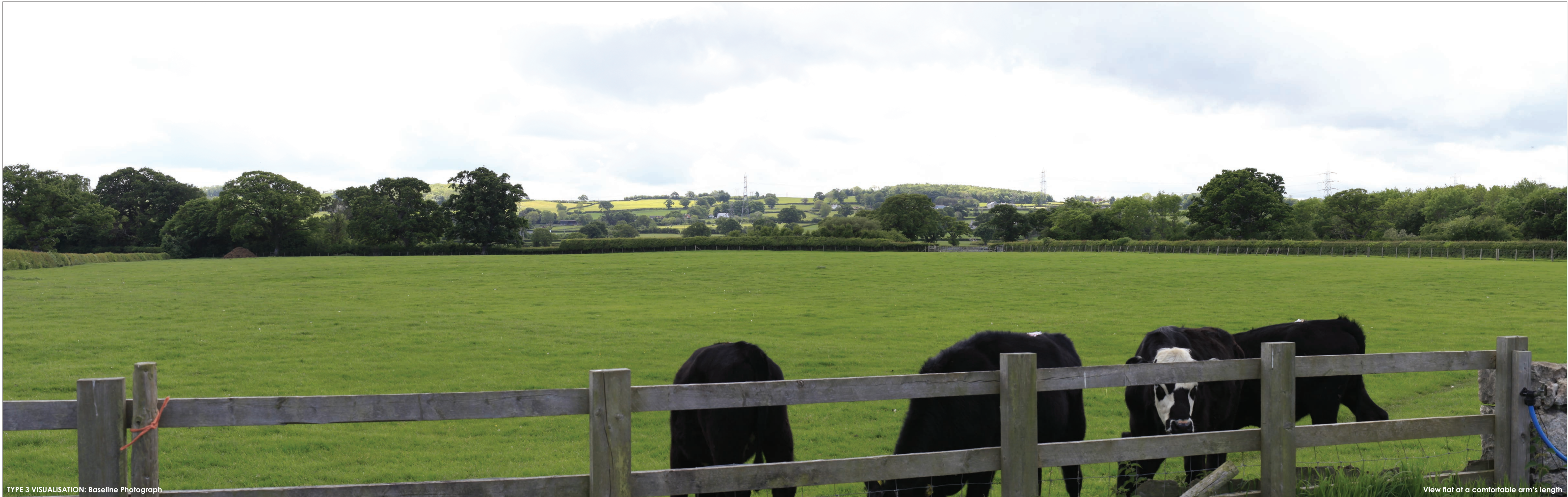
TYPE 3 VISUALISATION: Baseline Photograph