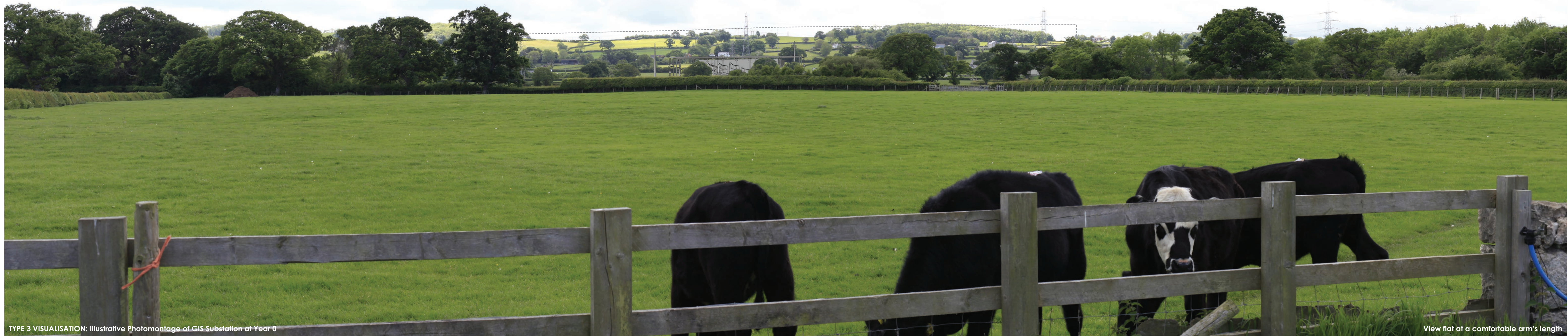
TYPE 3 VISUALISATION: Illustrative Photomontage of GIS Substation at Year 0