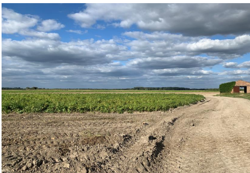
Site E05 looking north west in the vicinity of the Bomber Crash showing potatoes again being grown in 2023.