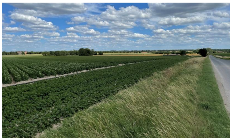
Site E05 taken in 2022 is from Beck Road Isleham looking south to the Lee Brook showing potatoes being grown. Such a crop is indicative of the land meeting Subgrade 3a of the ALC

7) Notwithstanding that IPC maintains its objection to the entire Sunnica proposal, IPC maintains its support of the joint host local authority request to remove parcel E05, the field closest to Isleham. Not only is this the site of the military plane crash, but it also has the most significant impact for Isleham in terms of landscape, it comprises high quality BMV soil, and it is a nesting site for stone curlew and other declining farmland birds. This is outlined in our REP3a-060 and further detailed on our REP4-100, REP6-067 and REP8-046.