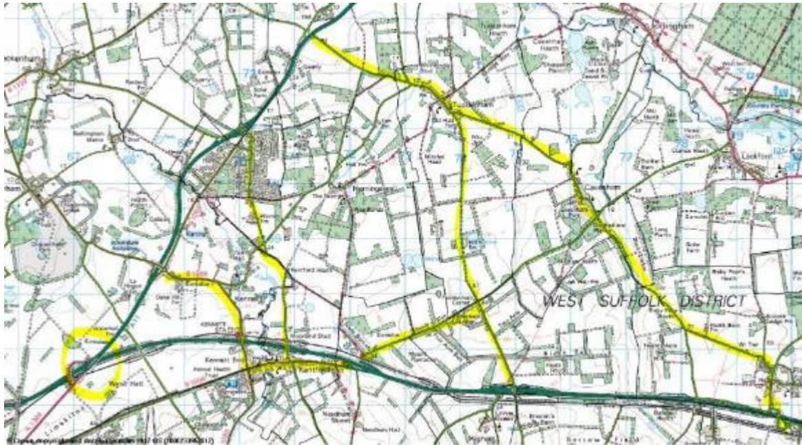
Figure 3: Location of A14/A11 junction (circled yellow) and other possible routes between the A14 and A11 (highlighted yellow)

7D.1. These are the main local routes between the A14 and the A11 and could be used by traffic wanting to get from the eastern A14 (Kentford, Risby, Higham) to the site via local roads through Cavenham and Tuddenham. A number of routes are identified in figure 3,