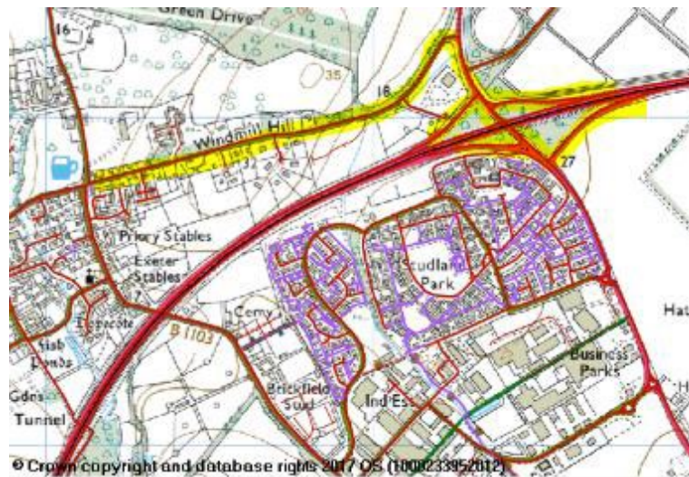
Figure 2: Location of A14/A142 junction, A143 and C751 (relevant portions highlighted yellow)

7B.1. Junction 37 is the junction on the A14 immediately to the west of the A14/A11 junction. Its location is identified in figure 2 to the north of Newmarket.