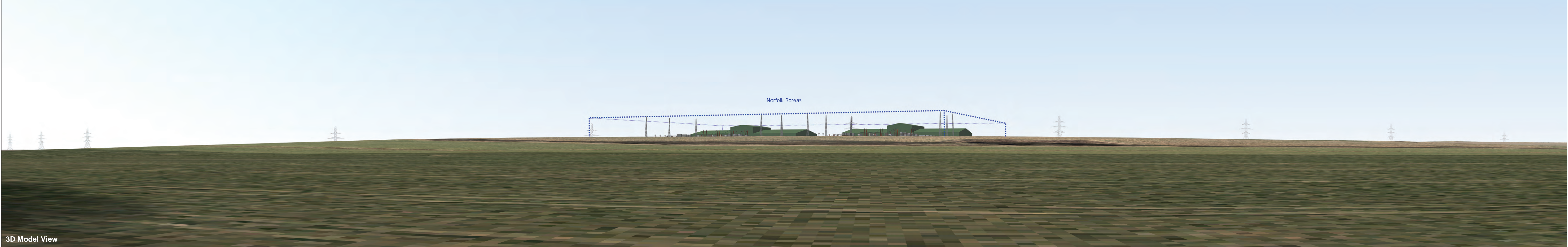
3D Model View

OS reference: 590306 E 309460 N Horizontal field of view: 90° (cylindrical projection) Camera: Canon EOS 5D Mark II Eye level: 63.2 m AOD Principal viewing distance: 522 mm Lens: 50mm (Canon EF 50mm f/1.4) Direction of view: 355° Camera height: 1.5 m AGL Nearest substation: 0.69 km Date and time: 25/01/2018, 12:13:16