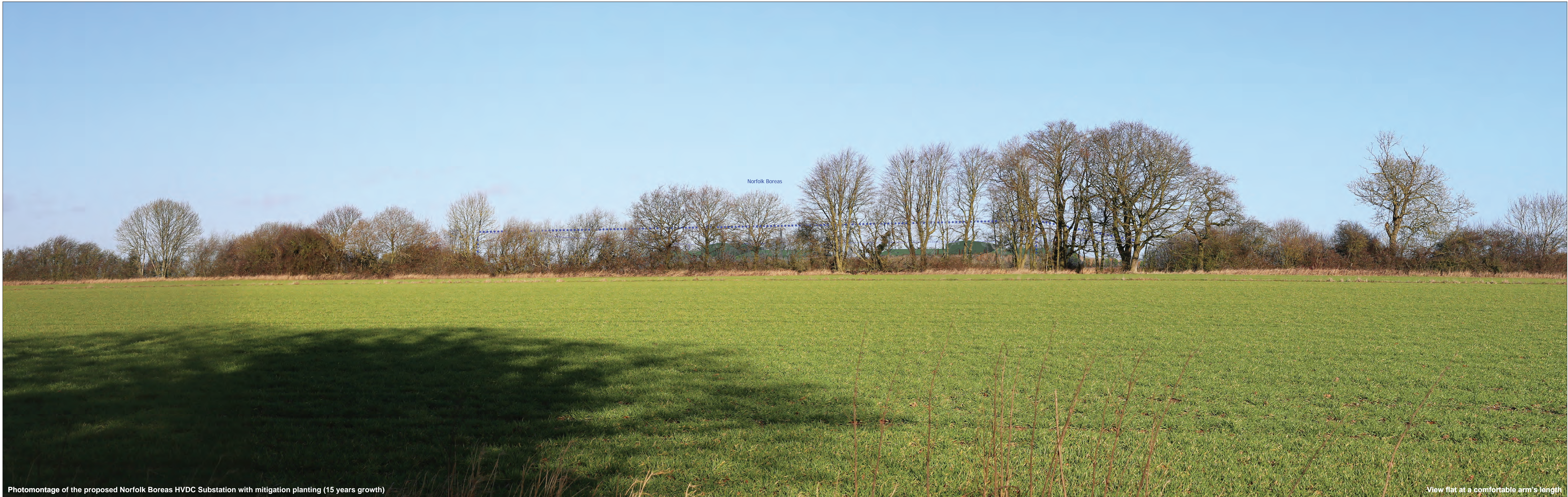
Photomontage of the proposed Norfolk Boreas HVDC Substation with mitigation planting (15 years growth)