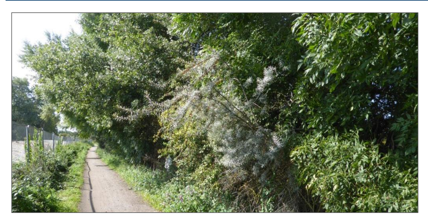
Plate 4: View (Looking South) of Another Part of Section C