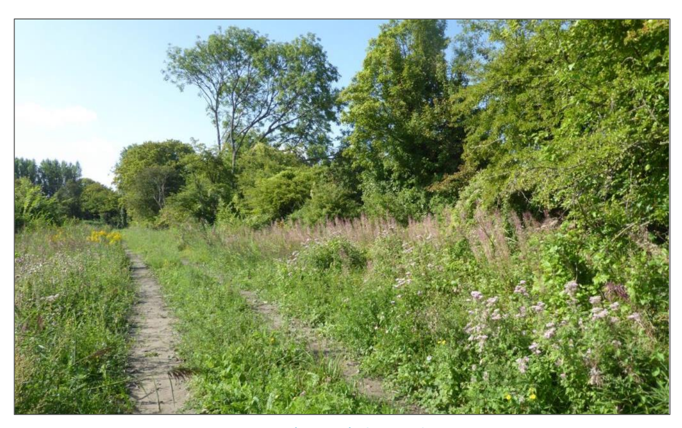
Plate 5: View (to south) of a Part of Section D