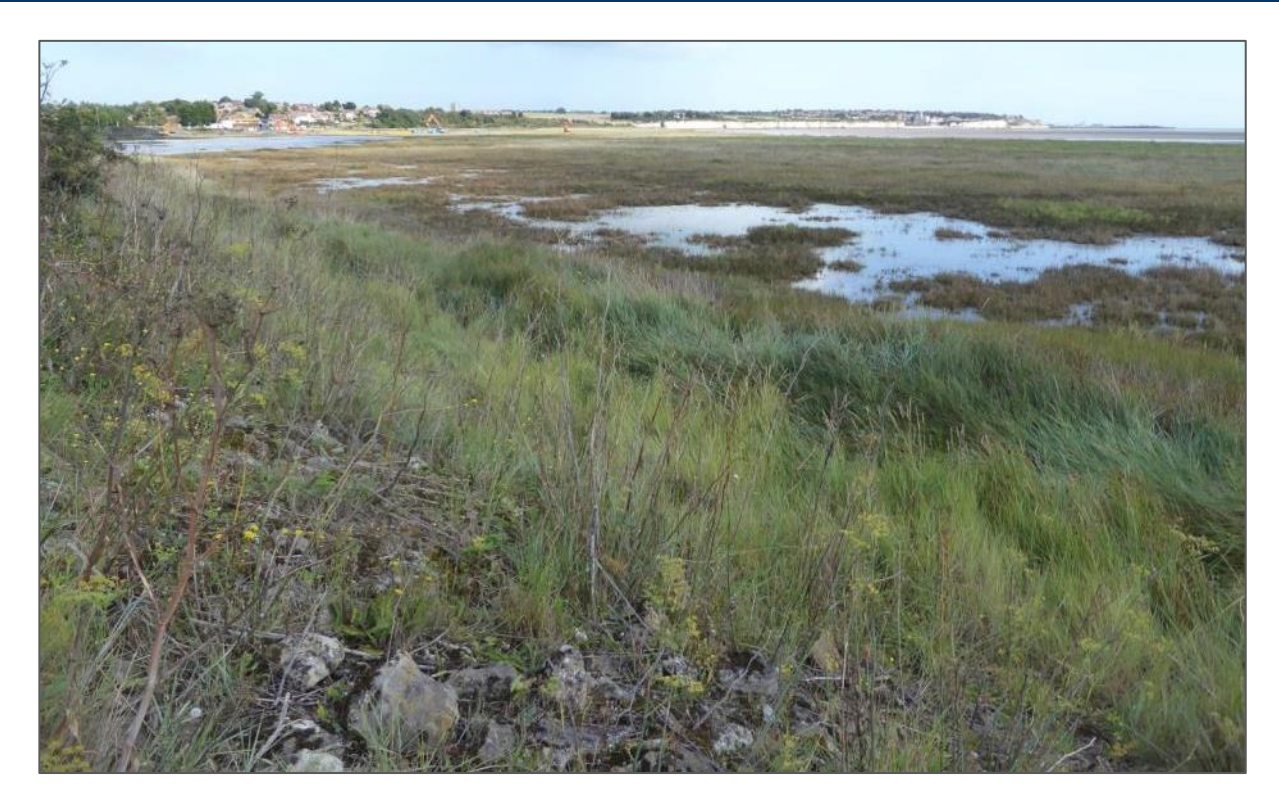
Plate 1: View of Section A from within Study Area

Sweep-netting resulted in a small number of Local species being found among which were the leafhopper Paramesus obtusifrons , this occurring on sea club-rush, and the reed damselbug ( Nabis lineatus ), a species associated with common reed. Also present in some abundance was the planthopper Prokelisia marginata , a species native to the eastern seaboard of North America where its host is the American cord-grass ( Spartina alterniflora ). This was first recorded in Britain from the Hampshire coast in 2008 and may have been introduced into Europe via packaging materials using cord-grass for the purpose (Badmin & Witts, 2010). It has also subsequently been recorded from the coasts of the Netherlands (2010) and northern Germany (2015) showing that the species is expanding its range on the continent (den Bieman and van Klink, 2016). In Britain, it has now colonised as far west as South Wales and as far north as the Humber Estuary.