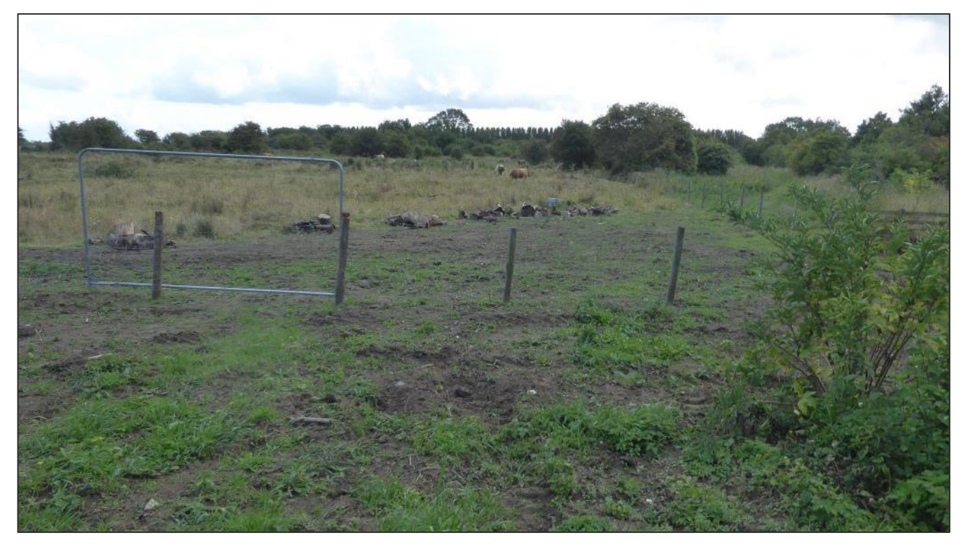
Plate 6: View (Looking South) of a Part of Section D with Dried Up Waterbody