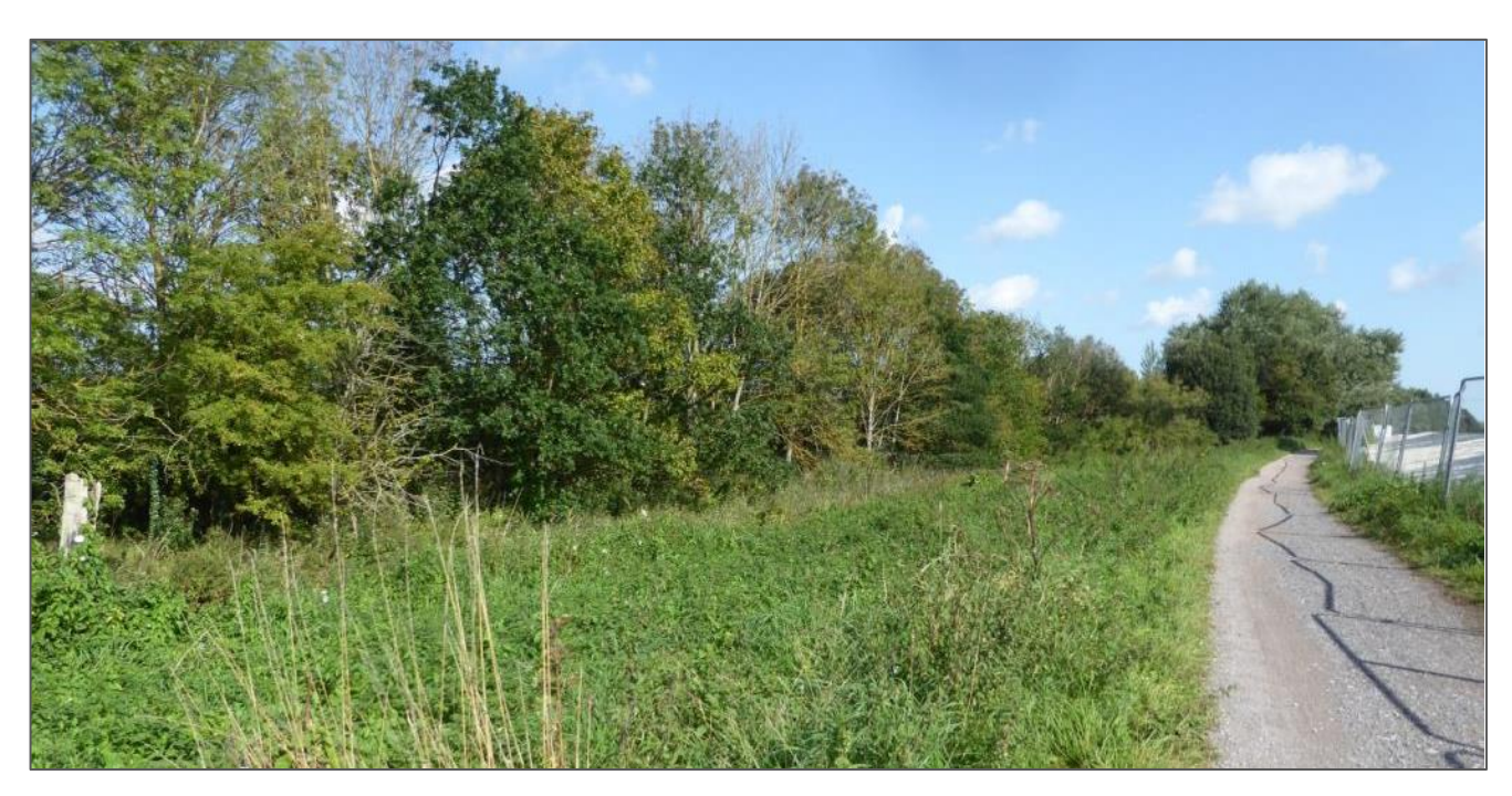
Plate 3: View (Looking North East) of a Part of Section C

A total of 34 species was recorded from this section. The major part of these were, unsurprisingly, largely arboreal in character. The most interesting species recorded, however, was a single male specimen of the red bartsia bee. This species times its flight period when its host plant, red bartsia, is in flower.