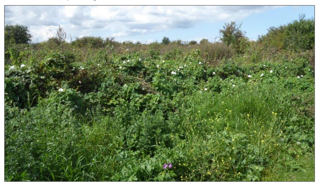
Plate 2: View (to north) of the Vegetation Characteristic of much of Section B

edges of a glade where artificial refugia (made of roofing felt) had been deployed for the reptile survey. Here too, the groundbug Beosus maritimus was found by inspecting the underside of the mats. B. maritimus is a Local species that frequents mostly coastal locations in the southern half of Britain. Larger numbers of B. maritimus were found a short distance further south-west in areas of grassland on a sandy substrate supporting locally abundant sea couch ( Elytrigia atherica ) where reptile refuge mats had also been laid. At this location a population of the nationally scarce rove beetle Paederus fuscipes was also found by examining the undersides of these reptile refuges.