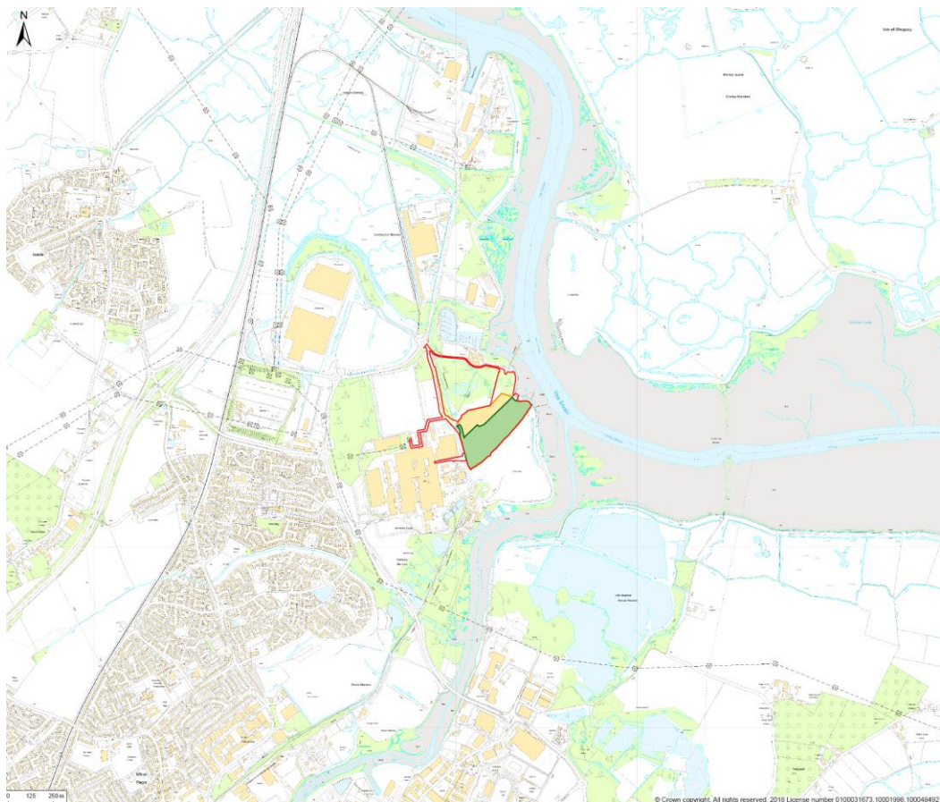
Figure 1: Location of the K3 and WKN sites