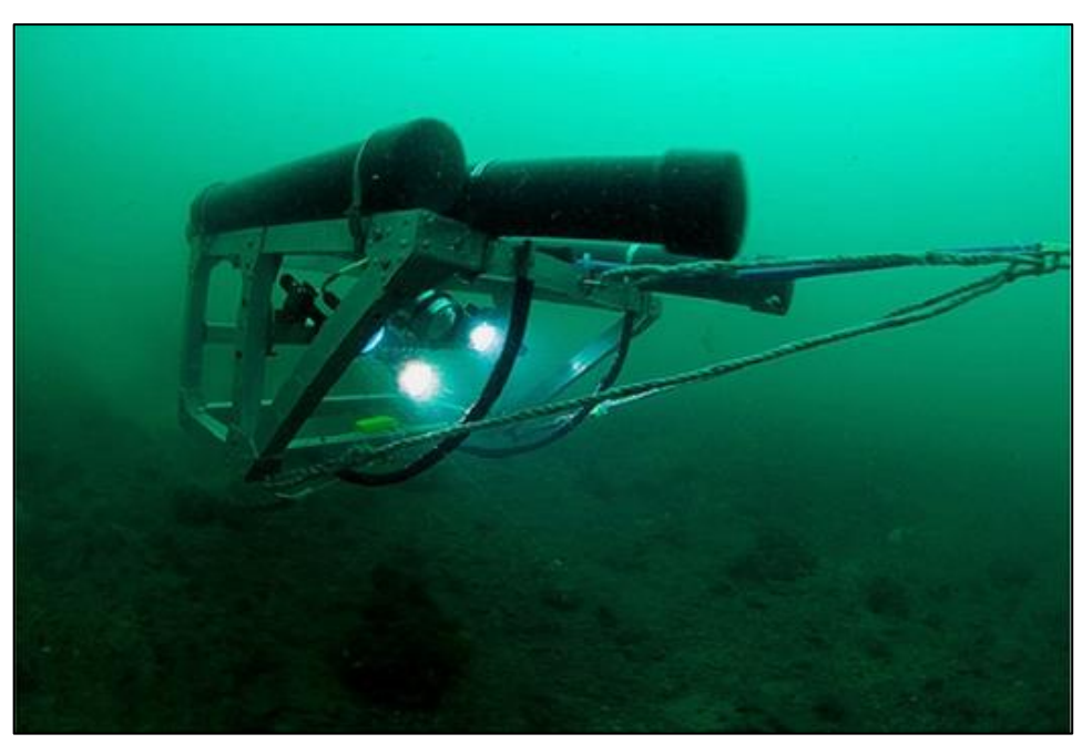
Figure 2: DDV recording epibenthos (Sheehan et al., 2013).