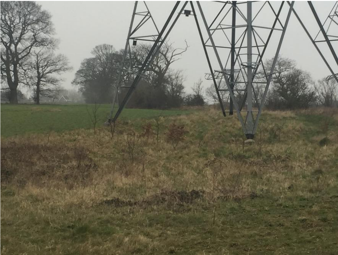
Hedgerow 4 (behind pylon)