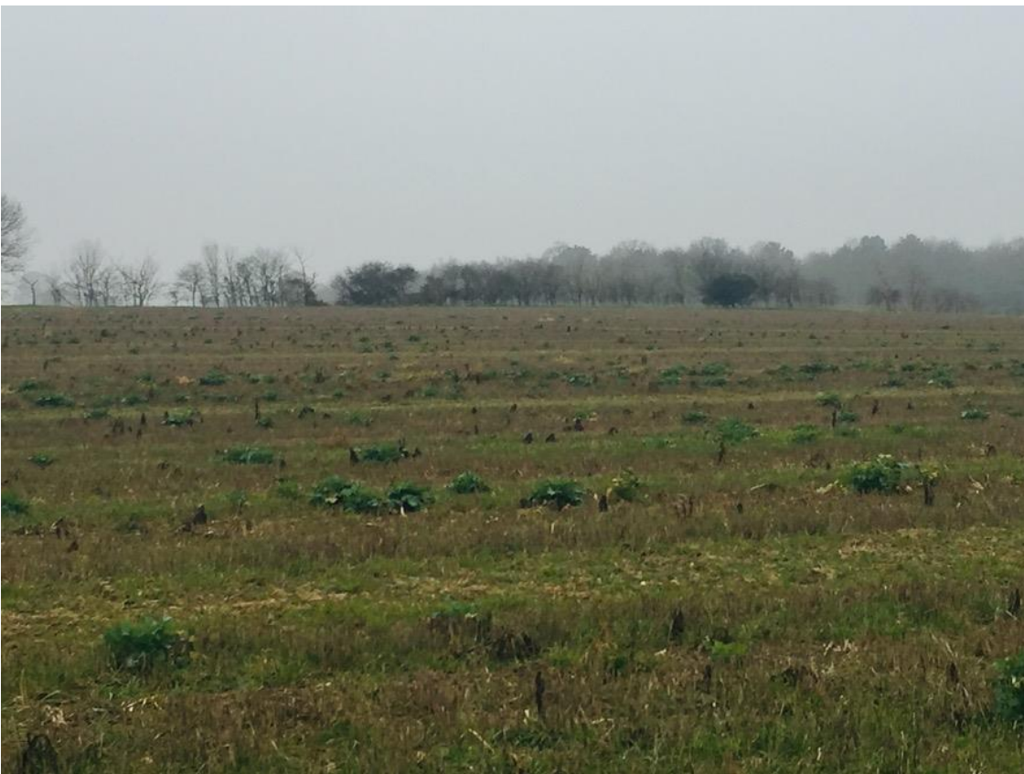
Hedgerow 5 (running west from wooded pit)