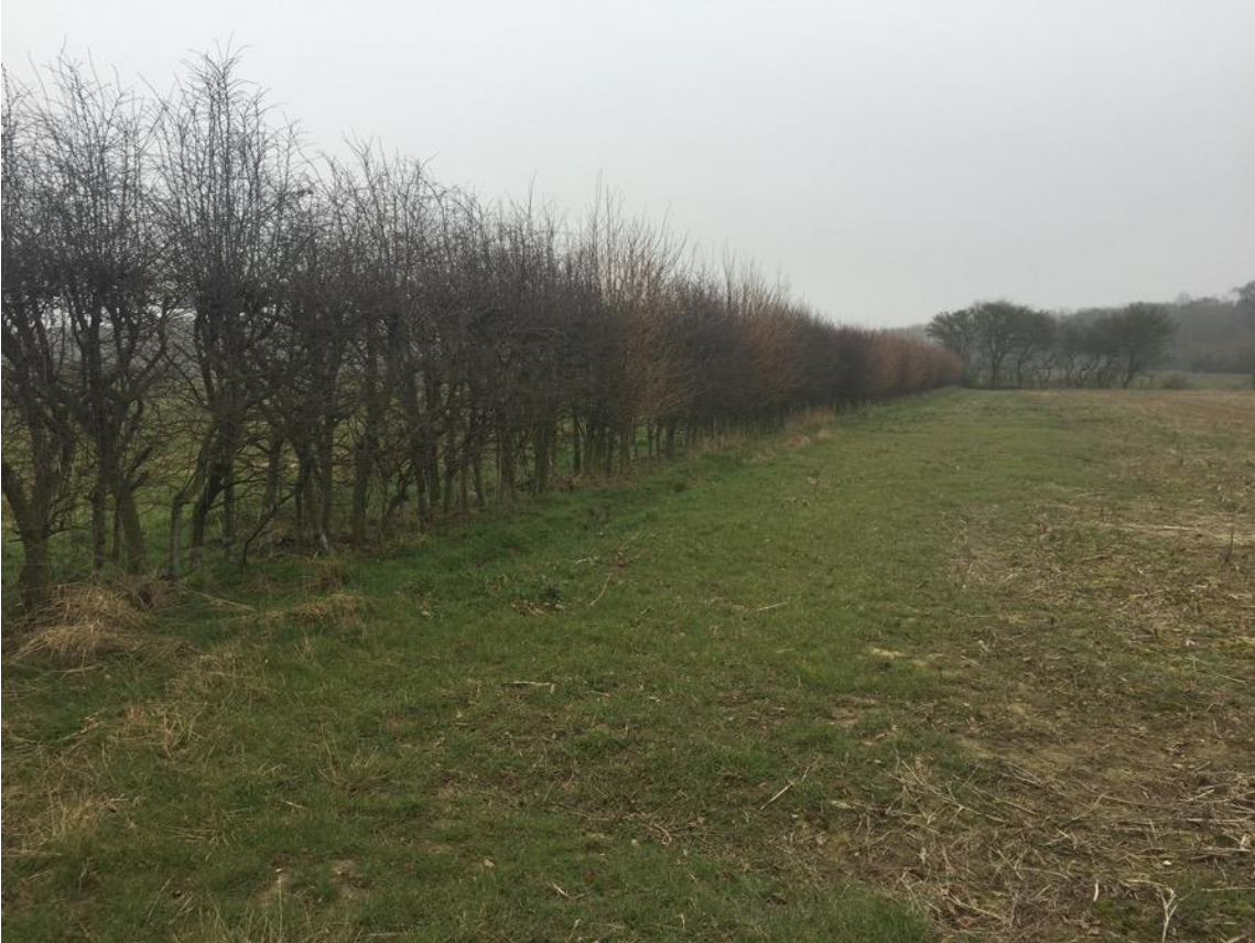
Above: Hedgerow 2 running west to east. Below: Hedgerow 3