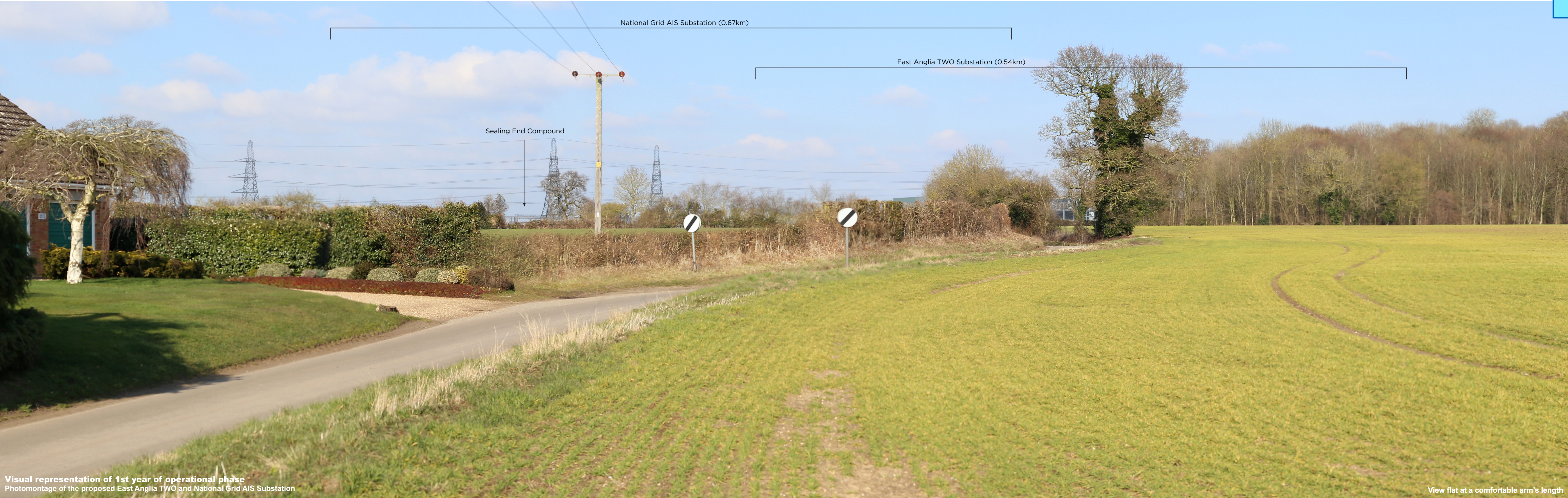
Visual representation of 1st year of operational phase Photomontage of the proposed East Anglia TWO and National Grid AIS Substation