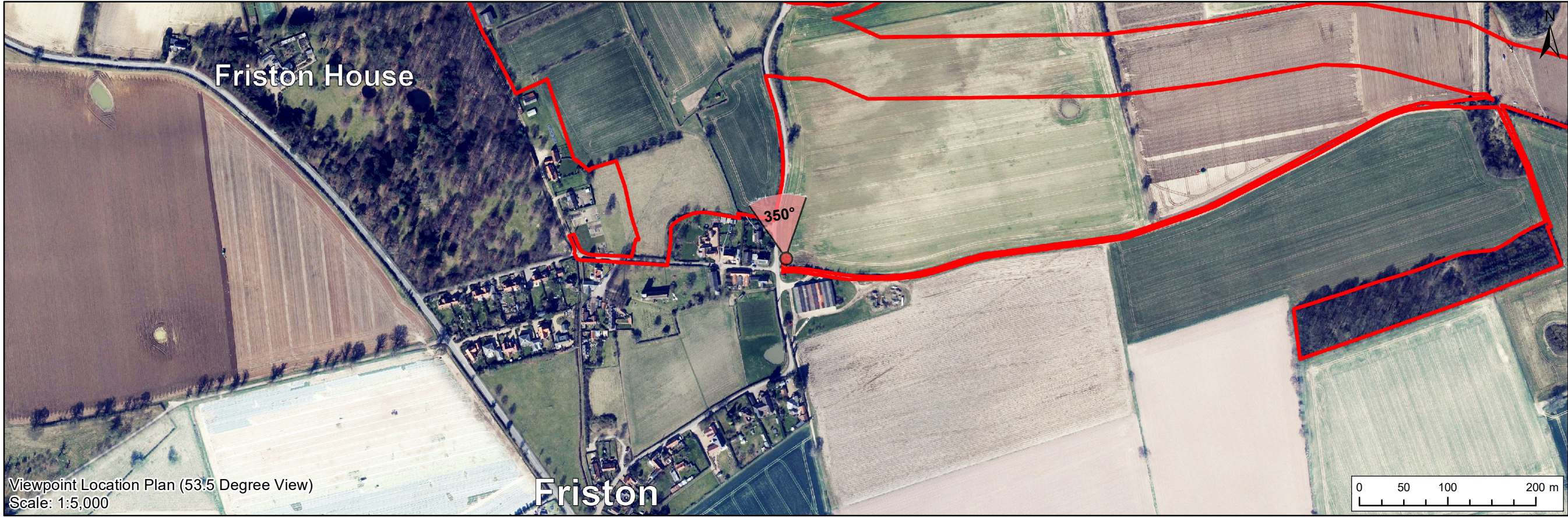
Viewpoint Location Plan (53.5 Degree View) Scale: 1:5,000