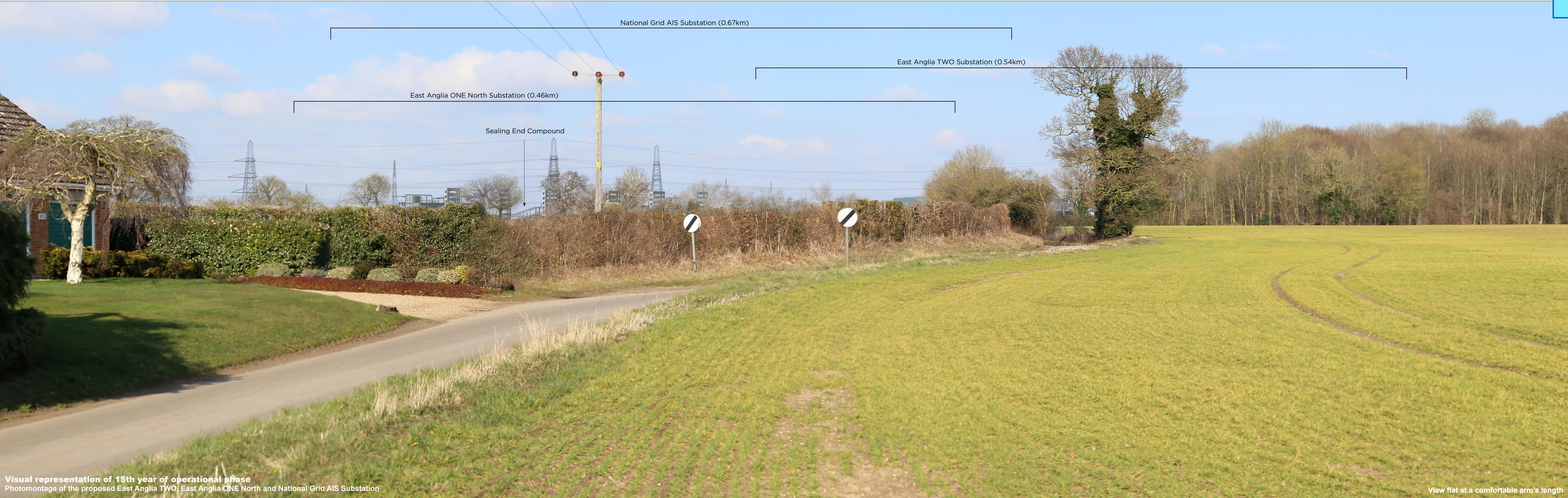
Visual representation of 15th year of operational phase Photomontage of the proposed East Anglia TWO, East Anglia ONE North and National Grid AIS Substation