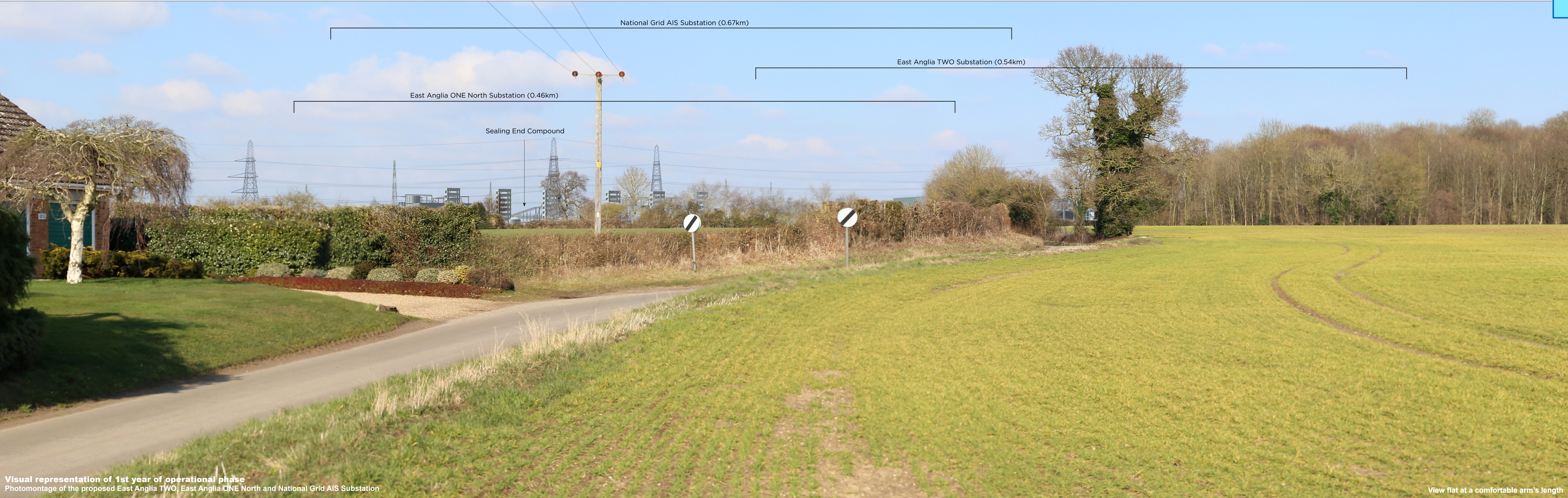
Visual representation of 1st year of operational phase Photomontage of the proposed East Anglia TWO, East Anglia ONE North and National Grid AIS Substation