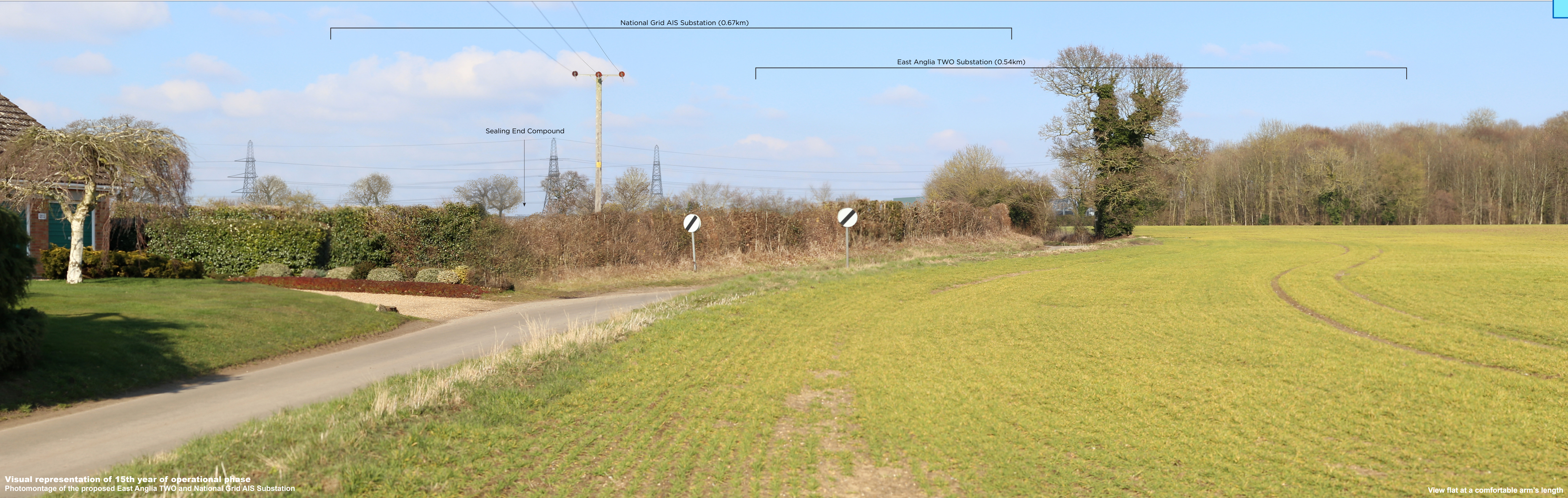
Visual representation of 15th year of operational phase Photomontage of the proposed East Anglia TWO and National Grid AIS Substation