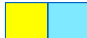
Table 3 Nuclear safety and the Projects' draft DCO