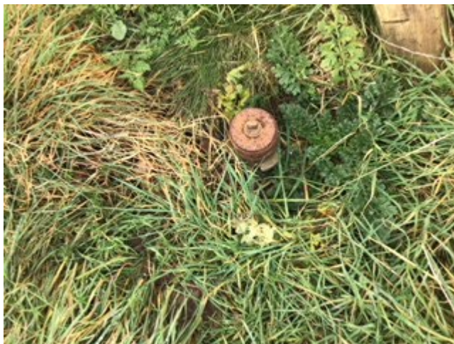
Figure 3. Photograph of potential additional borehole near Ness House, A ( detail).