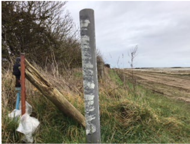
Figure 2. Photograph of potential additional borehole near Ness House ( A on map).