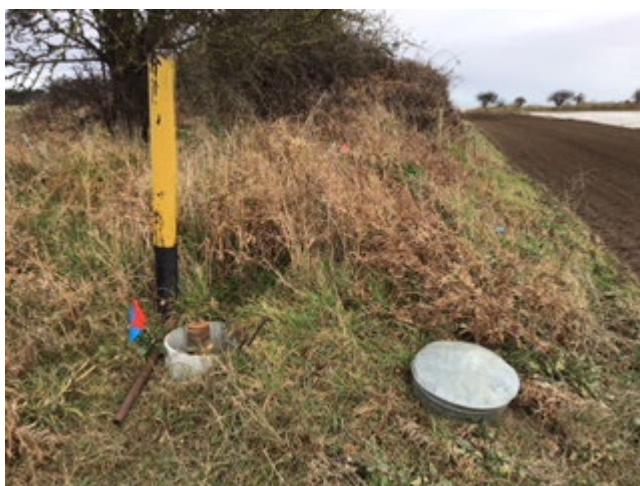
Figure 4. Photograph of potential additional borehole near Ness House ( B on map).