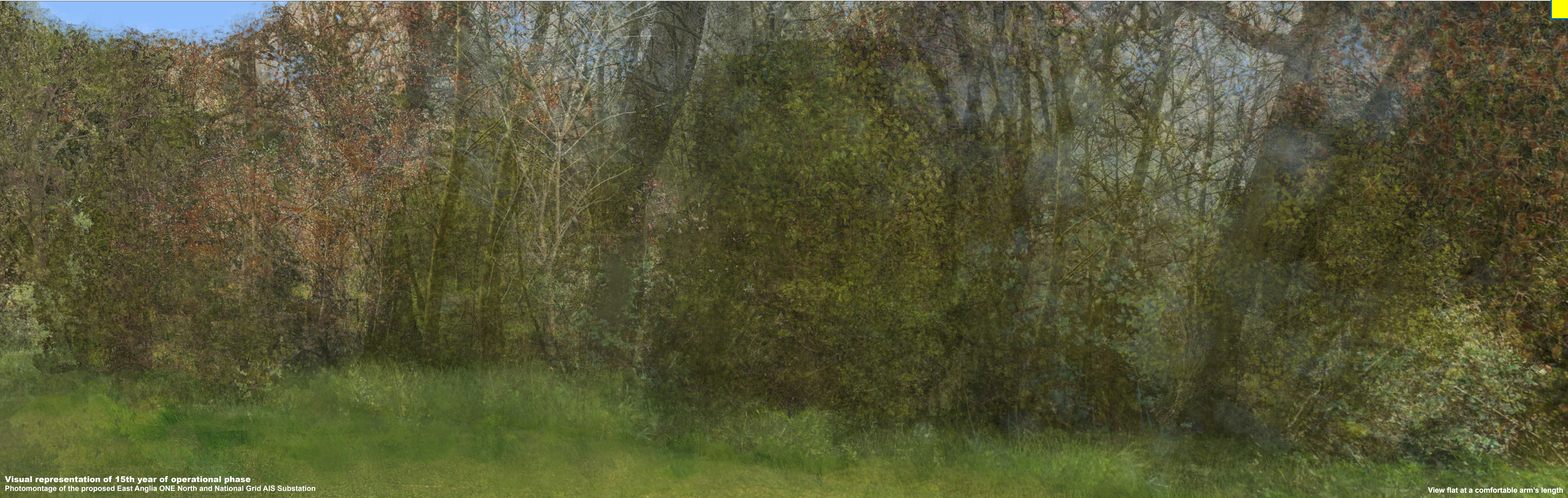
Visual representation of 15th year of operational phase Photomontage of the proposed East Anglia ONE North and National Grid AIS Substation