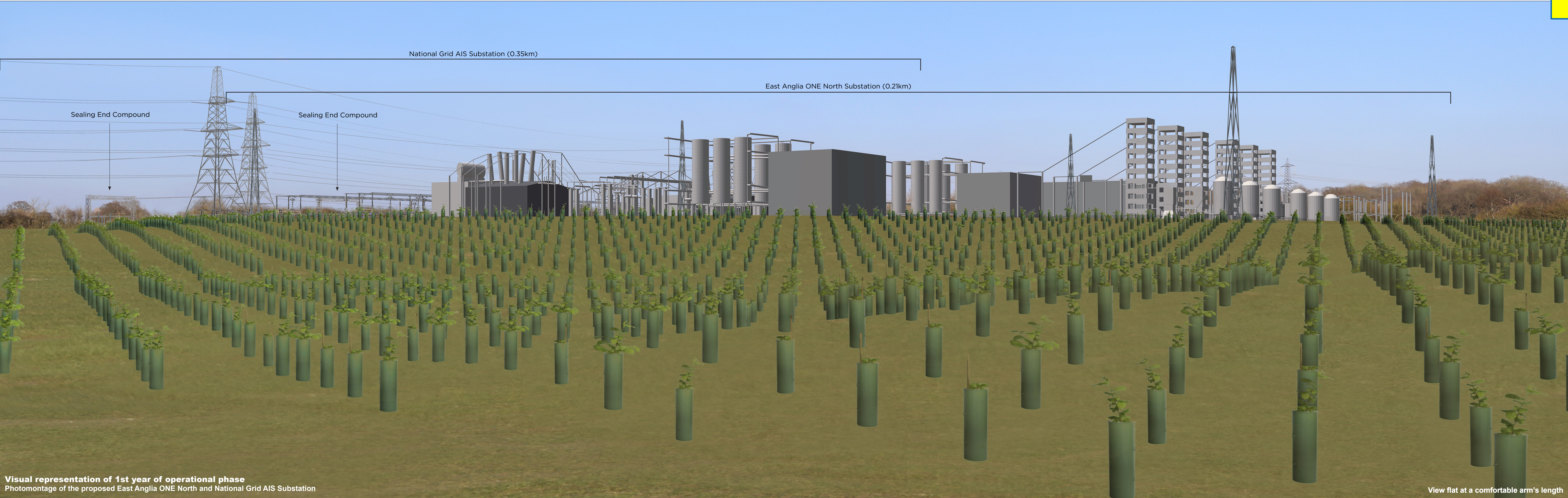
Visual representation of 1st year of operational phase Photomontage of the proposed East Anglia ONE North and National Grid AIS Substation