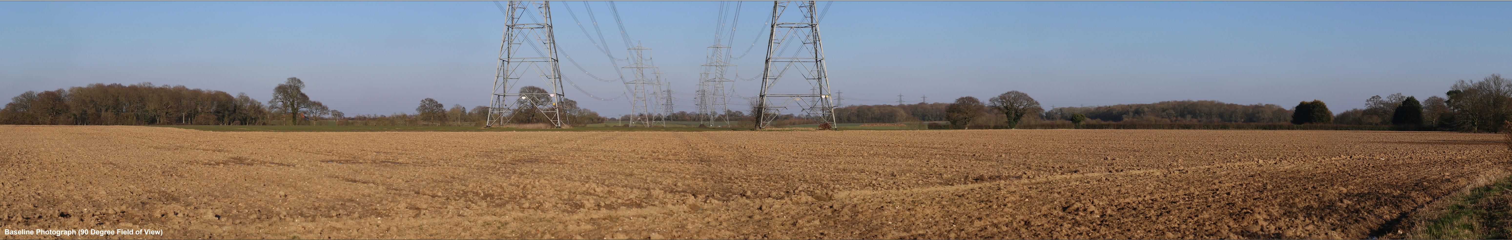
Baseline Photograph (90 Degree Field of View)