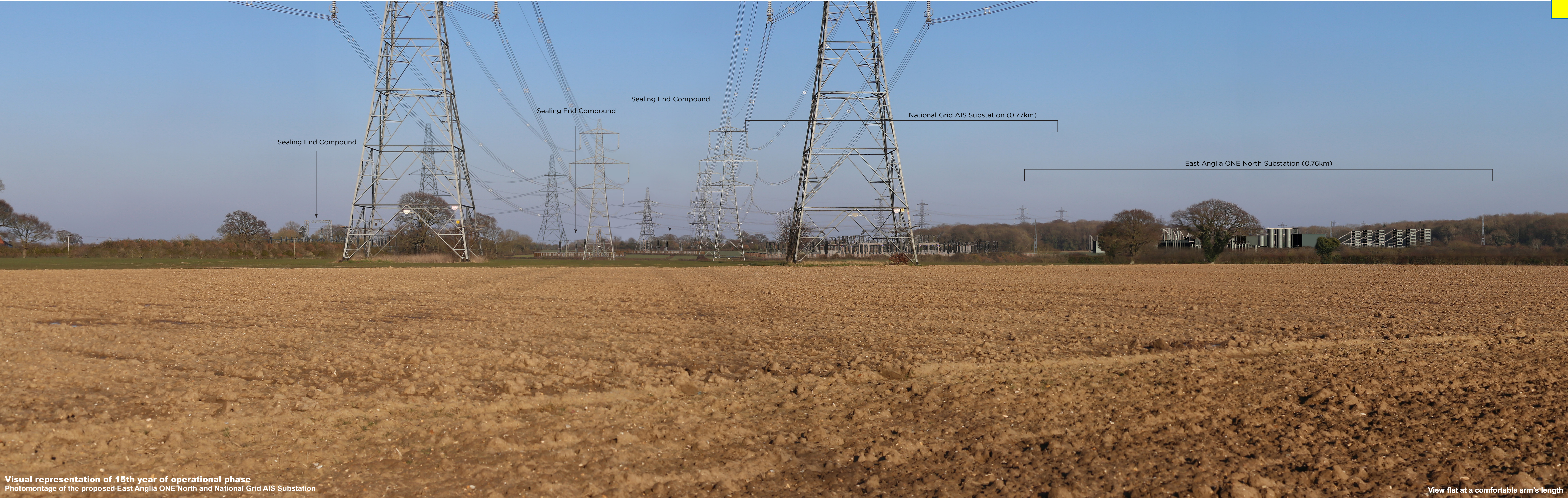
Visual representation of 15th year of operational phase Photomontage of the proposed East Anglia ONE North and National Grid AIS Substation