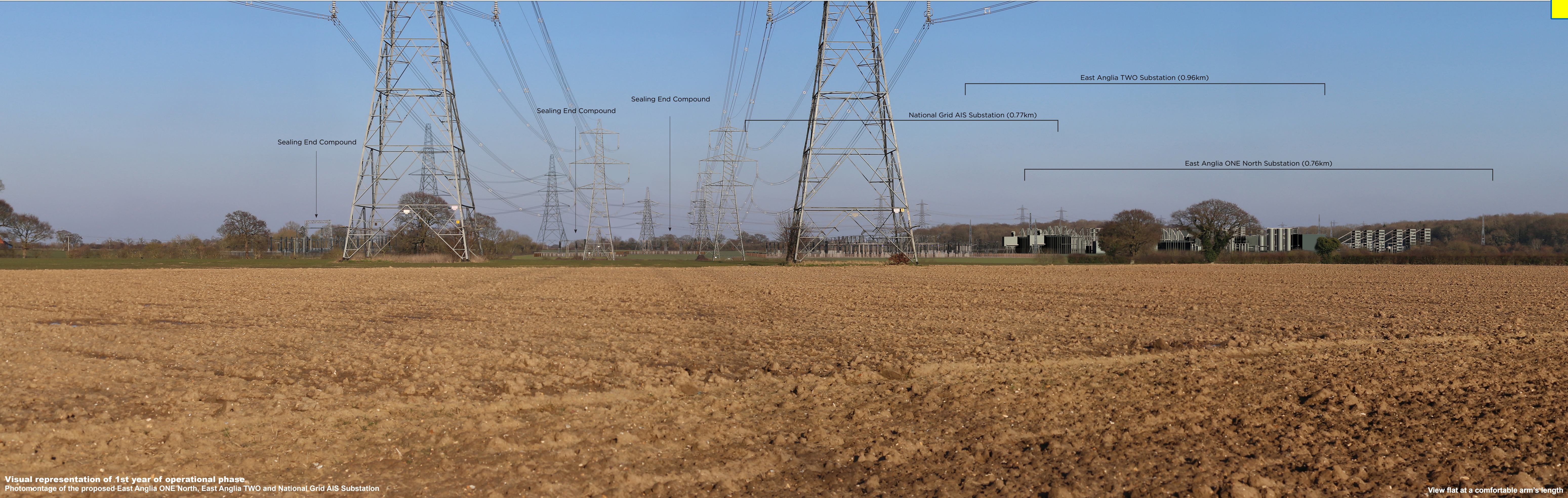
Visual representation of 1st year of operational phase Photomontage of the proposed East Anglia ONE North, East Anglia TWO and National Grid AIS Substation