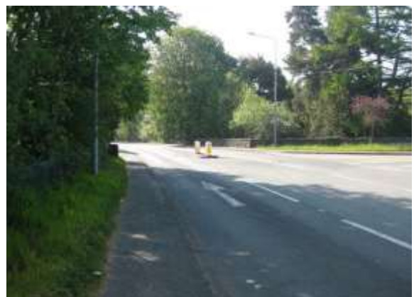
26. View west on to A4085, footway to