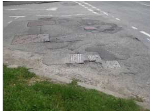
38. Existing service covers at western side of A4085 at its junction with unnamed road from Croesywaun to Groeslon, areas of degradation to the highway covering the width of the lane.