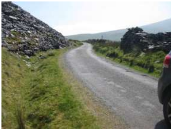
59. View east on unnamed road, grass verge to the north side of the highway, stone walls to the south.