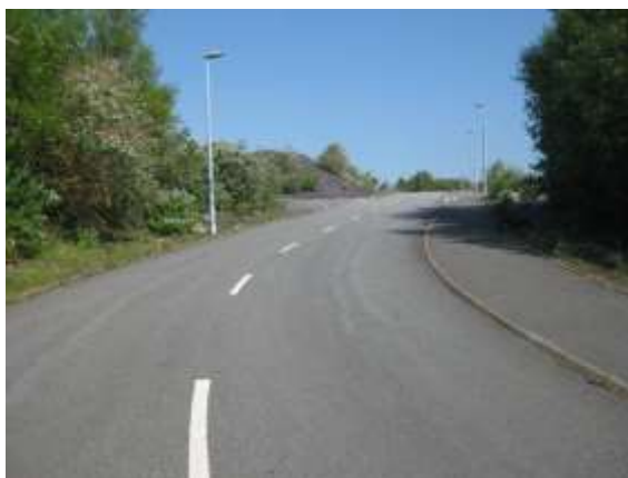
19. View north on Glyn Rhonwy towards site access. Footway to the east, street lighting begins within this area as shown.