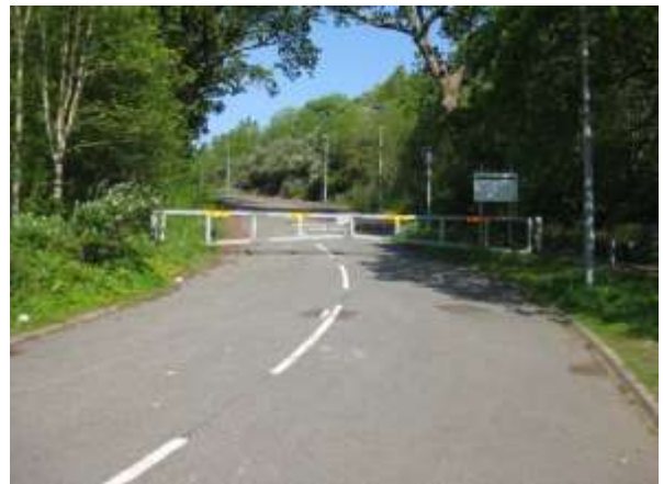
22. View of industrial access road to Glyn Rhonwy which has been gated to prevent unauthorised access to the site. The road is signposted and has street lighting.