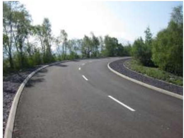
6. View south at newly constructed industrial road - Loosely surfaced footway at either side of newly constructed highway