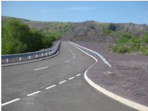
5. Newly constructed highway accommodating white lining and raised area to the east.