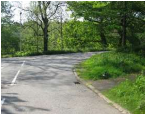
23. This junction provides an access onto the local highway network from the site and accommodates highway signage. There is a narrow tarmacked footway to the eastern side