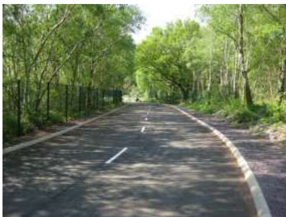
9. The route to the edge of the quarry forms a side road with the spine road