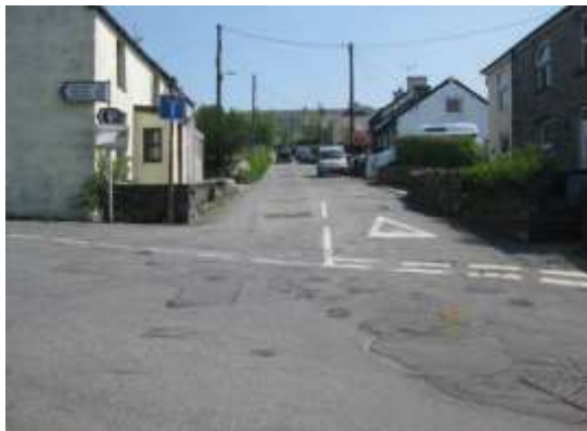
49. Junction at Groeslon looking east towards quarry site. Narrow highway restricted by on-street parking throughout.