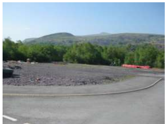
10. Disused quarry site to act as site for construction traffic parking. Large,