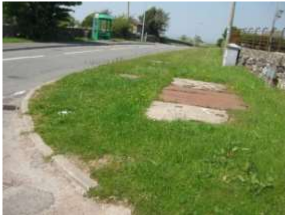
37. Existing service covers on grass verge adjacent to A4085. Damage to existing kerbs, with single kerb missing.

which is a two-lane single carriageway road to a single, gravel track leading to the site from Groeslon which contains a number of restrictions.