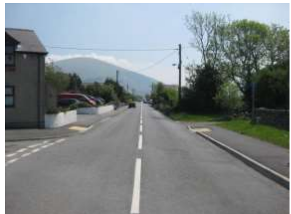
40. A4085 – Tactile paving located on both east and west lanes.