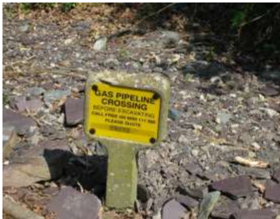
21. Existing, damaged pipeline marker at gated access to Glyn Rhonwy.