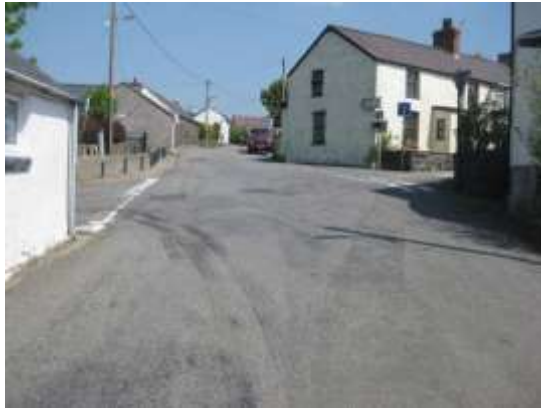
47. Groeslon crossroads looking north features white lining at the junctions but no centre-lines. The highway is closely bound by residential dwellings and is of reasonable condition. There is a paved area to the north west of the junction which is protected by short bollards.