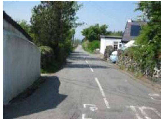
48. View south from crossroads at Groeslon. Buildings and related accesses back on to highway.