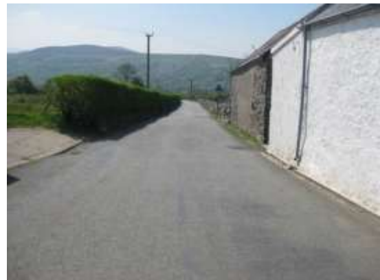
50. View west from Groeslon crossroads away from Q1. Unmarked road bound by dwellings to the north and existing access to the south.