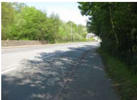
25. View east on A4085, footway to either