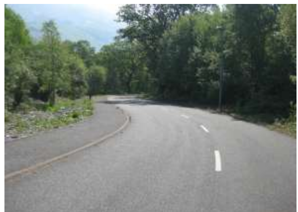
20. North on to Glyn Rhonwy heading towards A4086 junction. Footway to the west.