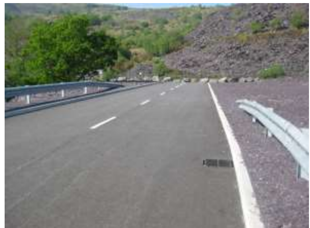
4. Existing high quality highway with Glyn Rhonwy site – kerbing in good condition and white lining provided.