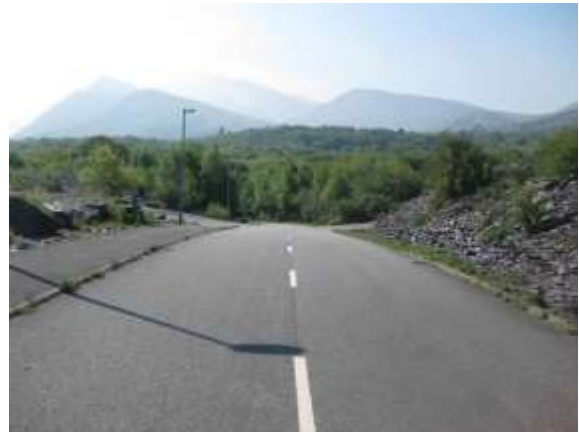
16. View north on to newly constructed, highly, footway to the west and loose material to the east.