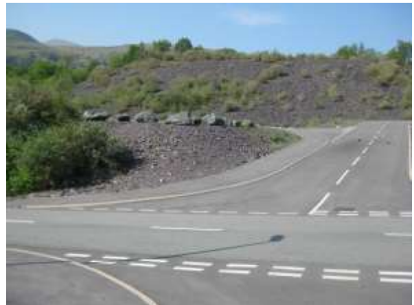
18. Glyn Rhonwy crossroads with priority north/south. Priority junction heads towards platform area.