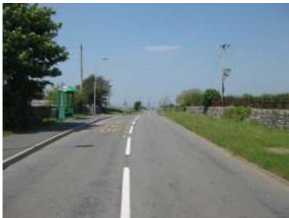
39. View west on to A4085 – Cantilever bus stop shelter with road markings.