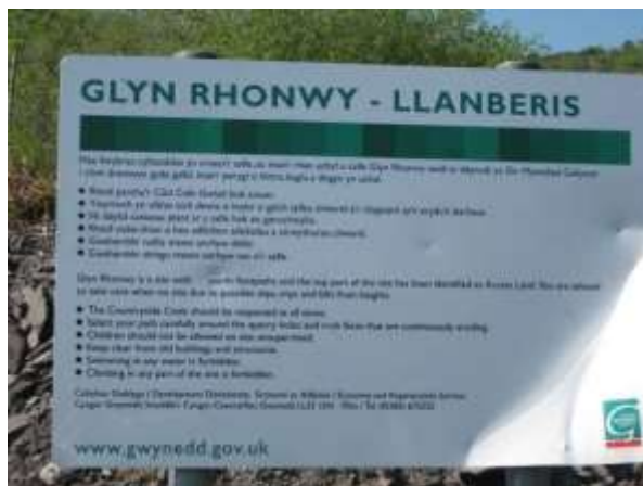
1. Existing signage at Glyn Rhonwy site access.

The condition of the industrial estate road and route to Q6 is shown on photographs 1-36 below. This route provides a high quality access to the eastern edge of the Development from the main A4086 via Glyn Rhonwy.