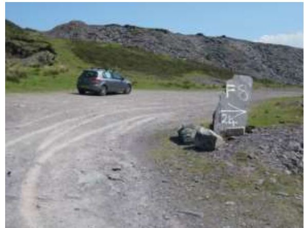
60. View from access of parking provision at terminus of unclassified road. Site is gravelled and show signs of use by vehicles.