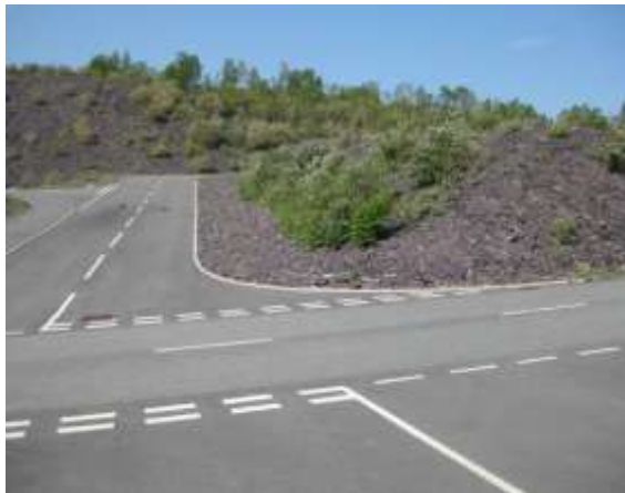
17. Glyn Rhonwy crossroads with priority north/south. Priority junction heads towards platform area.