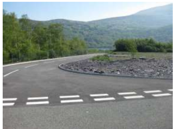
13. Newly constructed priority junction off Industrial Estate road.