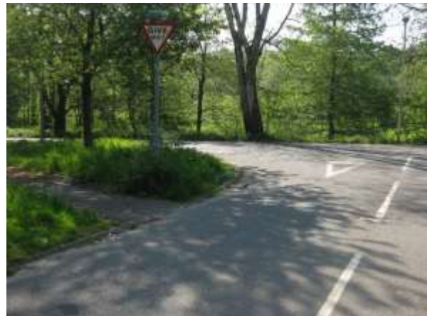
24. This junction provides an access onto the local highway network from the site and accommodates highway signage. There is a narrow tarmacked footway to the western side.