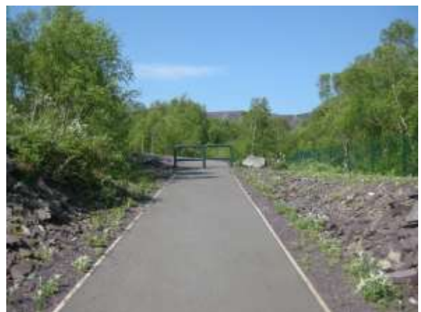
2. North view to newly constructed footway with pedestrian barrier railings.