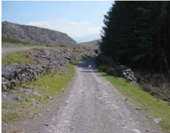
61. View east on to unnamed single track road below small gravelled parking area.