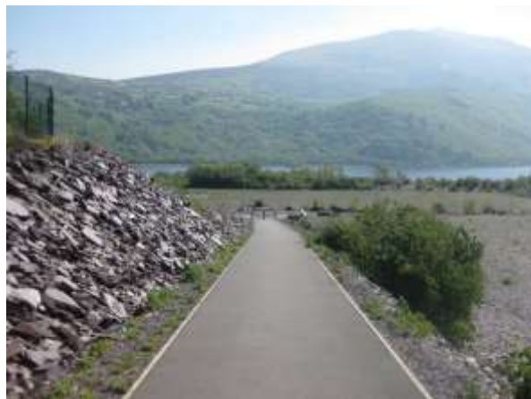
3. View south on to newly constructed footway.