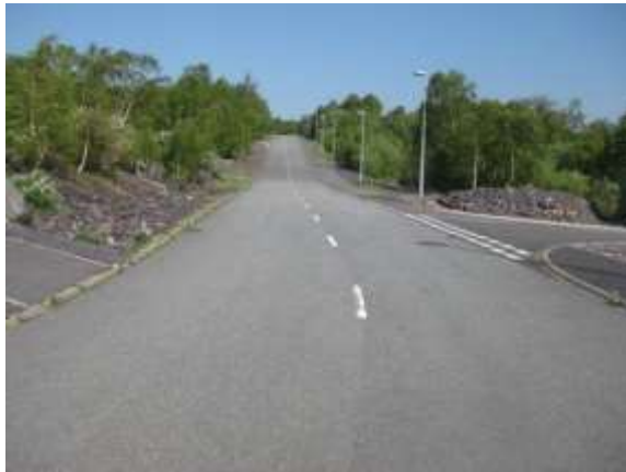
15. View south on to newly constructed highway, with priority junction to the east.