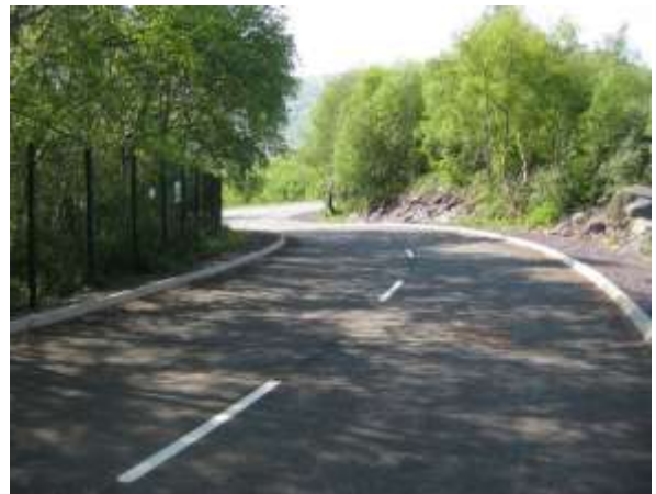
8. View south - Loosely surfaced footway at either side of newly constructed highway.