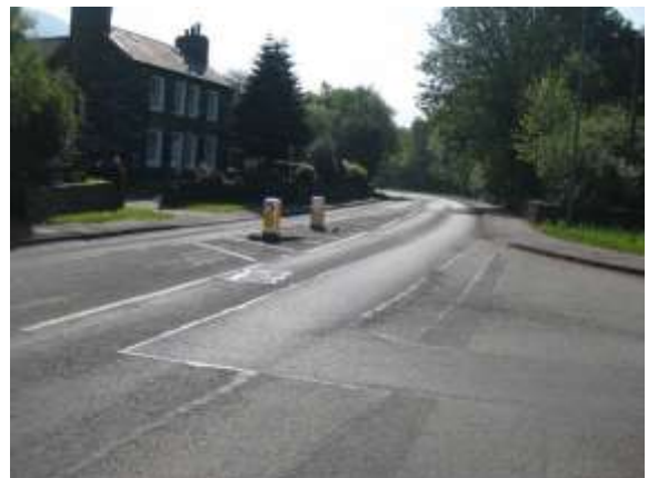
29. View west - A4086 towards A4244 and wider highway network.