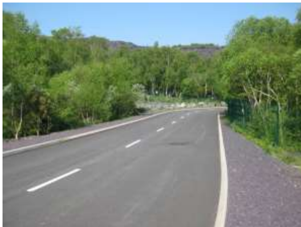
7. View north - Loosely surfaced footway at either side of newly constructed highway.