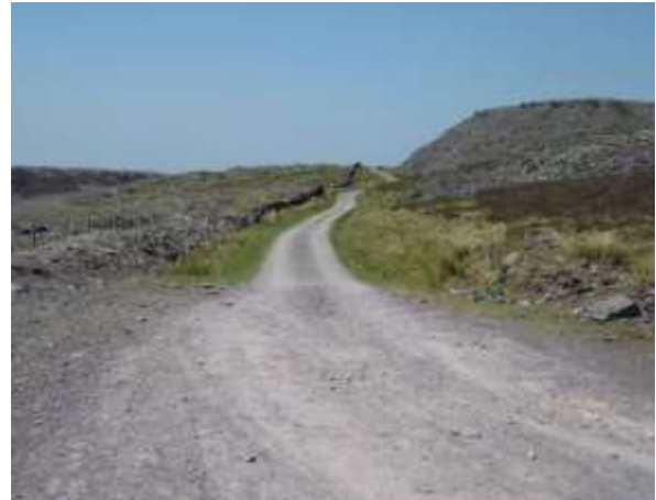
62. View west from access of parking provision at terminus of unclassified road.

The carriageway through Croesywaun and east towards Groeslon is narrow with occasional buildings and parked vehicles to the north and south, particularly in proximity of the Groeslon crossroads.