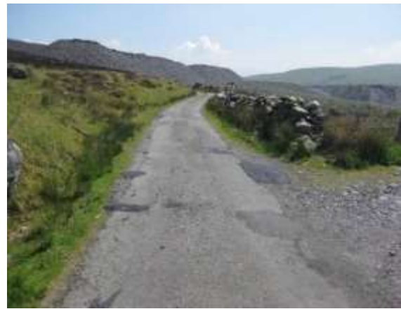
58. The quarry access road is of mixed condition throughout. There are existing signs of cracking and there is no kerblines just a grass verge. Remains from previous quarry activity feature to the left of the highway.