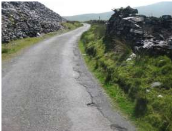
57. The remains of historical quarrying activity are evident along the course of the access road.