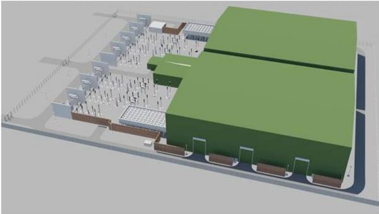
Diagram 2 Typical Layout of a 1000MW HVDC Converter Station