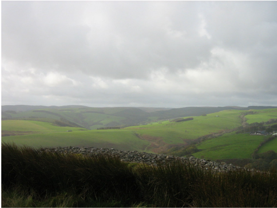
Present view southwest toward site