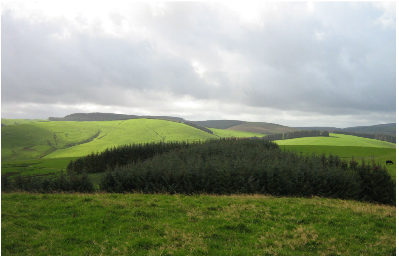
Present view southwest toward site