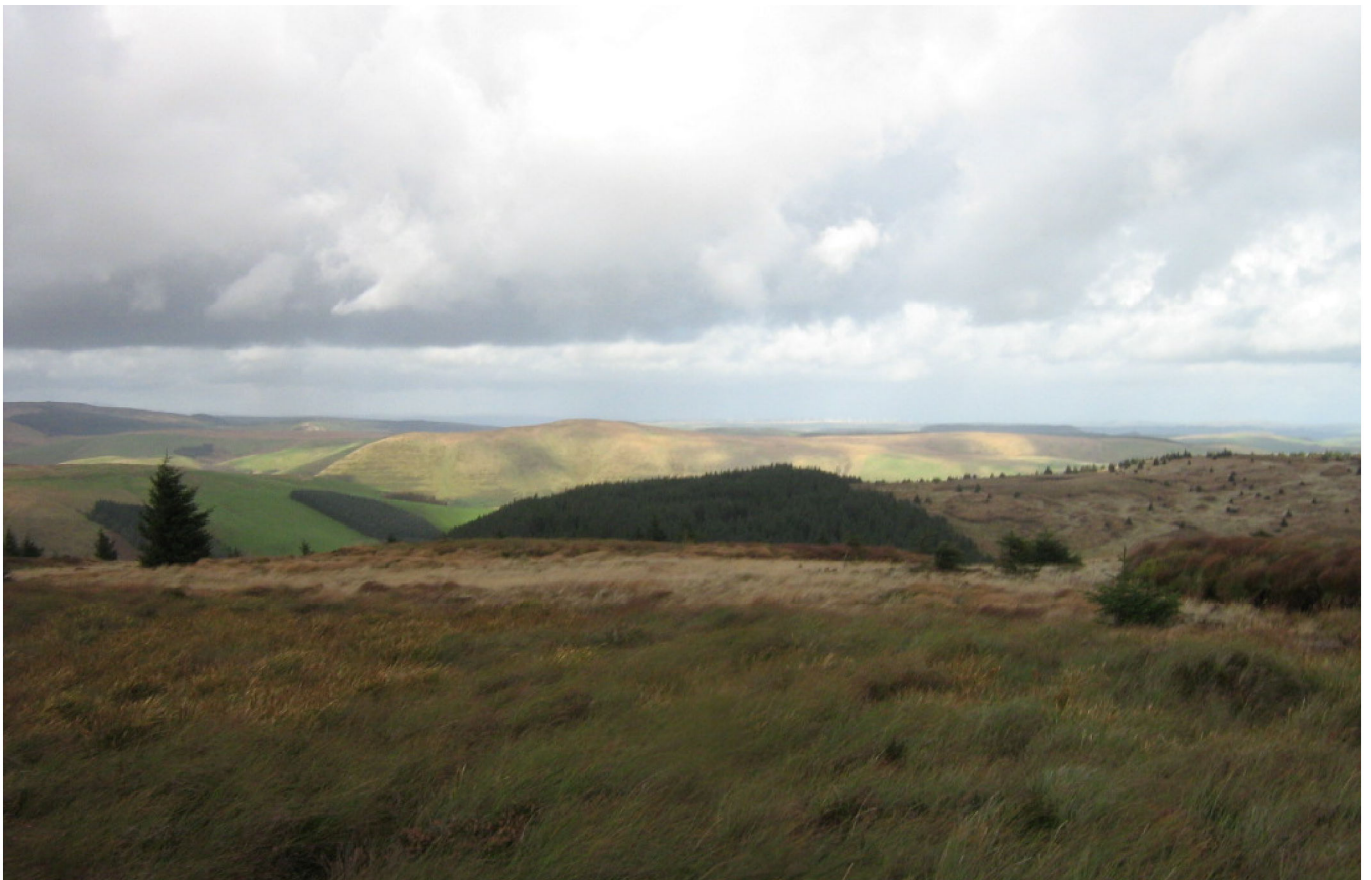
Present view NNE toward site