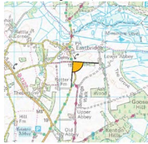
End of US1

• VP7: Sandlings Walk/Sustrans Route south of Eastbridge