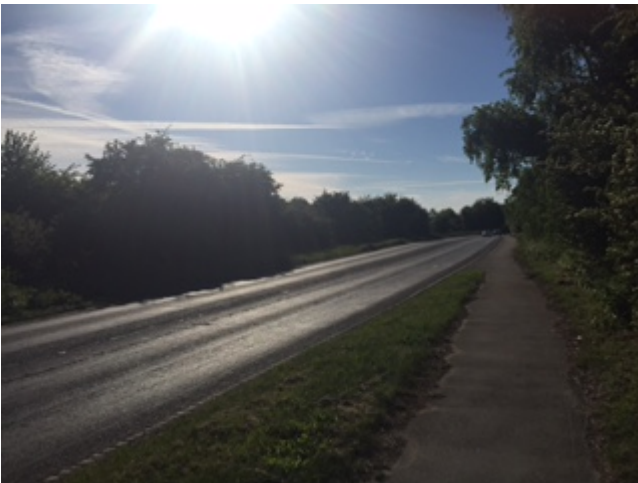
Opposite side of road showing poor visibility of crossing zone