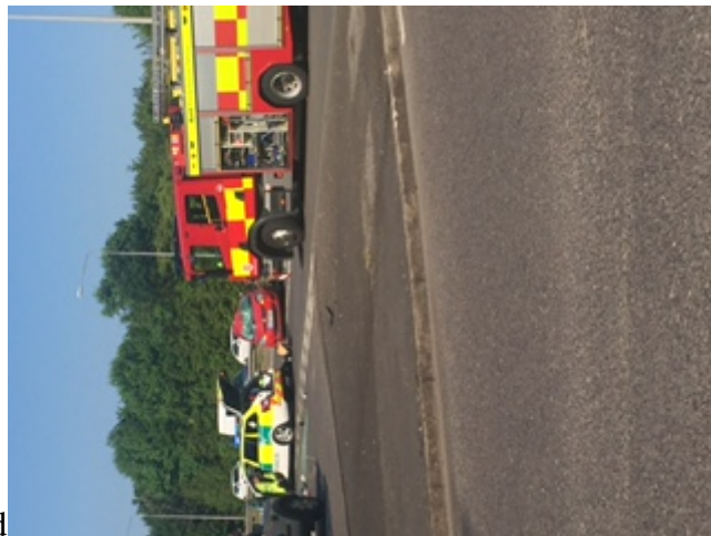
Recent serious crash at Barrey Road

There has been another serious crash at the Mersham junction with the A20.