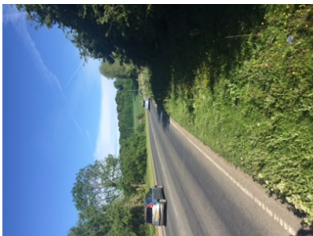
End of footbridge looking east

These images relate to the Kingsford Street Bridge junction with the A20 showing the danger of crossing.