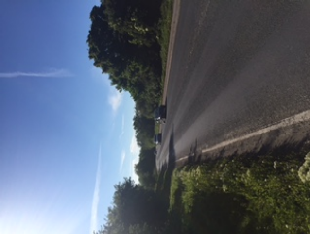
End of footbridge looking west